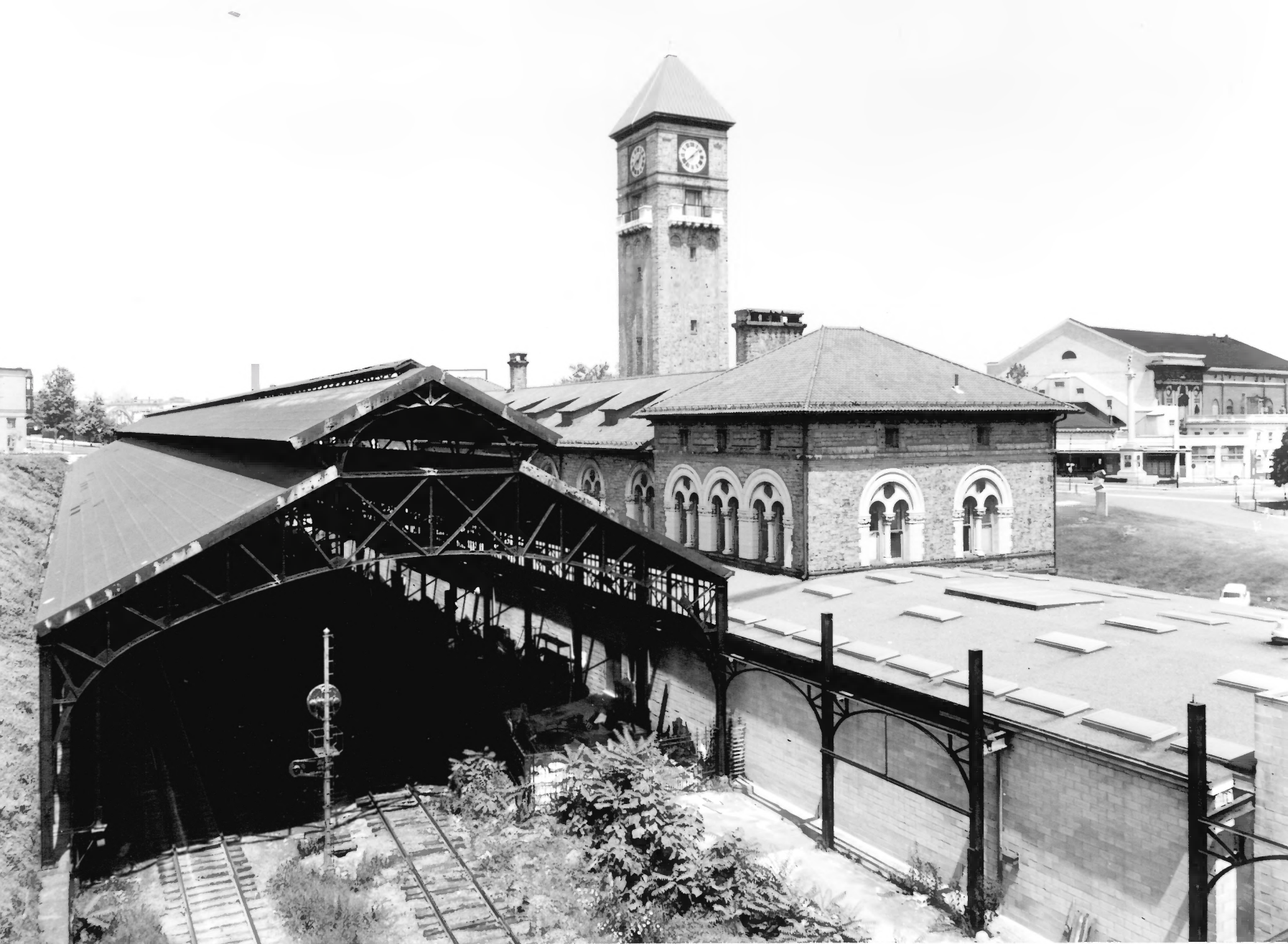
Mount Royal Station, Baltimore, Maryland 1400 Cathedral Street