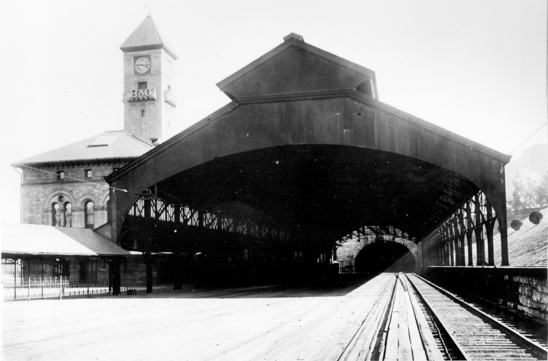
Mount Royal Station, Baltimore, Maryland 1400 Cathedral Street