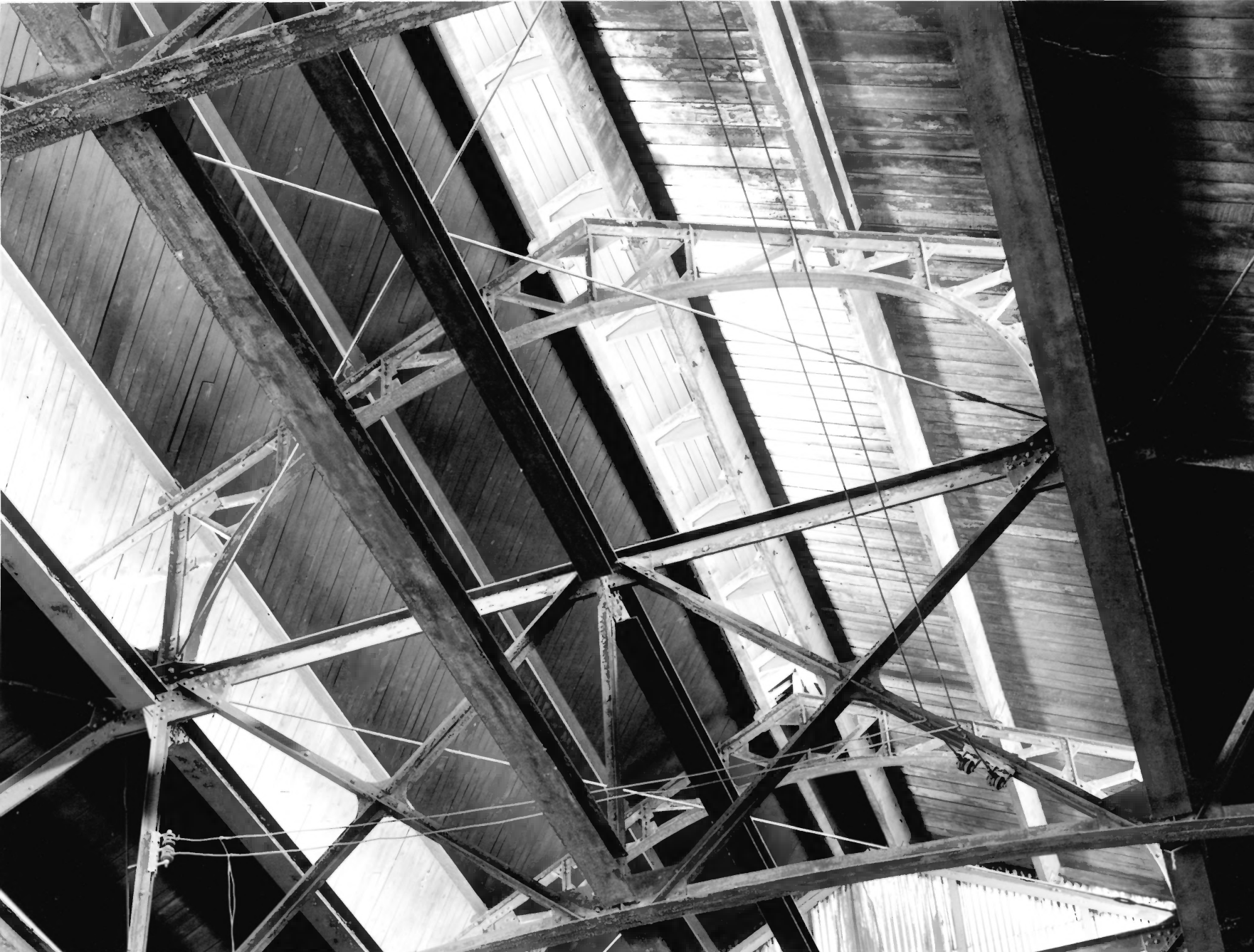
Mount Royal Station, Baltimore, Maryland 1400 Cathedral Street