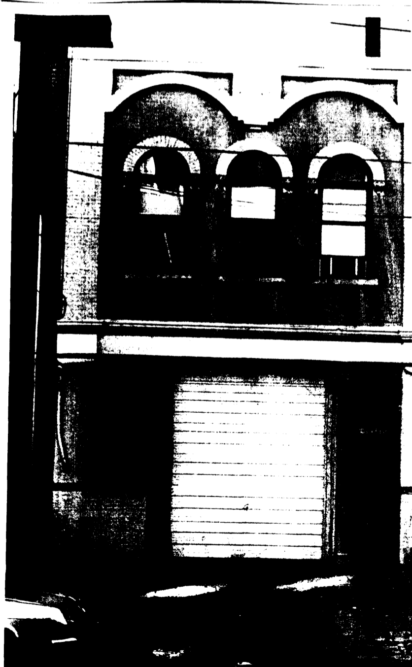
Chemical Engine No. 4 Hook and Ladder Co. No. 1

From: Hoboken Board of Trade Bulletin, vol III, of Nov. 1912, p. 92.