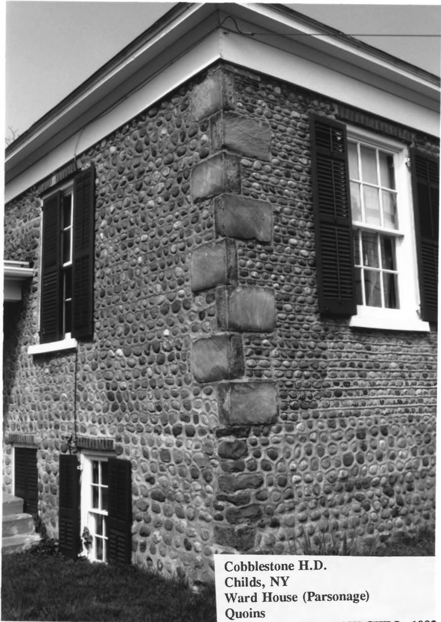
Cobblestone H.D. Childs, NY Ward House (Parsonage) Quoins Photo: Nancy Todd NY SHPO, 1992