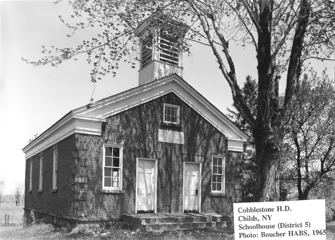
Cobblestone H.D. Childs, NY Schoolhouse (District 5) Photo: Boucher HABS, 1965