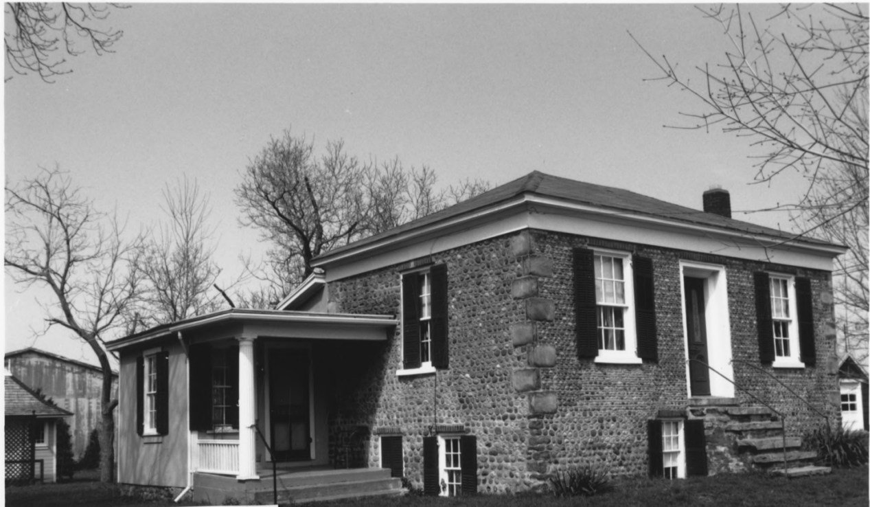
Cobblestone H.D. Childs, NY Ward House (Parsonage) Front & West Elevation Photo: Nancy Todd NY SHPO, 1992