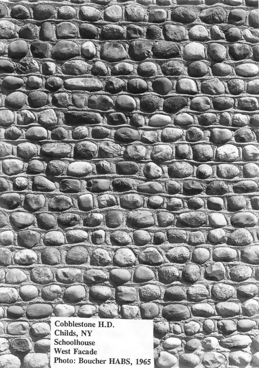
Cobblestone H.D. Childs, NY Schoolhouse West Facade Photo: Boucher HABS, 1965