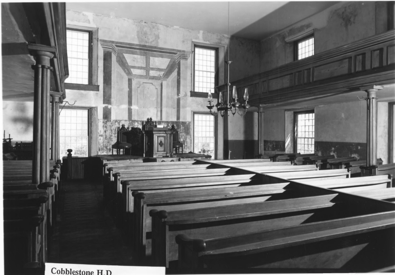
Cobblestone H.D. Childs, NY Universalist Church Altar