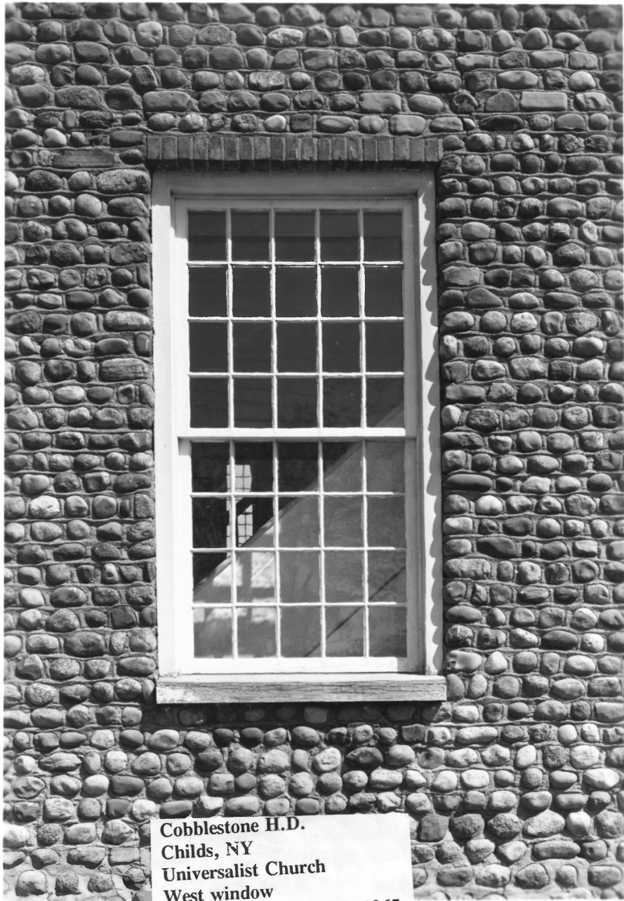
Cobblestone H.D. Childs, NY Universalist Church West window Photo: Boucher HABS, 1965