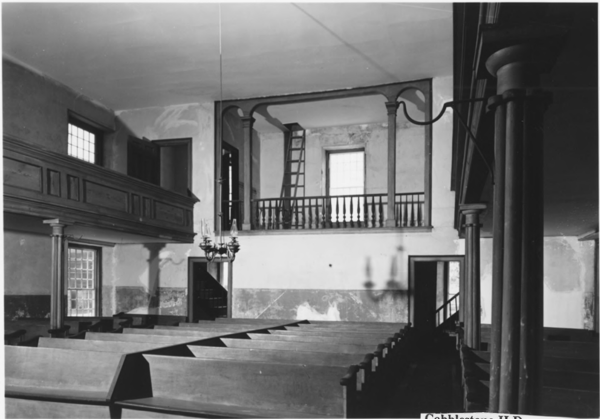
Cobblestone H.D. Childs, NY Universalist Church Rear Photo: Boucher HABS, 1965