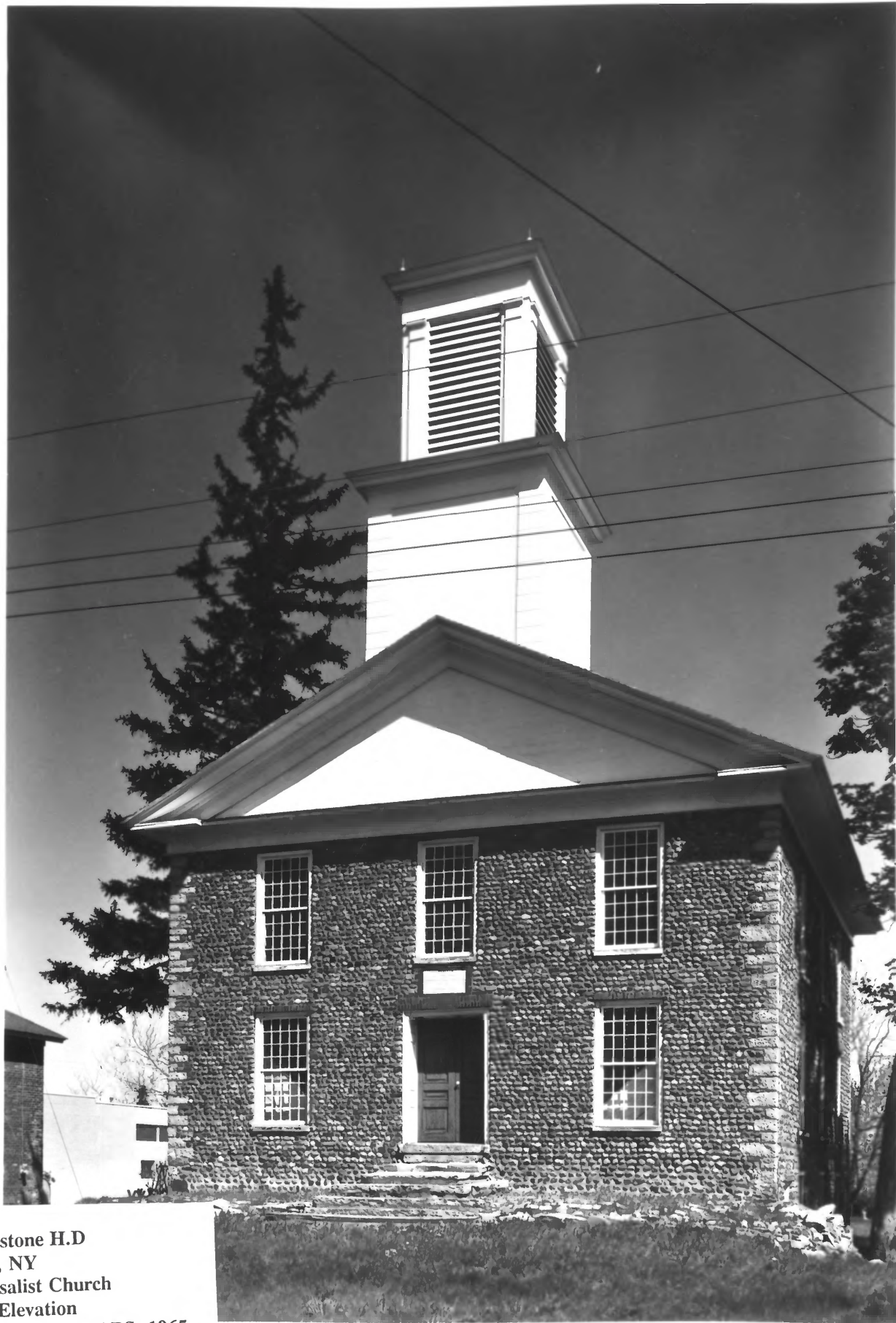
Cobblestone H.D Childs, NY Universalist Church Front Elevation Photo: Boucher HABS, 1965