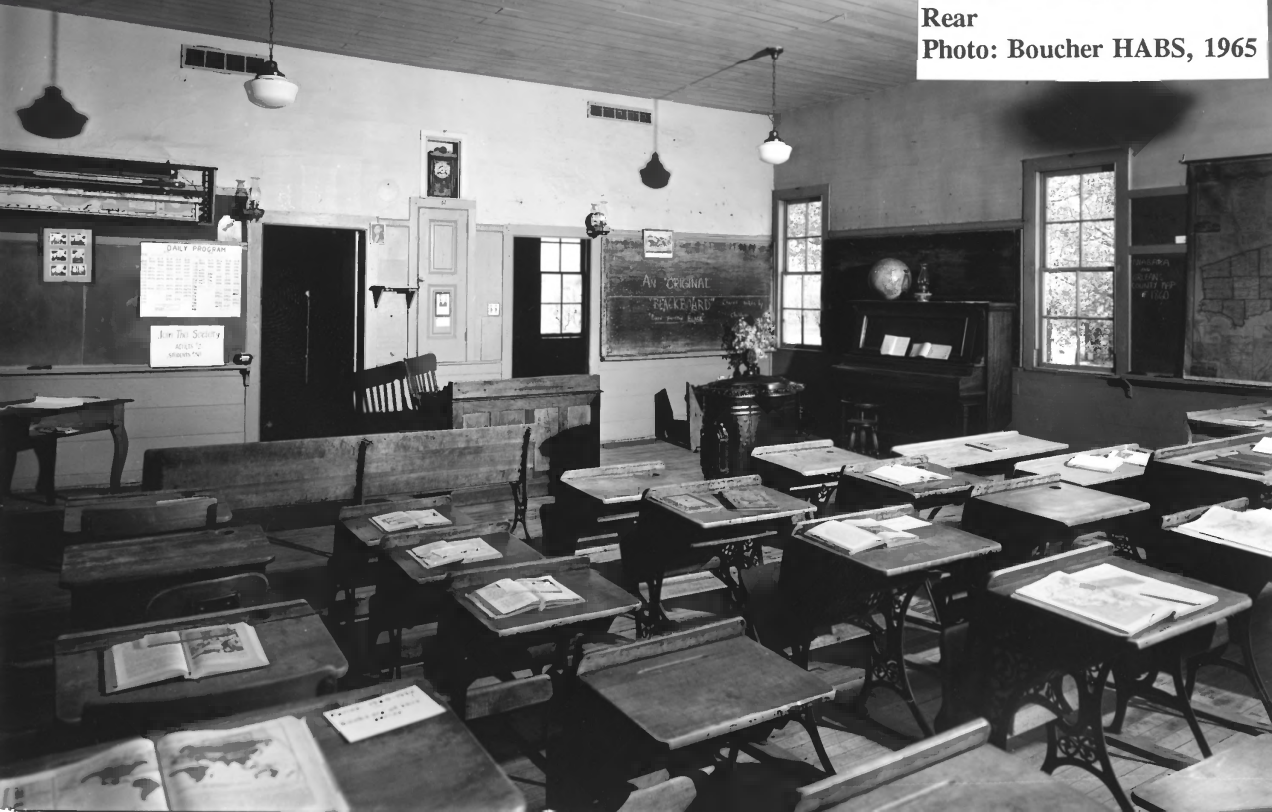
Cobblestone H.D. Childs, NY Universalist Church Rear Photo: Boucher HABS, 1965