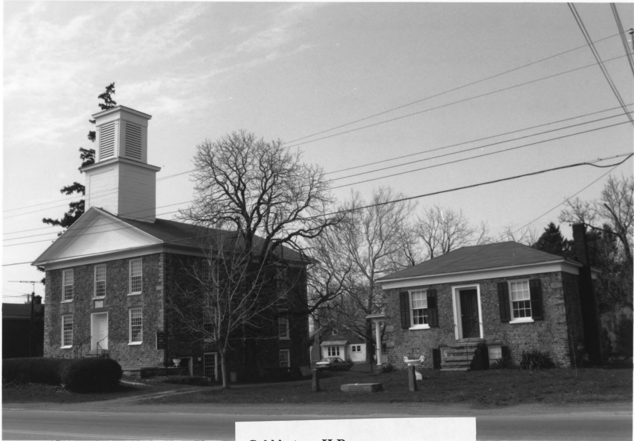
Cobblestone H.D. Childs, NY Universalist Church & Ward House South Elevation Photo: Nancy Todd, NY SHPO, 1992