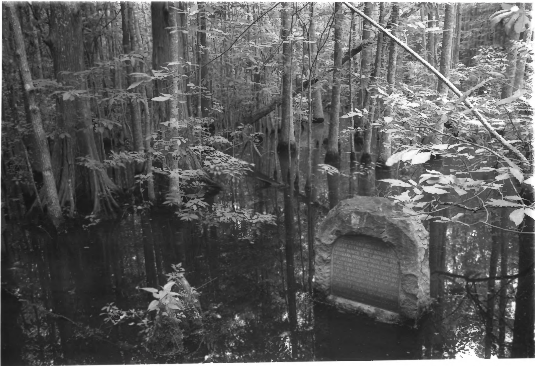
Beginning Point of the Louisiana Purchase Survey, Arkansas The memorial marker at this site rests in an area essentially unchanged since the survey in 1815.