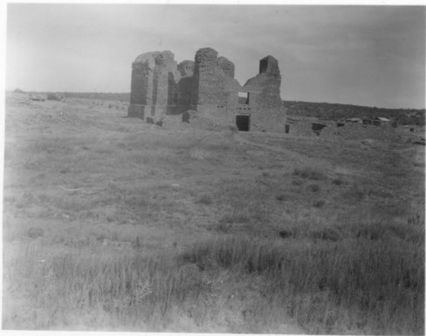
La Purisima Concepcion de Quarai Mission, Quarai State Monument, New Mexico. Interior of church.