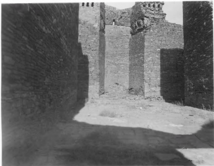
La Purisima Concepcion de Quarai Mission, Quarai State Monument, New Mexico. Looking north, church and convento.