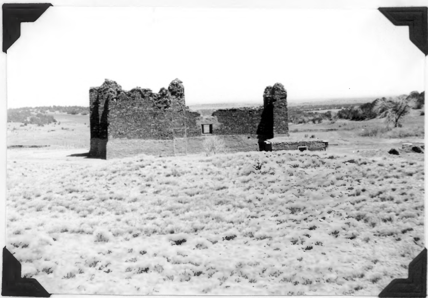
2. The church of Quarai, from the pueblo ruins, looking East.