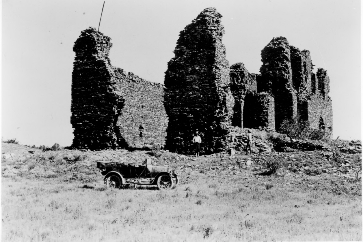
Quarai before Excavation and Stabilization