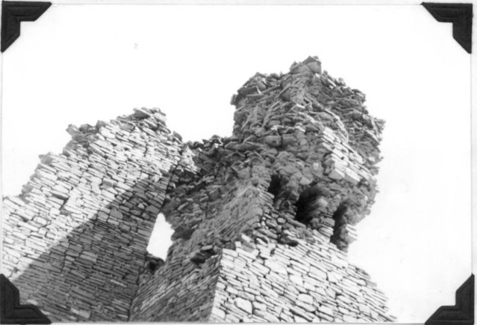
6a and b. Details from figure 5.