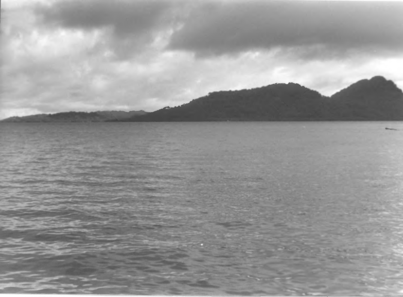
6. Dublon Island, Truk. Most of the Japanese naval facilities were constructed on Dublon.