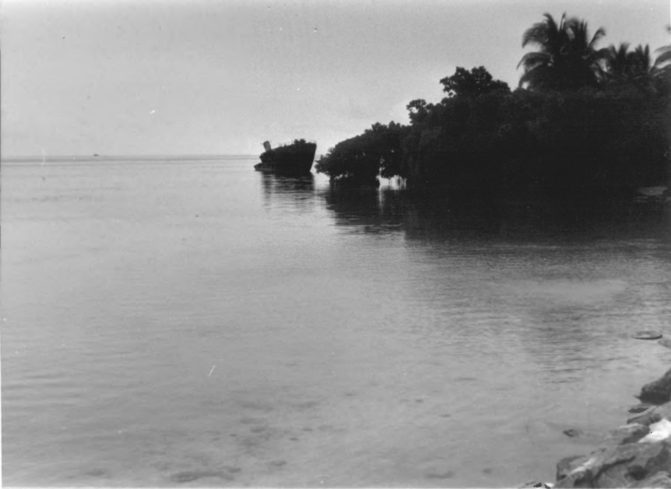
7. A beached vessel on the west coast of Moen Island. Local people claim this was a Japanese vessel beached in World War II.