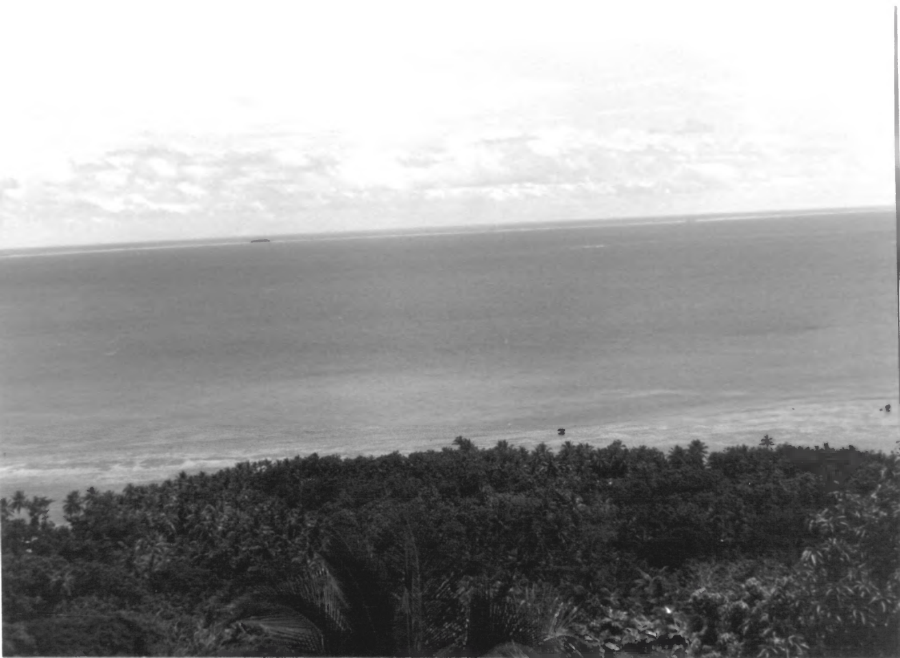
5. Truk Lagoon from Moen Island. The thin white line of the coral reef and a small islet appear on the horizon.