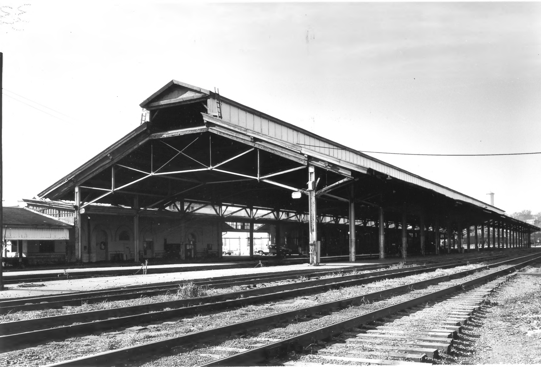
Montgomery Union Station, Montgomery, Alabama NW side of Water Street, opposite Lee Street