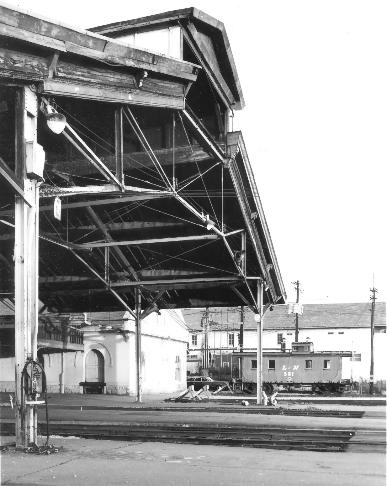
Montgomery Union Station, Montgomery, Alabama NW side of Water, opposite Lee Street