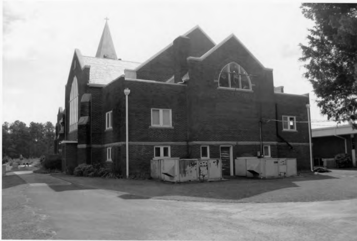
8. Cedar Grove Lutheran Church 1220 Cedar Grove Road, Leesville Lexington County, South Carolina