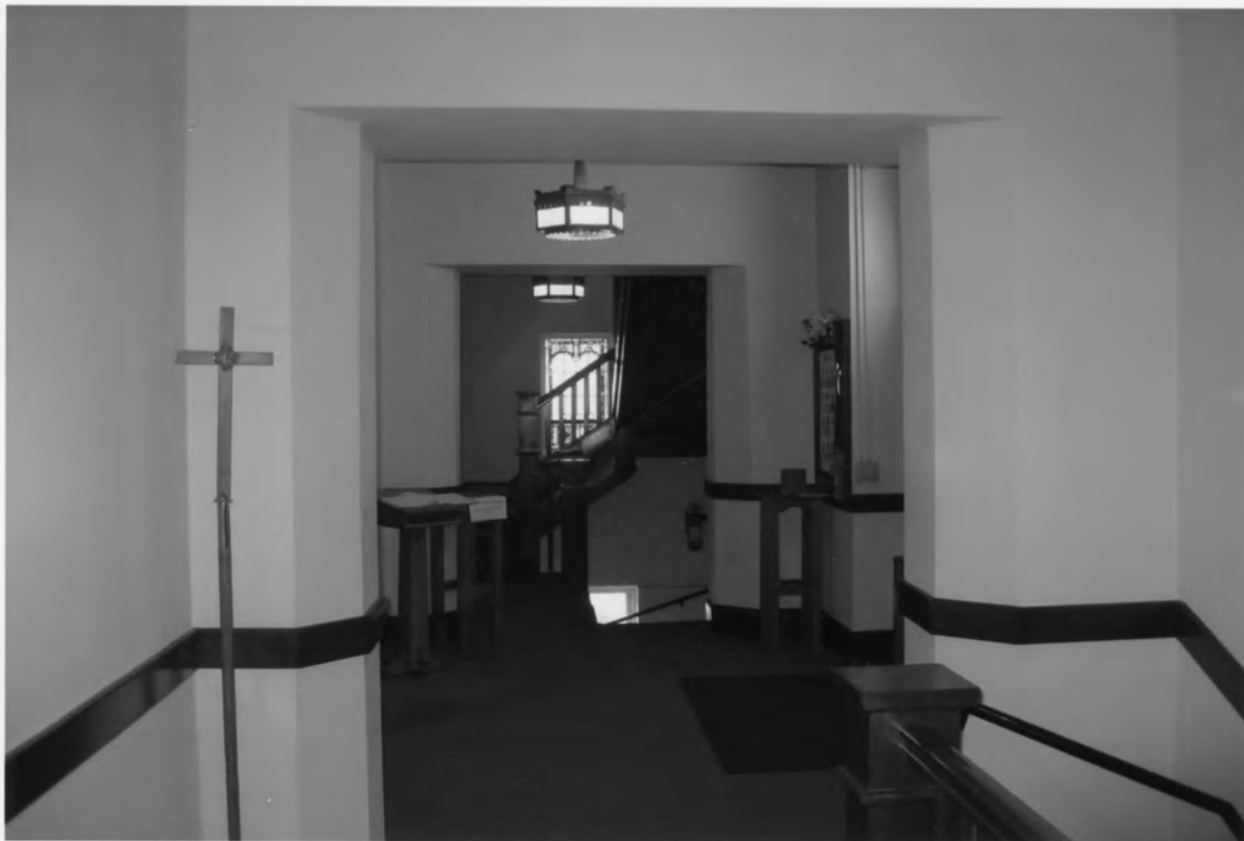
13. Cedar Grove Lutheran Church 1220 Cedar Grove Road, Leesville Lexington County, South Carolina