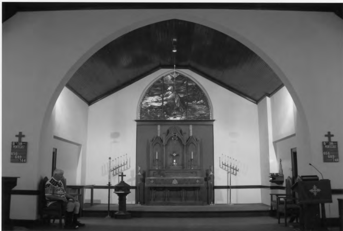
14. Cedar Grove Lutheran Church 1220 Cedar Grove Road, Leesville Lexington County, South Carolina