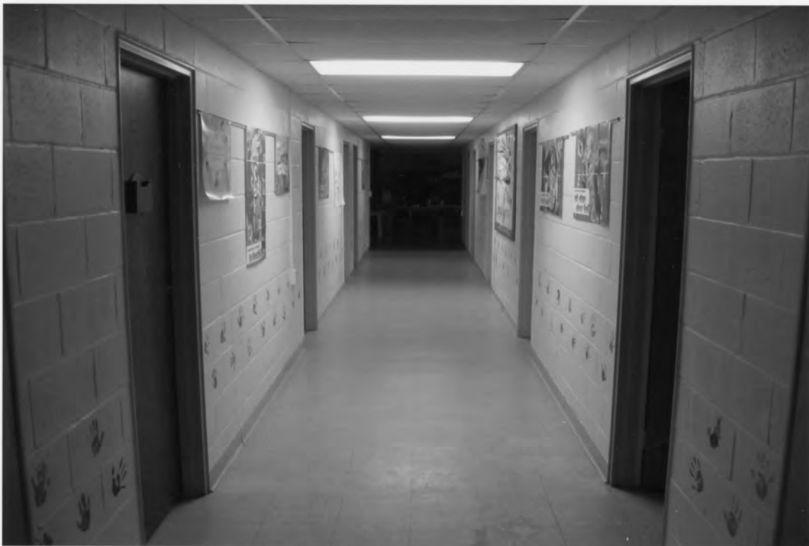
22. Cedar Grove Lutheran Church 1220 Cedar Grove Road, Leesville Lexington County, South Carolina