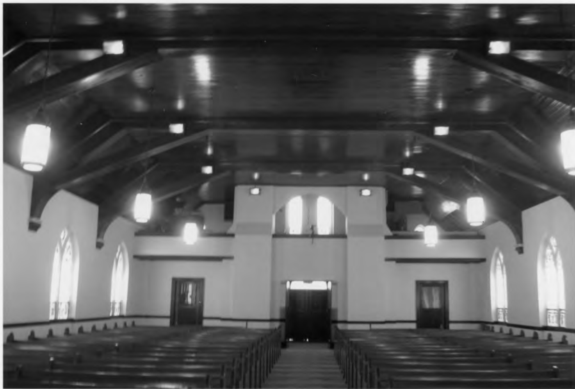
17. Cedar Grove Lutheran Church 1220 Cedar Grove Road, Leesville Lexington County, South Carolina