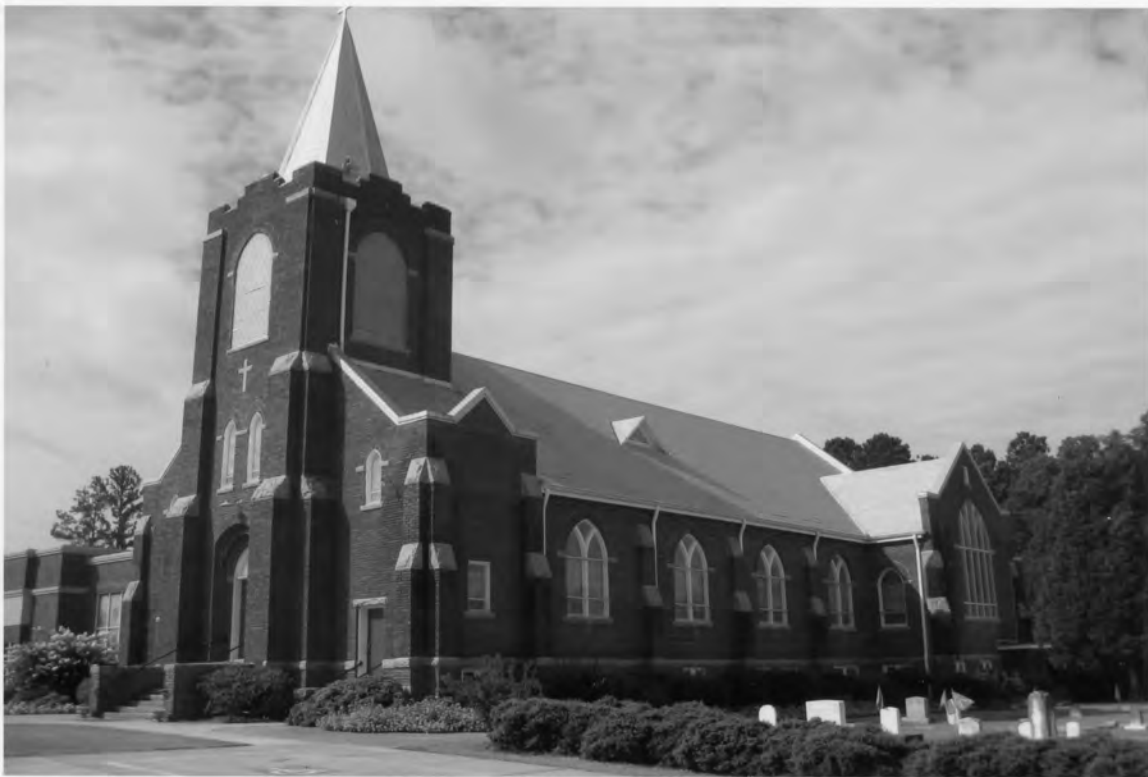
5. Cedar Grove Lutheran Church 1220 Cedar Grove Road, Leesville Lexington County, South Carolina