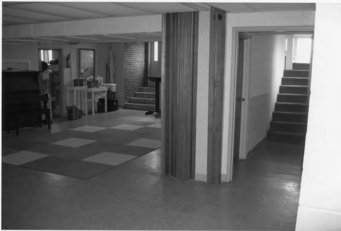
23. Cedar Grove Lutheran Church 1220 Cedar Grove Road, Leesville Lexington County, South Carolina

Basement common room with north staircase