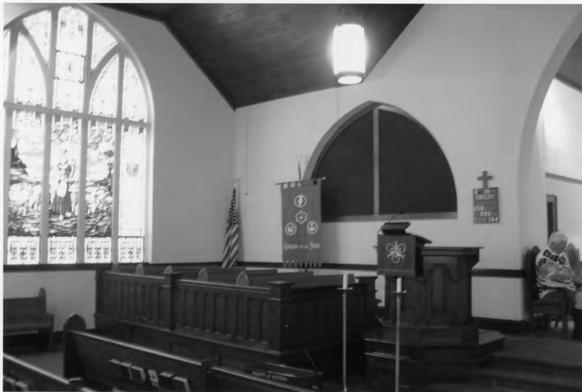
16. Cedar Grove Lutheran Church 1220 Cedar Grove Road, Leesville Lexington County, South Carolina