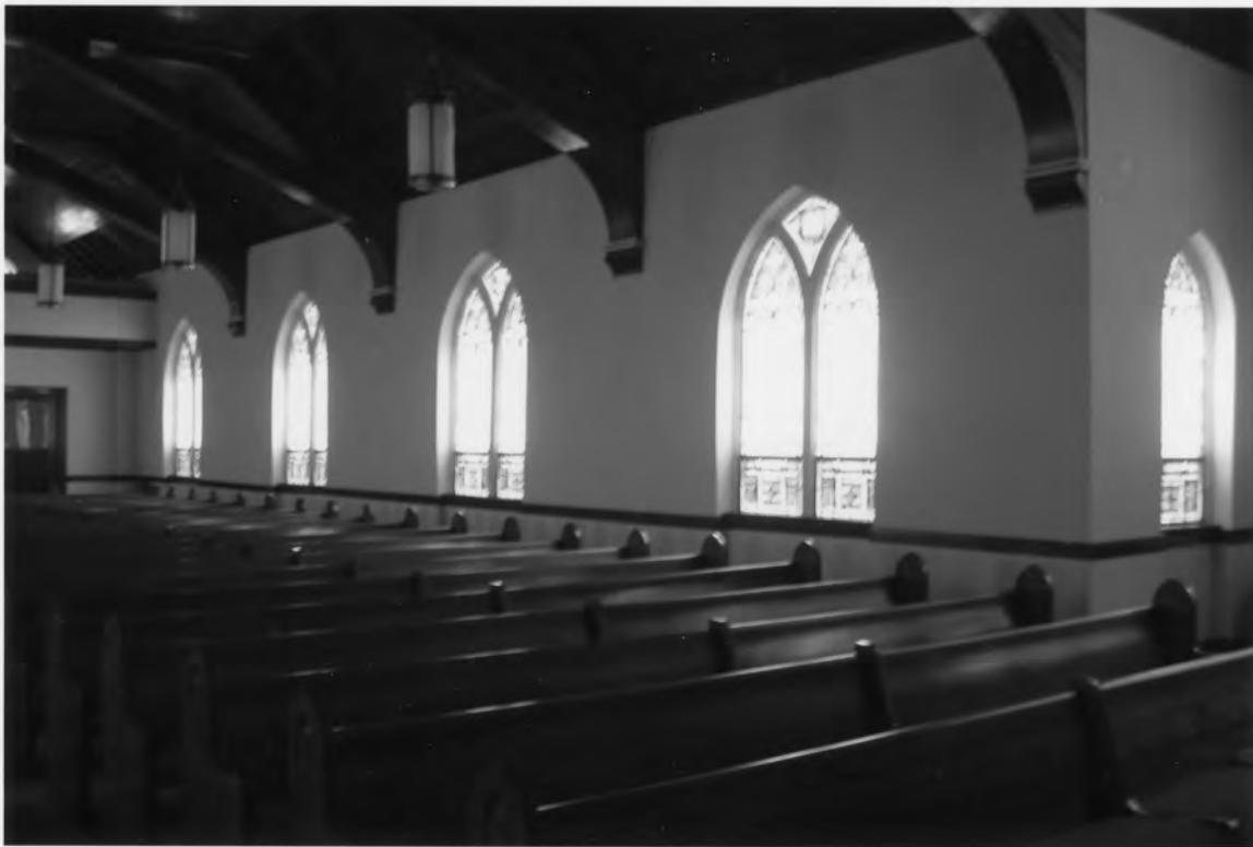
15. Cedar Grove Lutheran Church 1220 Cedar Grove Road, Leesville Lexington County, South Carolina