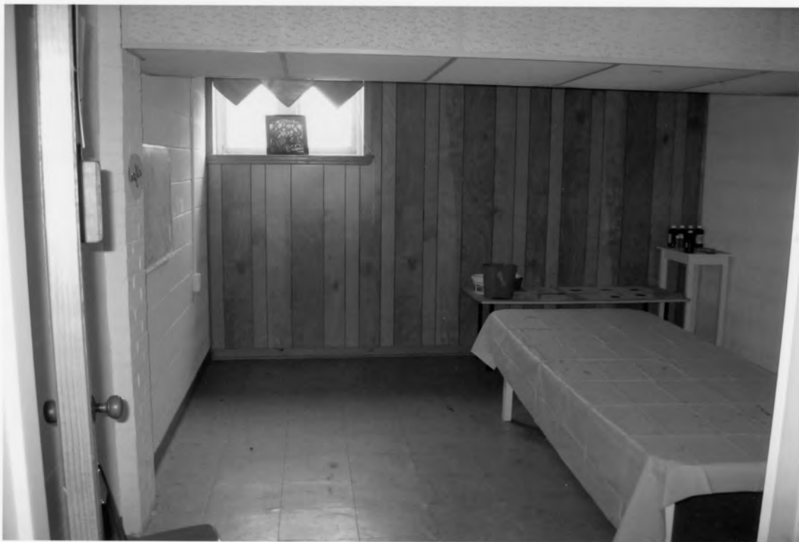
24. Cedar Grove Lutheran Church 1220 Cedar Grove Road, Leesville Lexington County, South Carolina