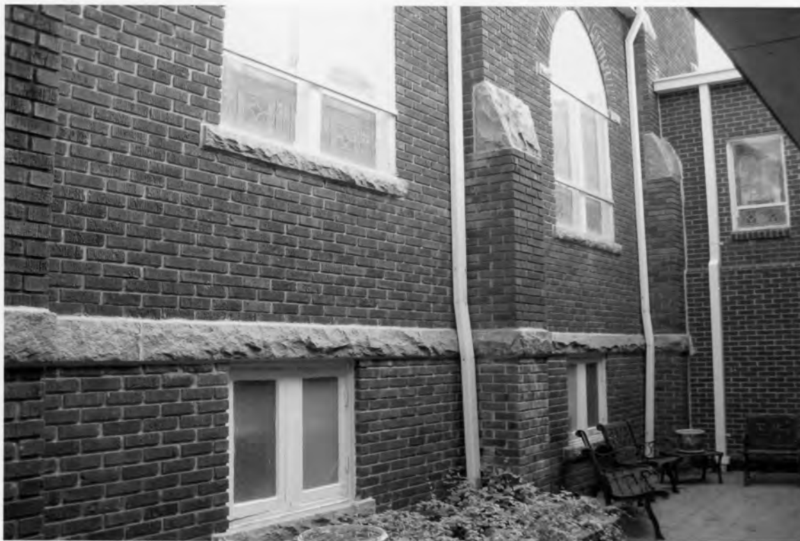
10. Cedar Grove Lutheran Church 1220 Cedar Grove Road, Leesville Lexington County, South Carolina