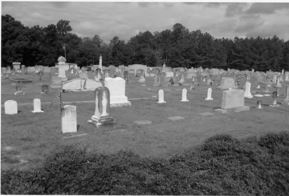
25. Cedar Grove Lutheran Church 1220 Cedar Grove Road, Leesville Lexington County, South Carolina