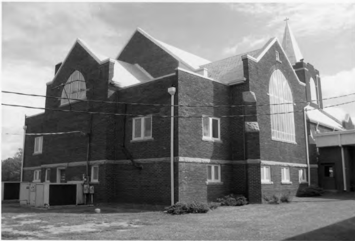
9. Cedar Grove Lutheran Church 1220 Cedar Grove Road, Leesville Lexington County, South Carolina