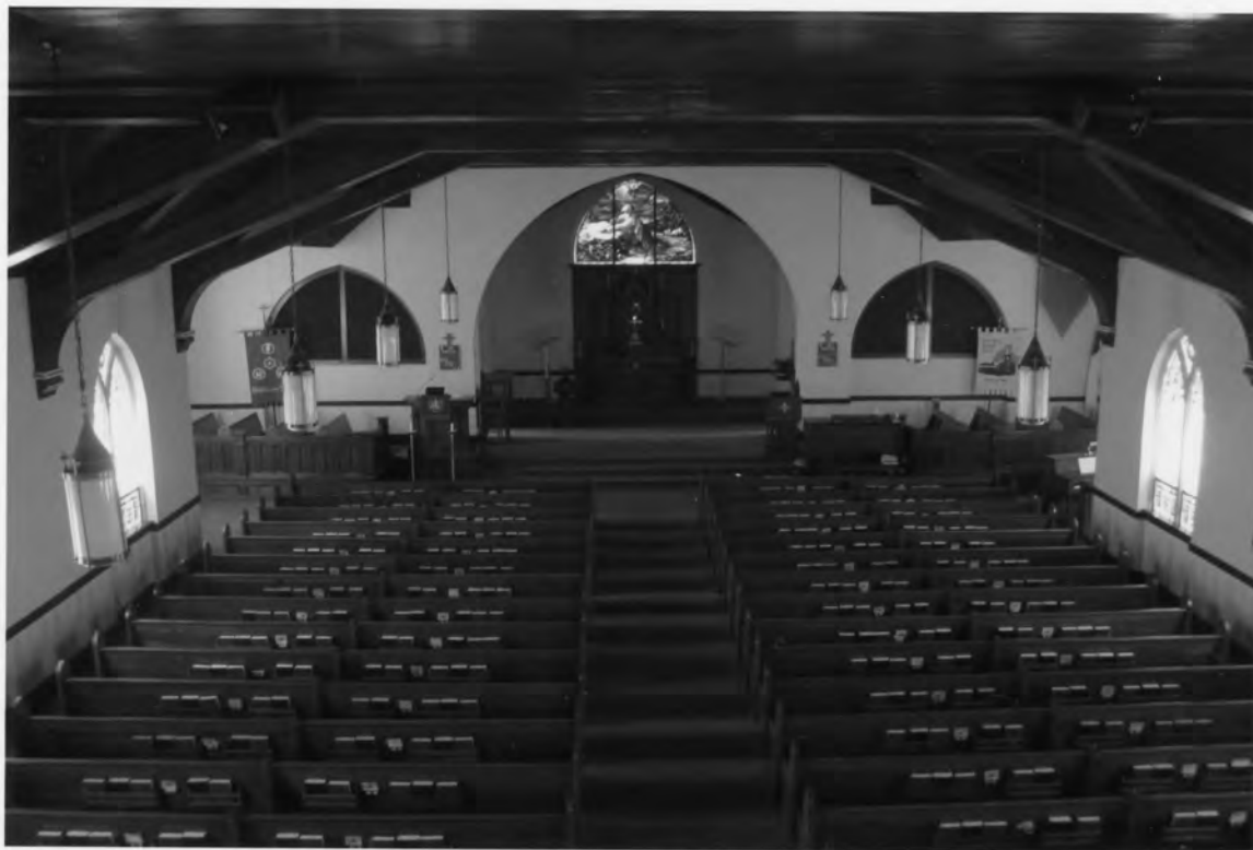
20. Cedar Grove Lutheran Church 1220 Cedar Grove Road, Leesville Lexington County, South Carolina