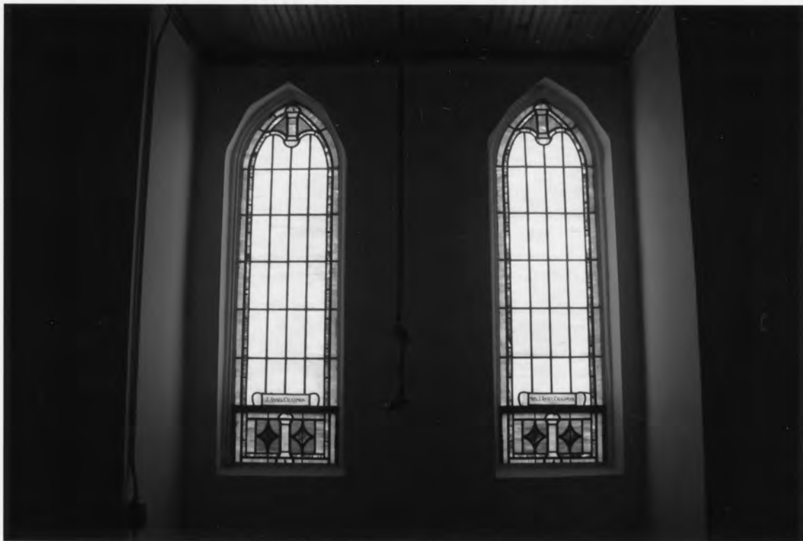
21. Cedar Grove Lutheran Church 1220 Cedar Grove Road, Leesville Lexington County, South Carolina