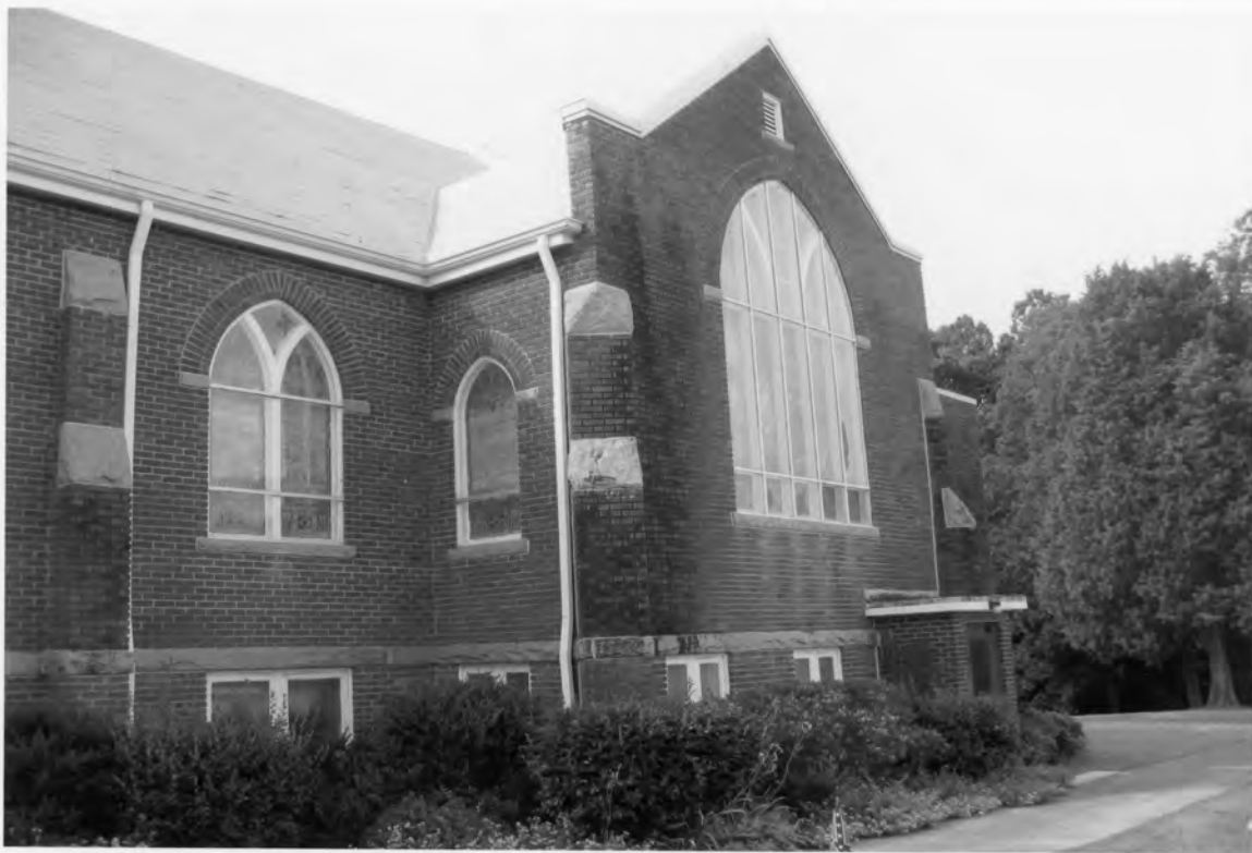
7. Cedar Grove Lutheran Church 1220 Cedar Grove Road, Leesville Lexington County, South Carolina