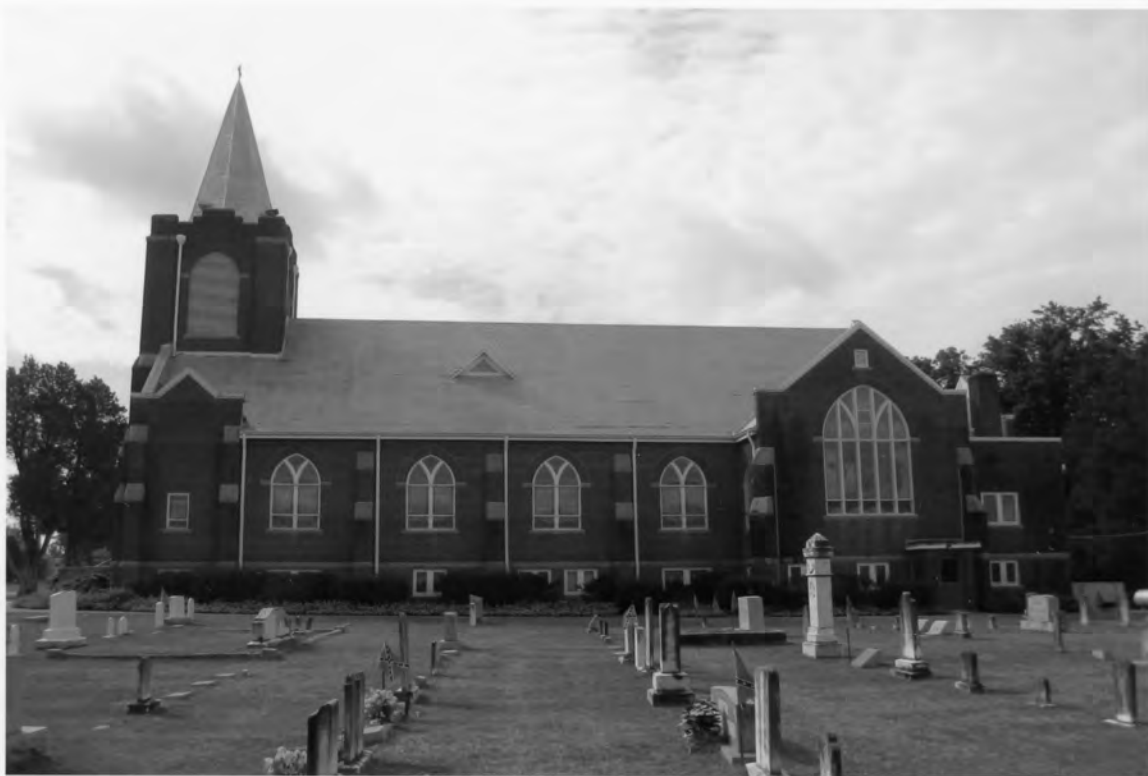
6. Cedar Grove Lutheran Church 1220 Cedar Grove Road, Leesville Lexington County, South Carolina