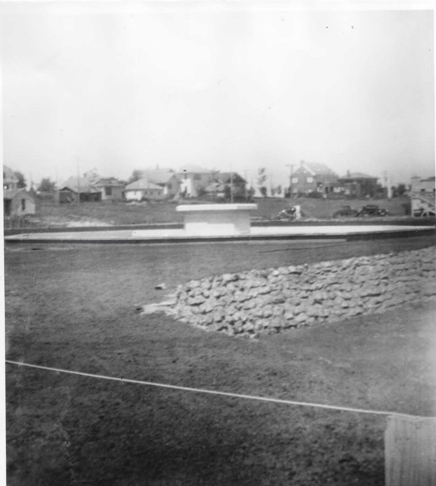
LANDSCAPING SWIMMING POOL GROUNDS - ALLIANCE - BOX BUTTE CO. 7-B15-55 - 8-20-35