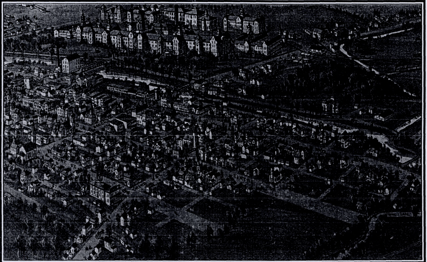
Fig. 1 This detail from the 1910 T. M. Fowler bird's eye view of the community shows the majority of the district as it existed at that time. Court Street was unopened beyond East Fourth Street and little existed north of Stone Coal Creek.