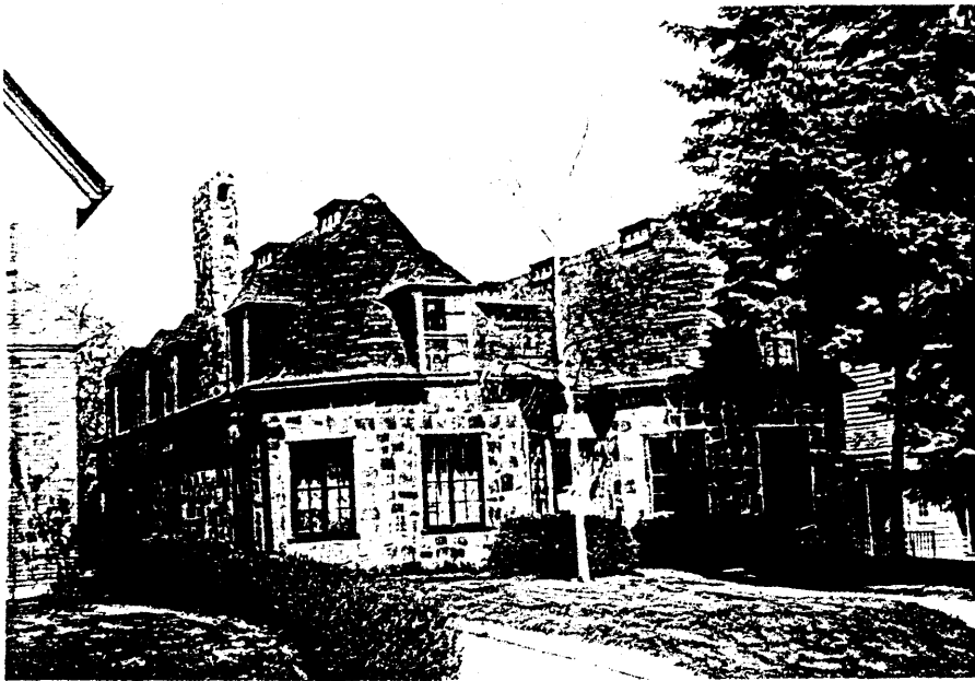
View from northeast