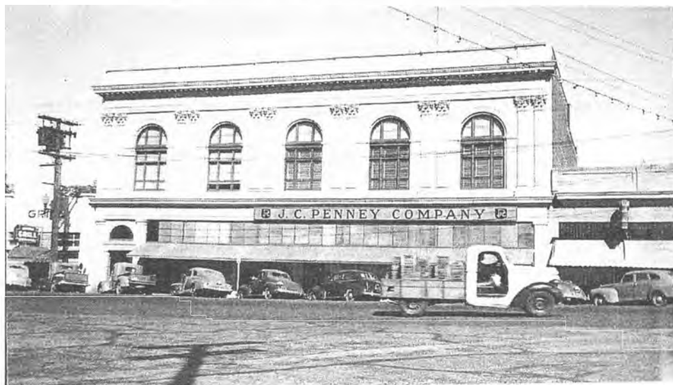
Figure 2: Historic photo of Masonic Hall, circa 1945