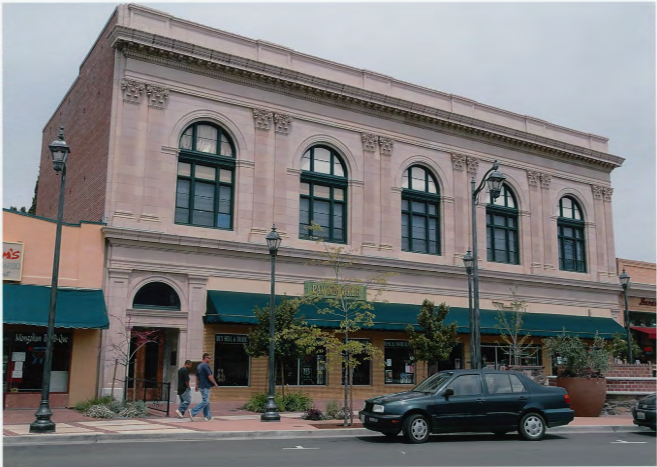
1. AUBURN MASONIC TEMPLE PLACER COUNTY, CA