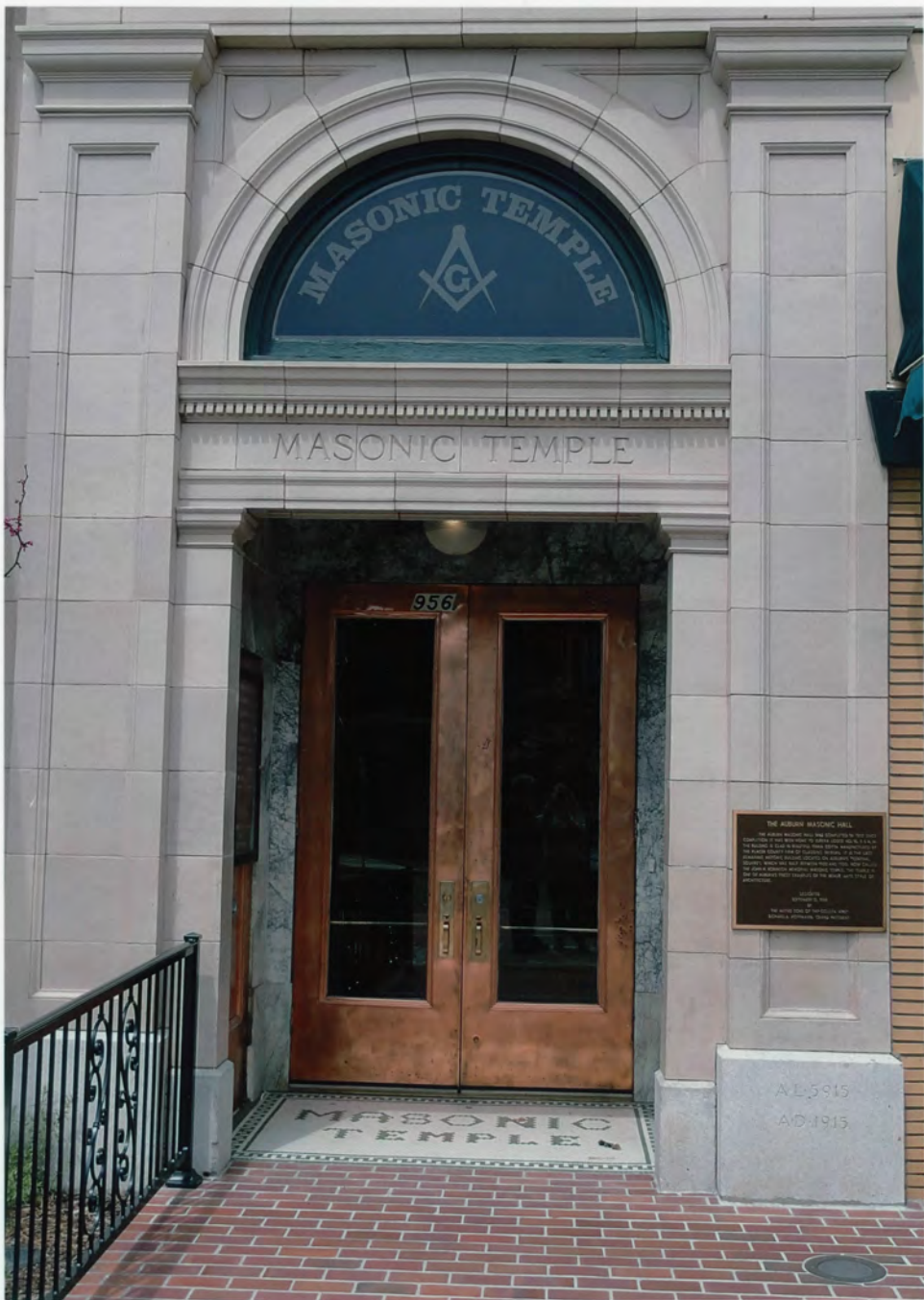
2. AUBURN MASONIC TEMPLE PLACER COUNTY, CA