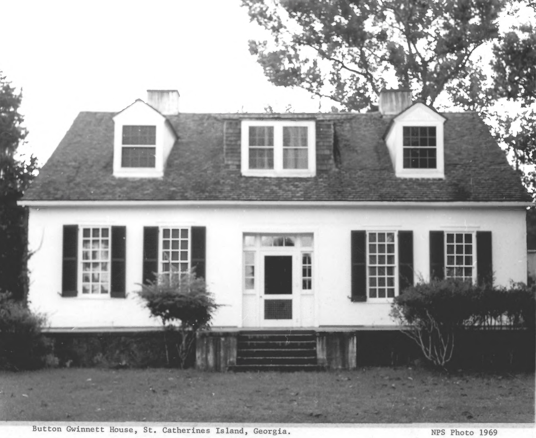
NPS Photo 1969