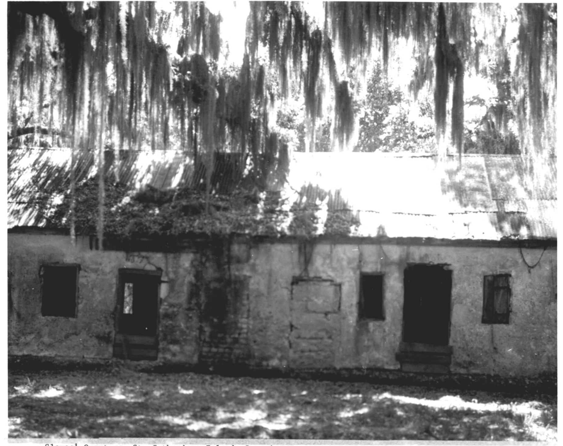
Slaves' Quarters, St. Catherines Island, Georgia.