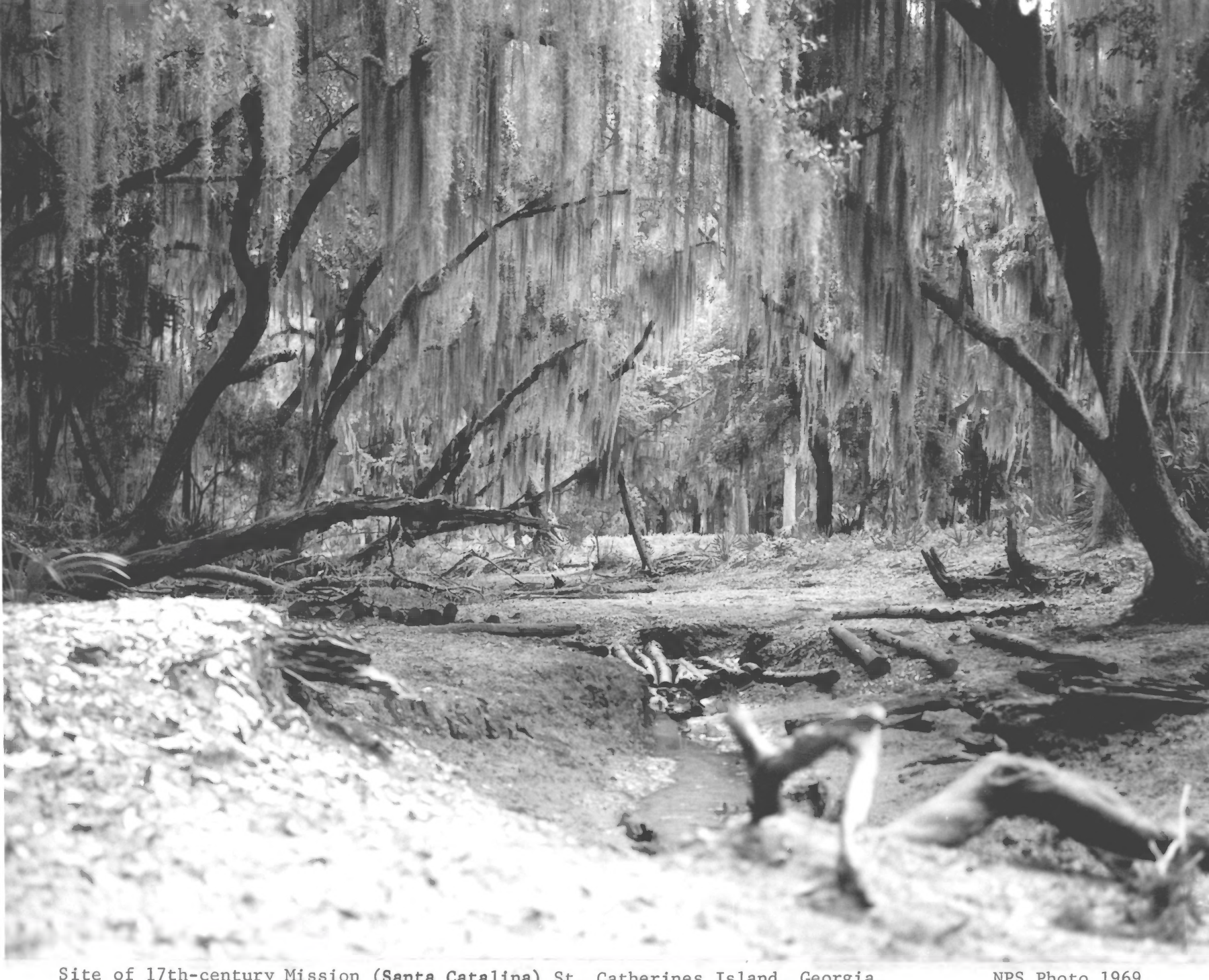
Site of 17th-century Mission (Santa Catalina) St. Catherines Island, Georgia.