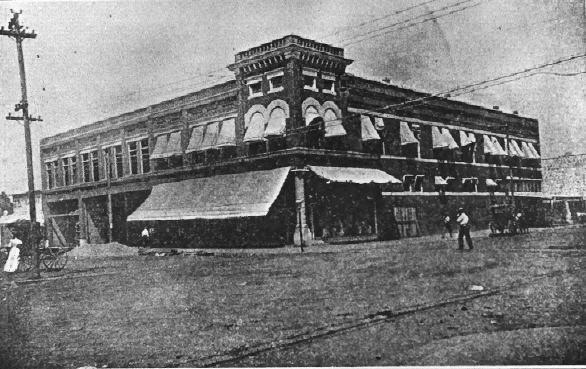
A LARGE MERCANTILE HOUSE ON A PROMINENT DOWNTOWN CORNER