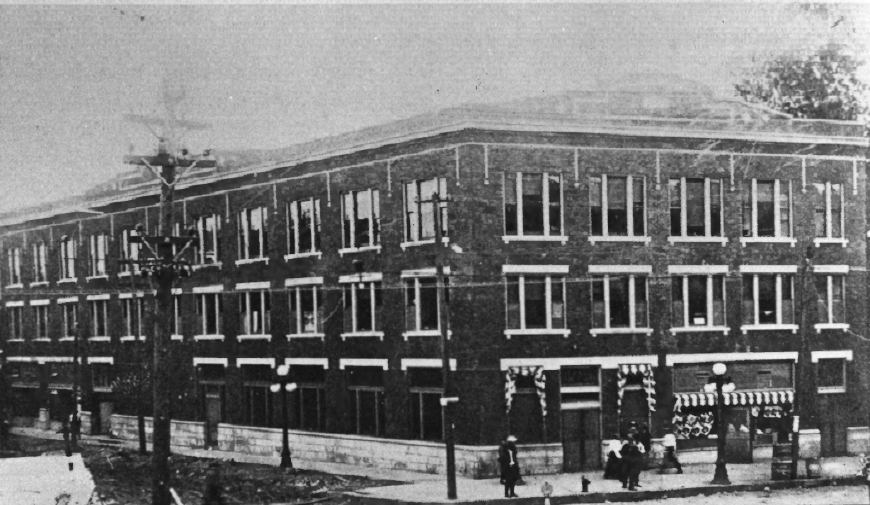
Post Office Building, 7th and Kihekah, Pawhuska, Okla.