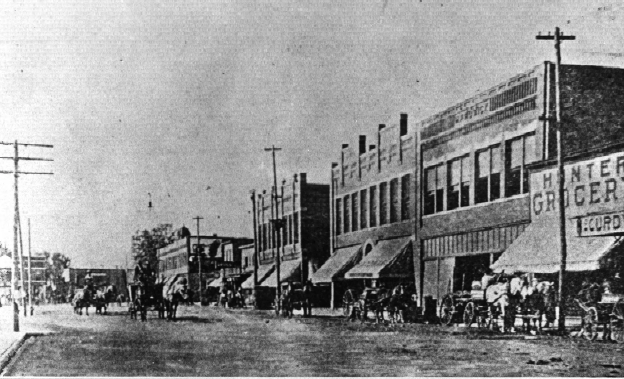
ONE OF PAWHUSKA'S PRINCIPAL BUSINESS STREETS