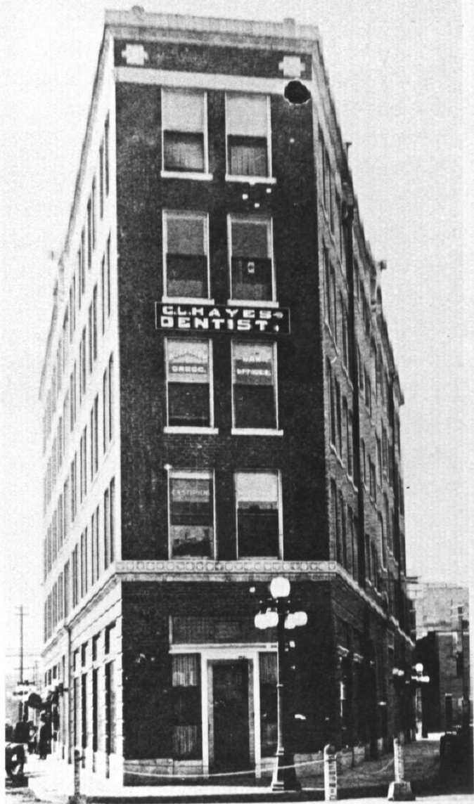
The Triangle Building, Pawhuska, Oklahoma