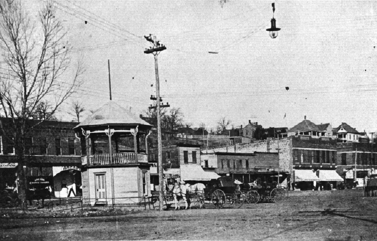
Bandstand and hitching area now site of Triangle Building