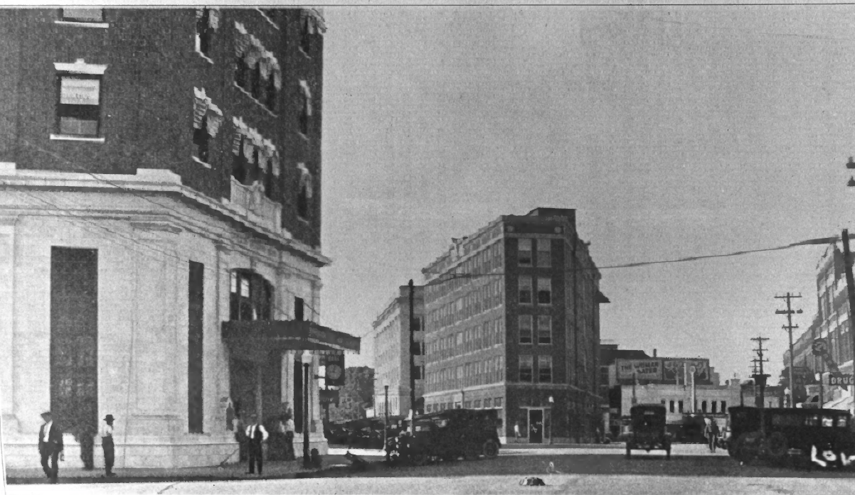
STREET SCENE LOOKING SOUTH ON KIHIKAH AVENUE