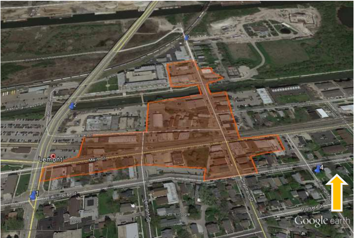
Lemont Downtown Commercial District Lemont, Cook County, IL