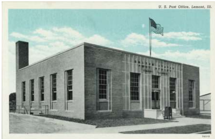
Above: Postcard of Budnik Building, 1927 Below: Postcard of U.S. Post Office, 1937