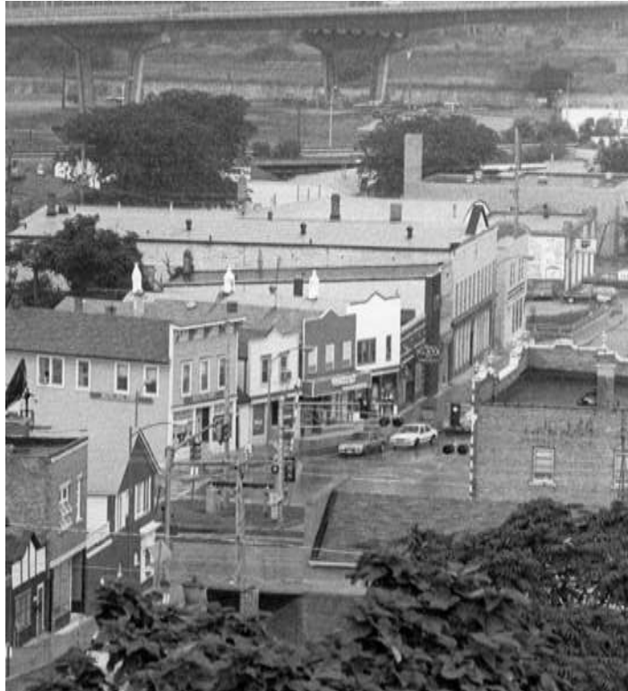
Above: Canal Street from Stephen Street, looking west, n.d. Below: Stephen Street, looking north, ca. 1980s Courtesy Lemont Historical Society Archives