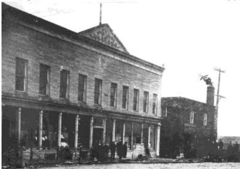
Above: Canal and Lemont Streets, looking east, n.d.