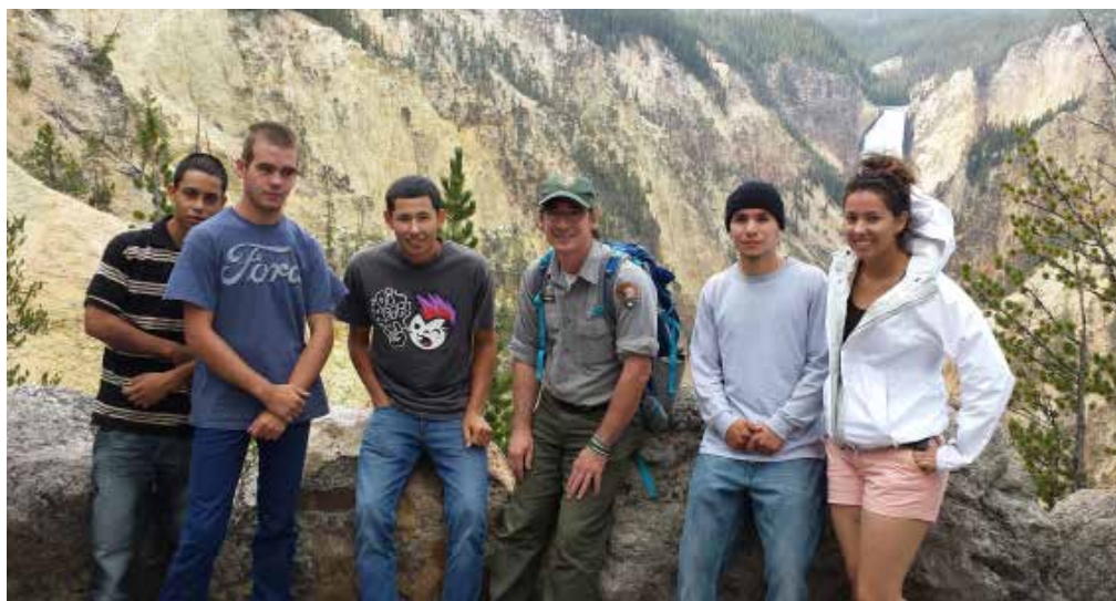
Groundwork USA Corps Experience participants and NPS staff in Yellowstone National Park.

Corps members were divided into work crews led by the Youth Conservation Corps and NPS staff, and worked on a number of projects including installing bear boxes and “bumper logs” to protect sensitive roadside habitats, trail work, and the removal of refuse from a geyser basin. Participants remarked that the experience was a unique opportunity to work and talk with a variety of staff, and helped to put the work they do in their own communities into a “big picture.”