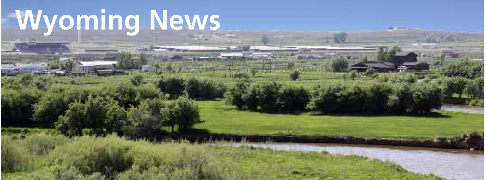
One of the five town-owned parcels along the Bear River that will become a park with equestrian and walking trails.