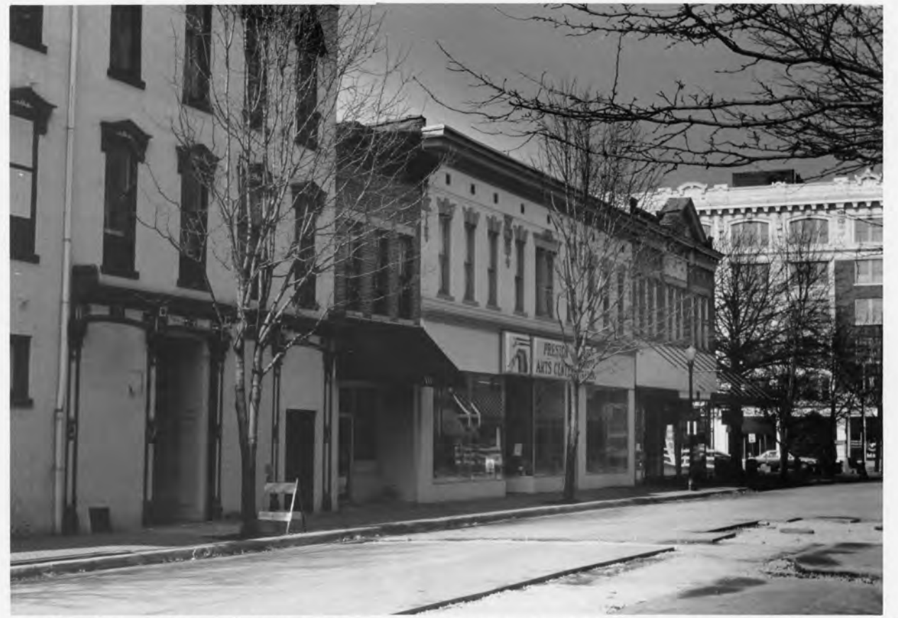
W. SIDE PEACLST, NEW ALBANY DOWNTOWN 416T. DIST., FLOYD CO., IN, DHOTO NO. 10