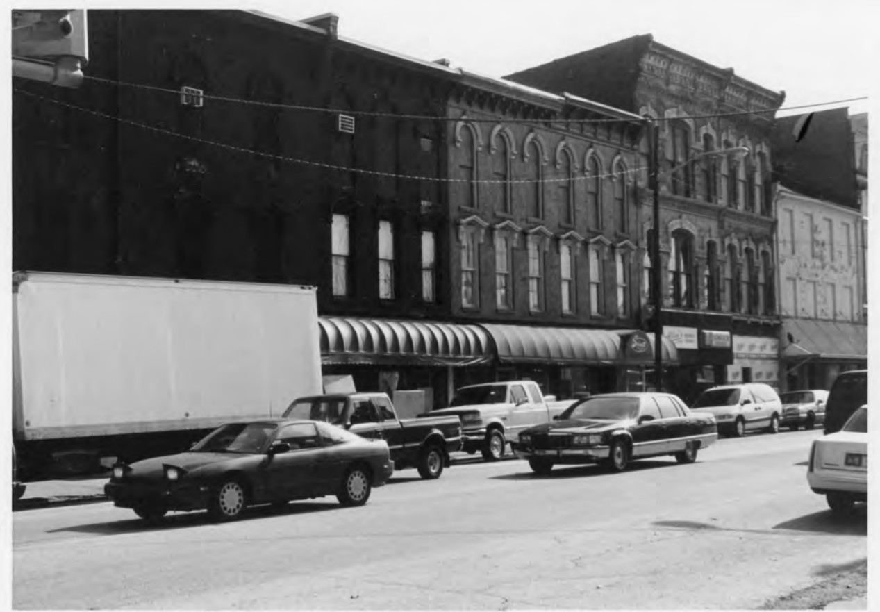
E.MKT & STATE STS, NEWALBANY D'N TOWN. HIST. DIST., PLOYD CO. INDIANA PHOTO NO. 7