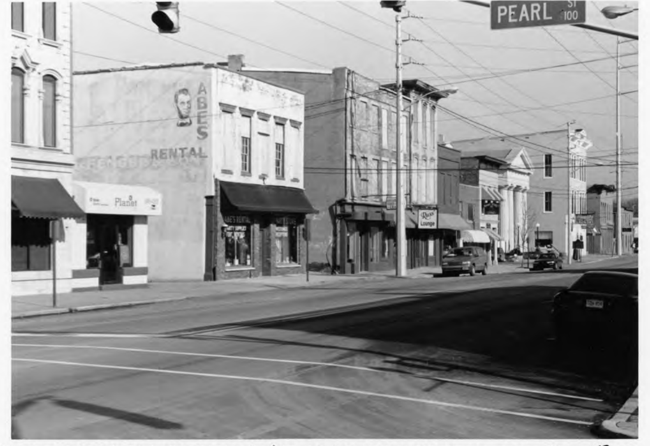
N. SIDE E.MAIN ST. NEW ALBANY D'NTOWN HIST. DIST. FLOYD CO. IN., PHOTO Nº 26