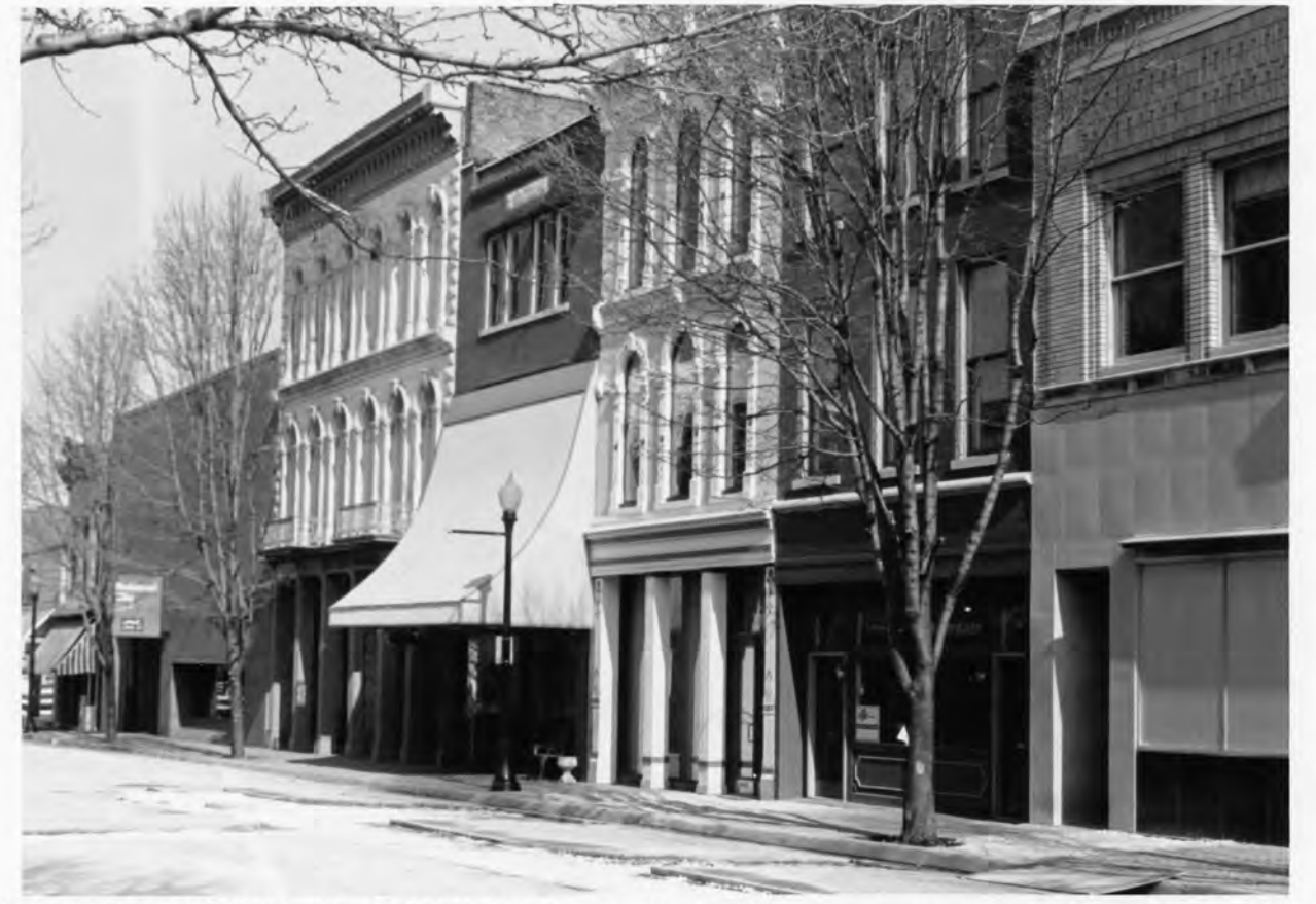
NOS. 302-336 PEARL ST., NEW ALBANY D'W . TOWN HIST. DIST. FLOYD CO. IN. PHOTO AND 11