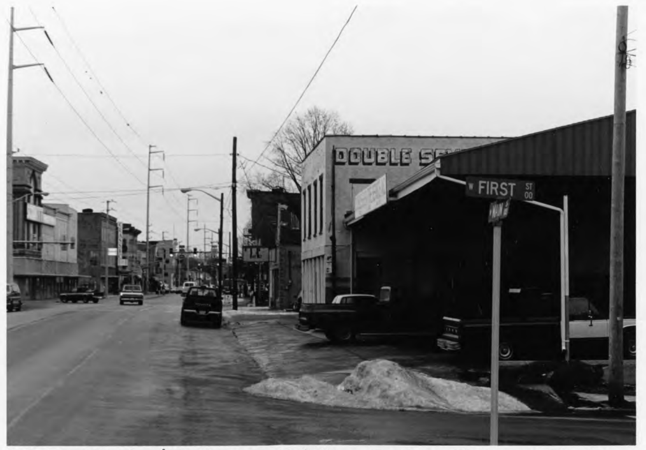
20.50 B W. MAIN ST, NEW ALBONY DOWNTOWN HIST. DIST, FLOYD CO., IN, PHOTO NO. 31