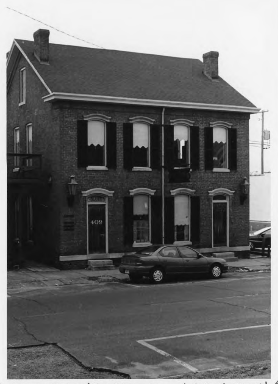
409 BANK ST, NEW ALBANY DOWNTOWN HIST. DIST. PHOTONO. 4