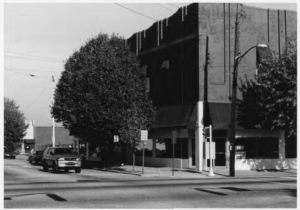
123 & SPRING ST., NEWALBANY DOWNTOWN Hist. Dist., FLOYD CO., IN., PHOTO NO. 5