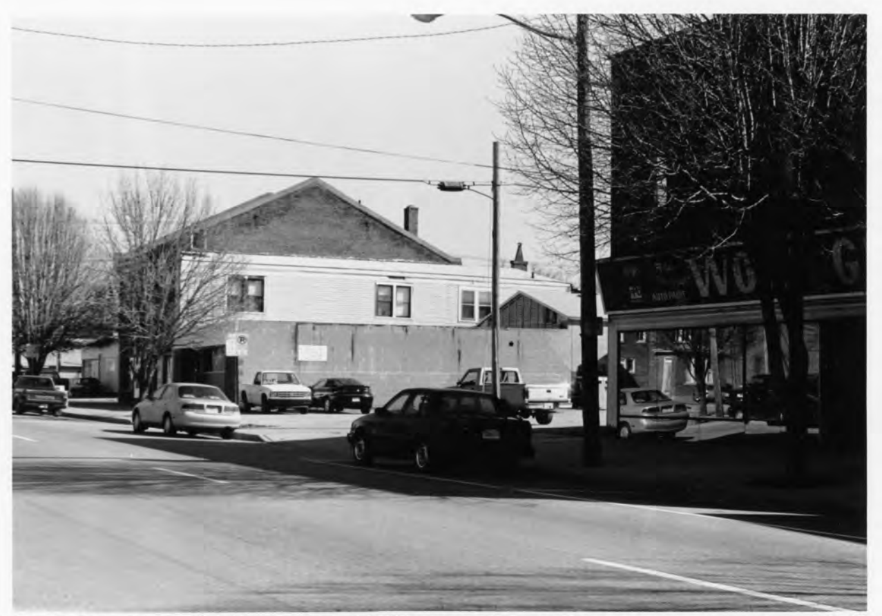
5. SIDE E. MARKET ST. NEW ALBANY O'N. TOWN HIST. DIST. PLOYDED. IN PHOTO Nº 15