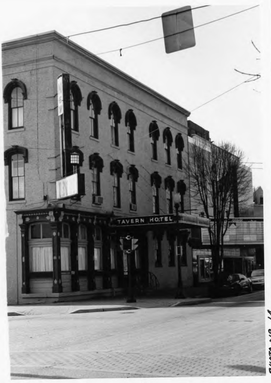
140 E. MARET, NEW ALBANY, D'N. HIST. DIST. PLOYD CO-IN.