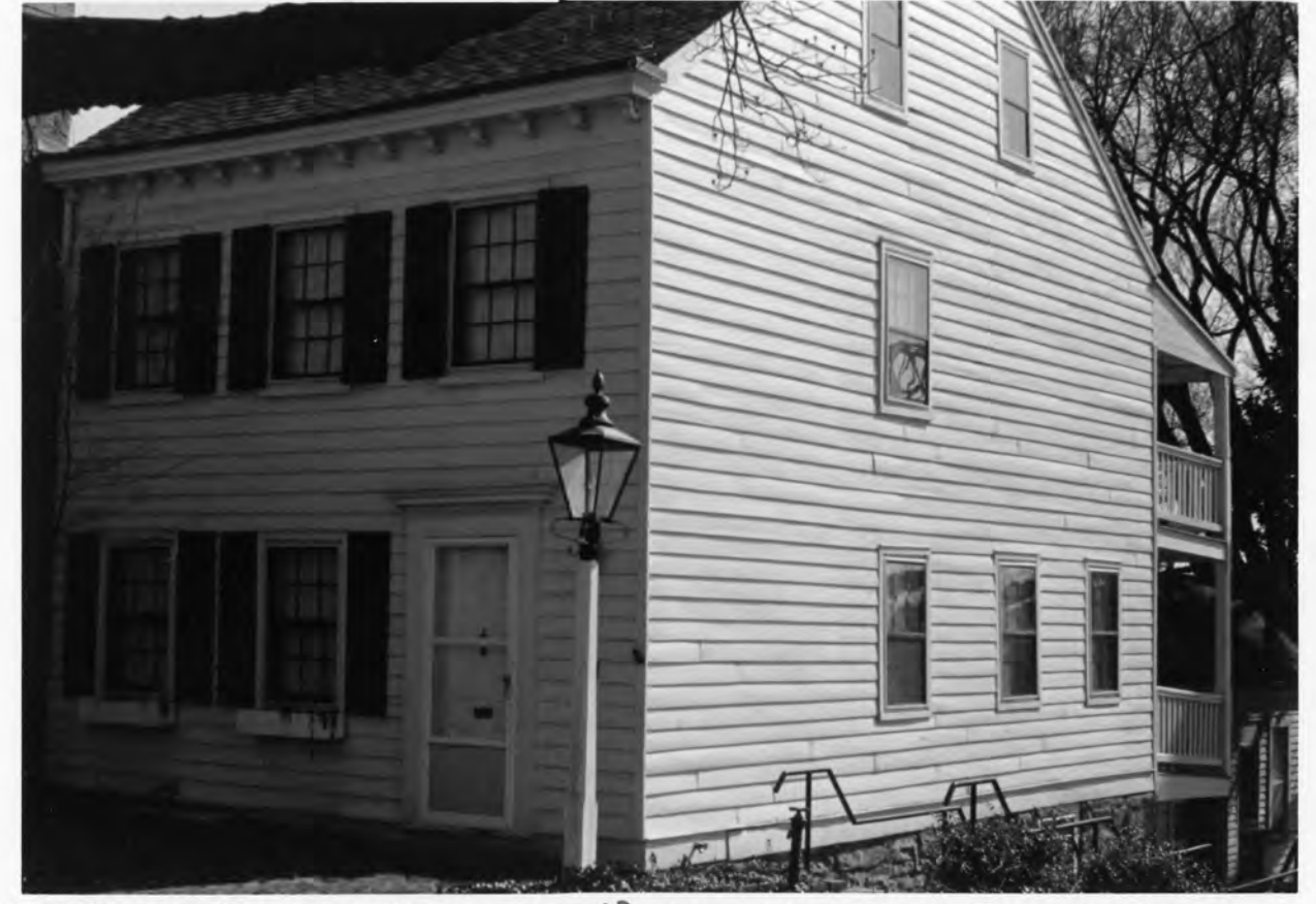
106 E. MAIN ST, NEW ALBONY DOWNTOWN HIST. DIST: , FLOYD CO., IN, PHOTO NO. 30