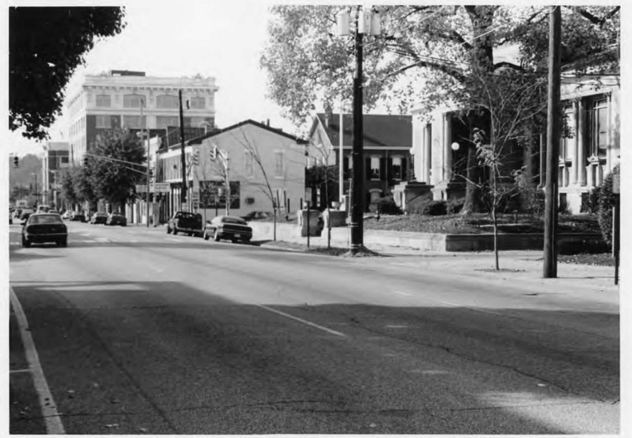
201 E. SPRING STIKL W., NEWALBANY DOWNTOWN HIST. DIST., FLOYD CO., IN, PHOTONS. 3