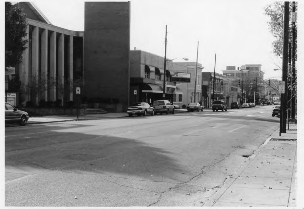
222 E. SPRINGST, NEW ALBARY DOWNTOWN HIST. DIST., FLOYD CO., IN, PHOTO NO. Z