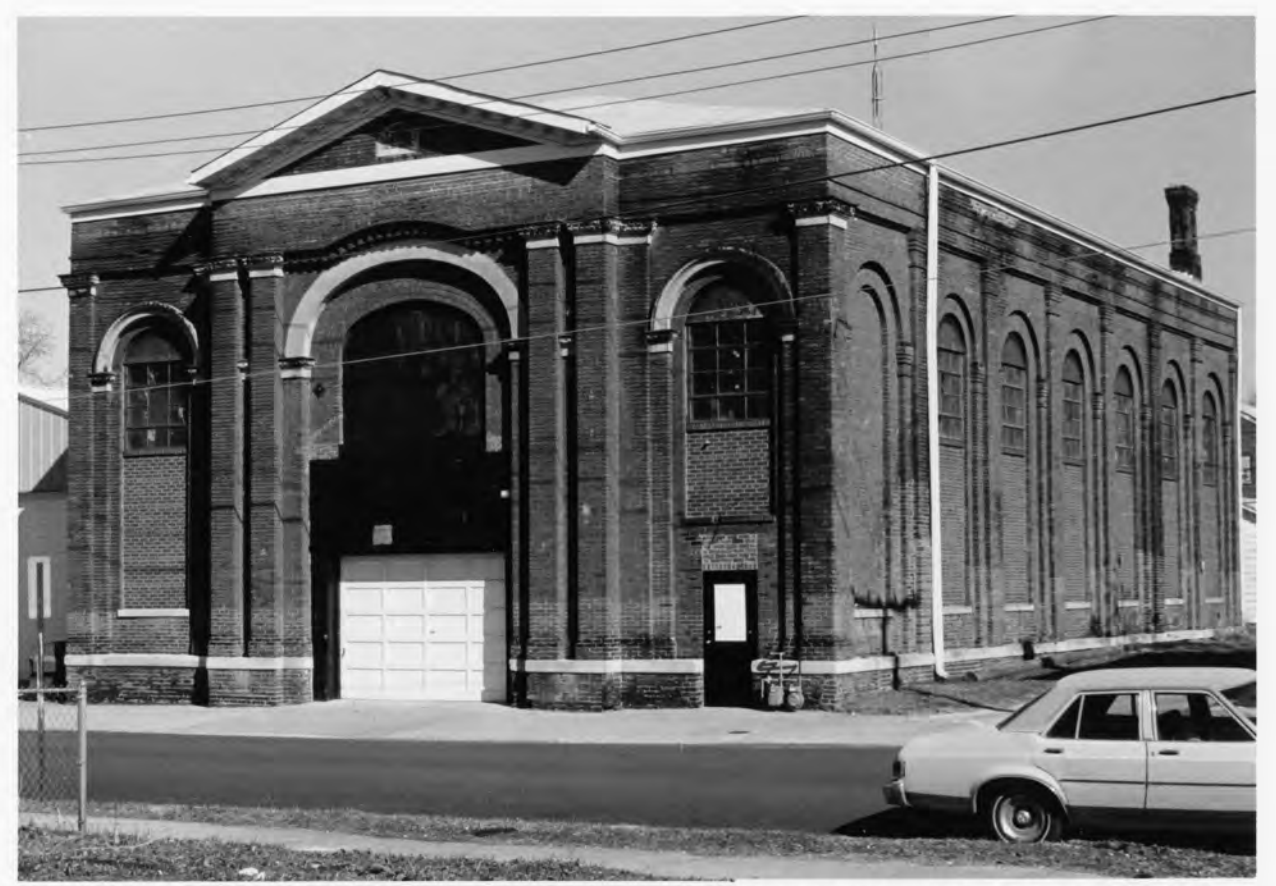
318 E. 4TH ST. NEW ALBANY D'N TOWN HIST. DIST. FLOYD CO. INDIANA PHOTO Nº 16