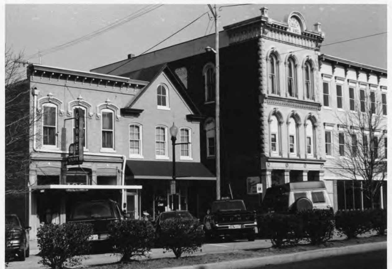
Nos 109, 113, 115, 117 B. MARKET, NEWALBONY DOWNSTOWN HOT. DEST., FLOYD CO.IN, PHOTO NO. 6