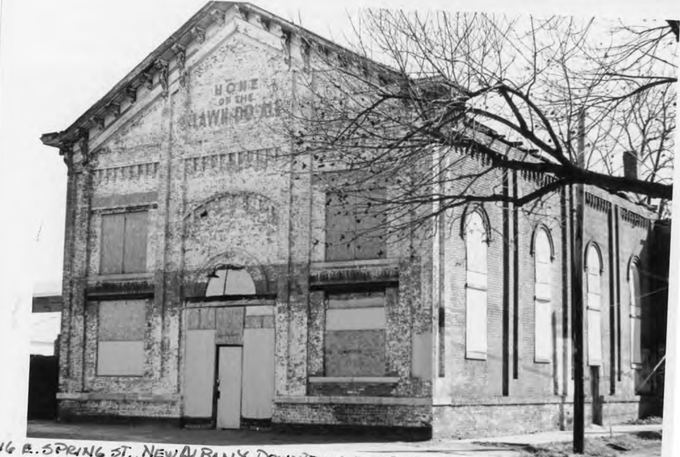
BIG B. SPRING ST., NEW ALBANY DOWNTOWN HIST, DIST. FLOYD CO. IN