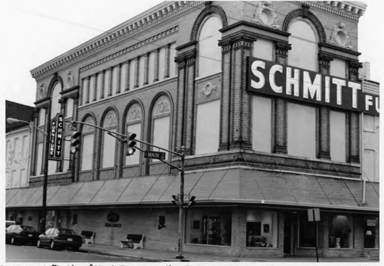
IDI E. MAIN ST., NEWALBONY DOUNTOURN HIST. DIST., FLOYD GO, IN, THOTO NO. 29