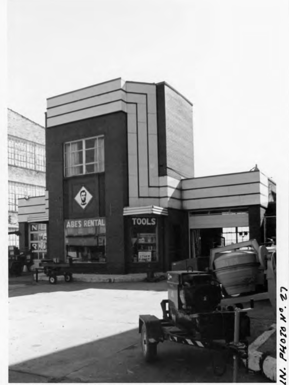
140 E. MAIN ST., NEW ALBANY O'N TOWN HIST. DIST, FLOYD CO.