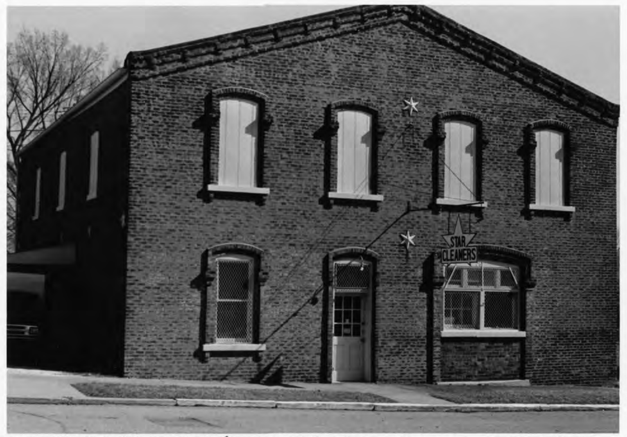
26 E. 3 E. ST. NEW ALBANY D'N TOWN HIST. DIST. FLOYD CO. IN., PHOTO Nº. 20