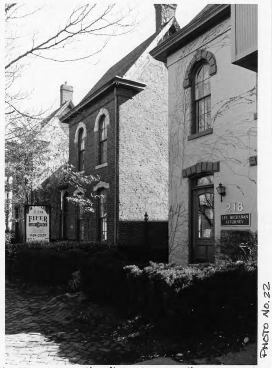
NOS 28+29.4 E. MAIN, NEWALBOLY DOWNTOWN HIST: DIST: , FLOODS ., IN