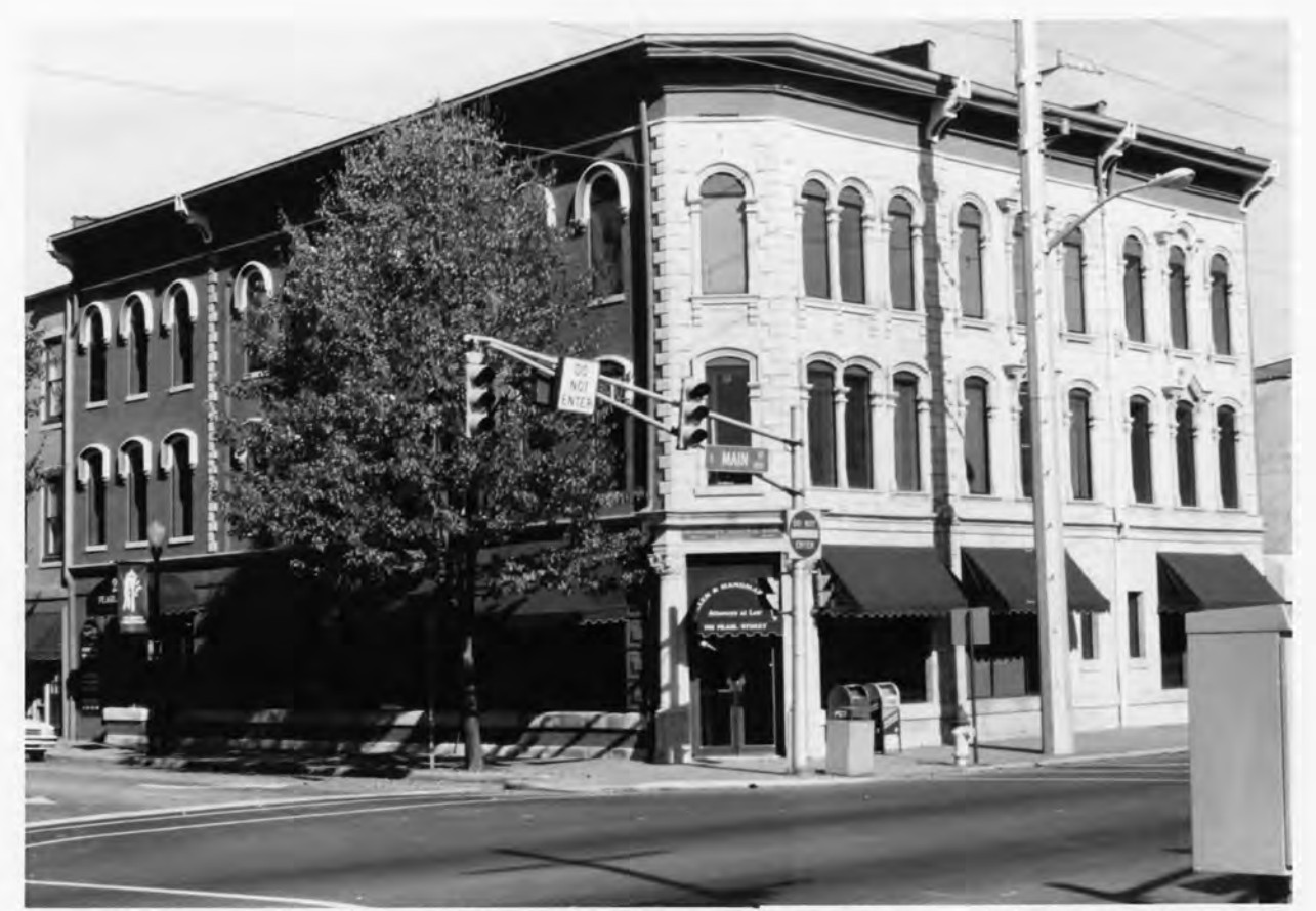
202-204 PEARLOT, NEWALBONY DOWNTOWN HIST. DIST. FROYDCO., IN, PHOTO No. 28