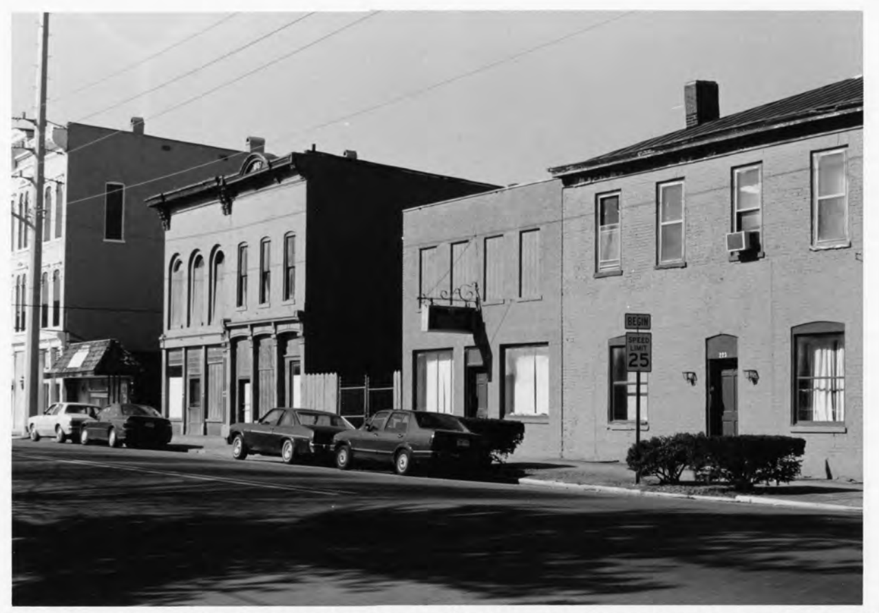
NOS. 223-207 E. MAIN ST., NEWALBANY D'N TOWN HIST. DIST. PLOYO CO. IN. PHOTO N 21