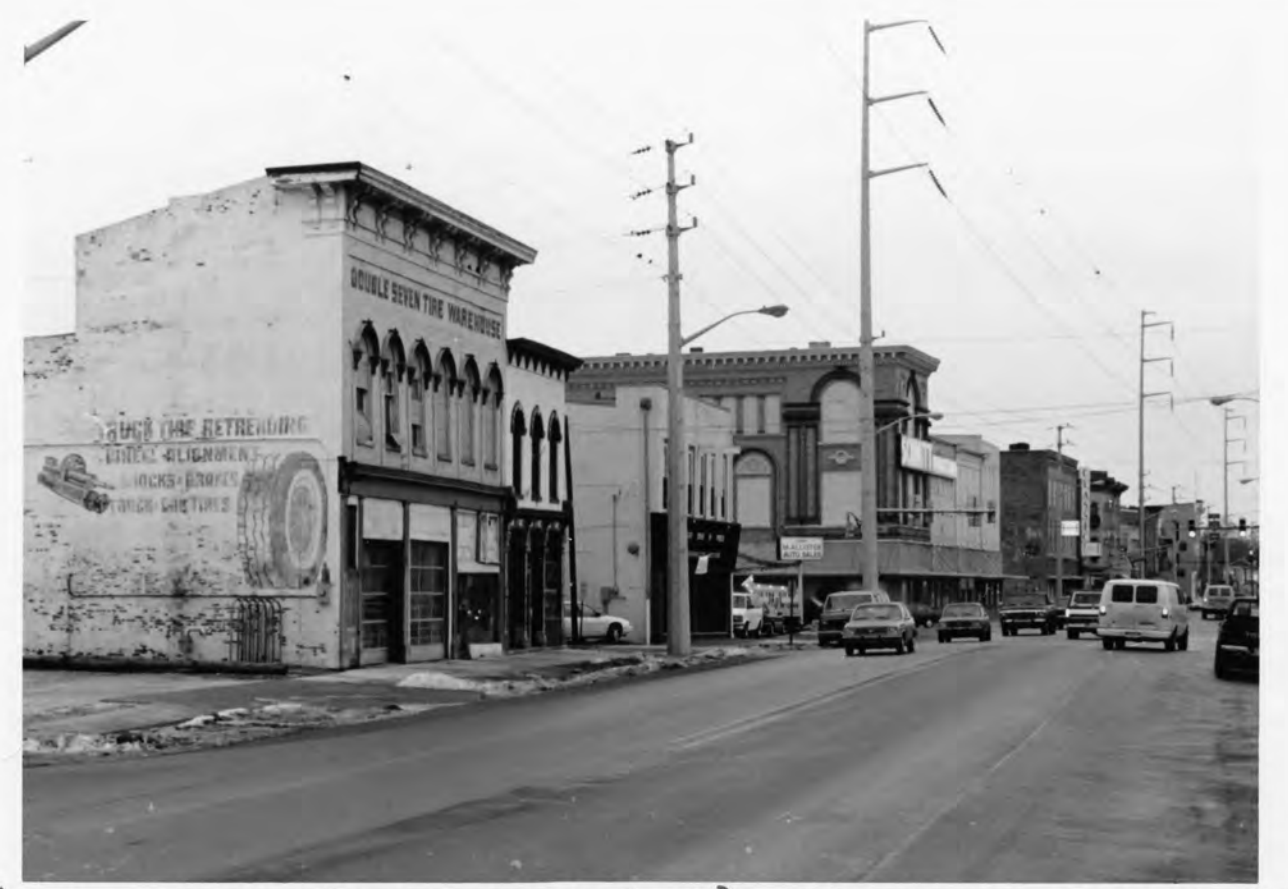
No. SIDE W. MAIN, NEW ALBANY DOWNTOWN HOT. DOT, FLOYD Co., IN, PHOTO NO. 32