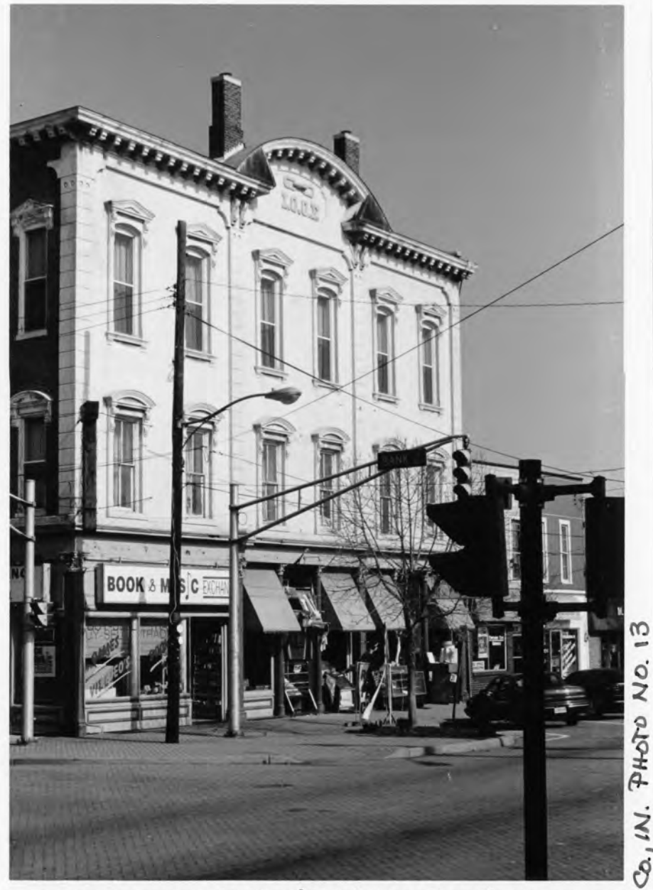
NOS 201-20TE. MARKET, NEW ALBANY DOWNTOWN HIST. DIST. FLOD