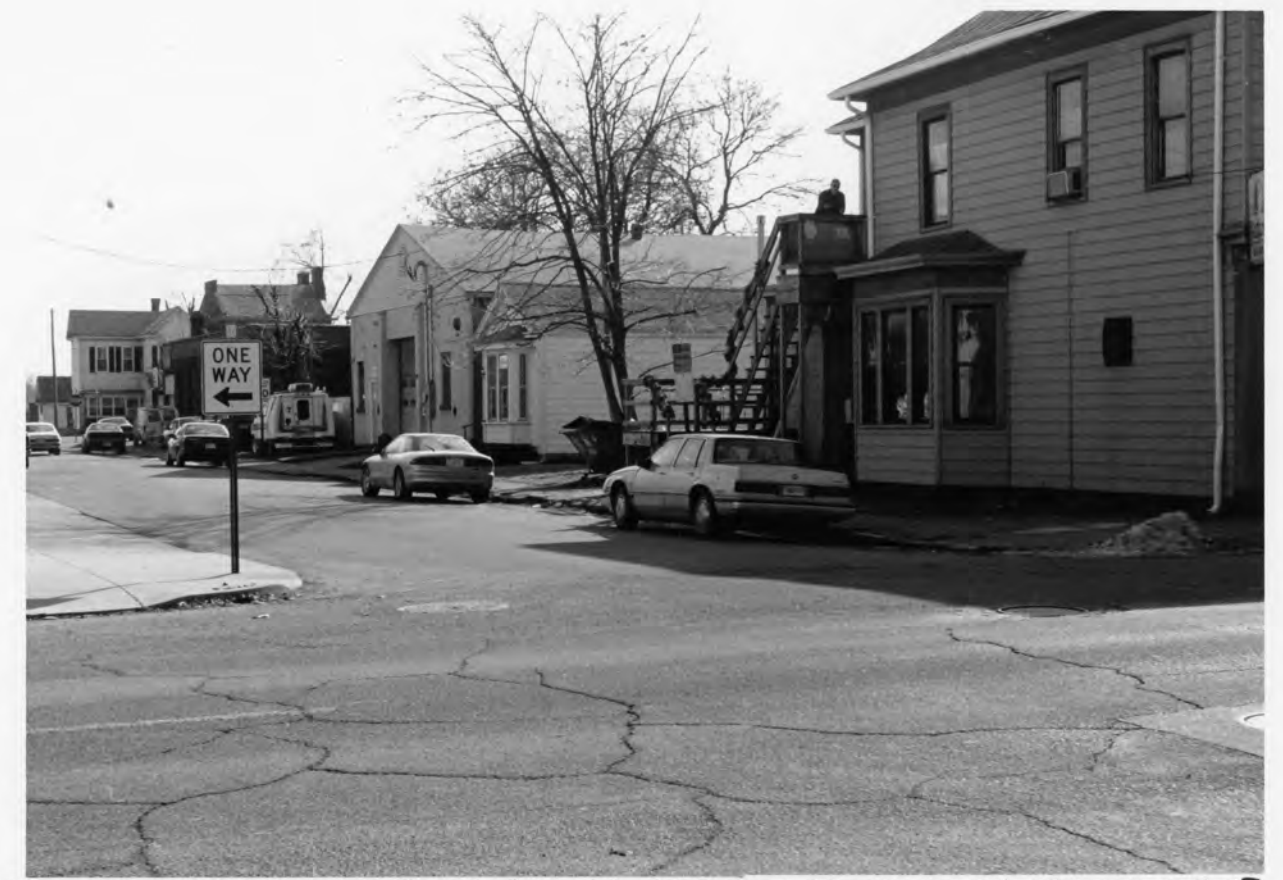
24.217 E. 5 TH ST. NEW ALBANY D'A TOWN HIST. DIST. PLOYD CO. IN PHOTO Nº 17