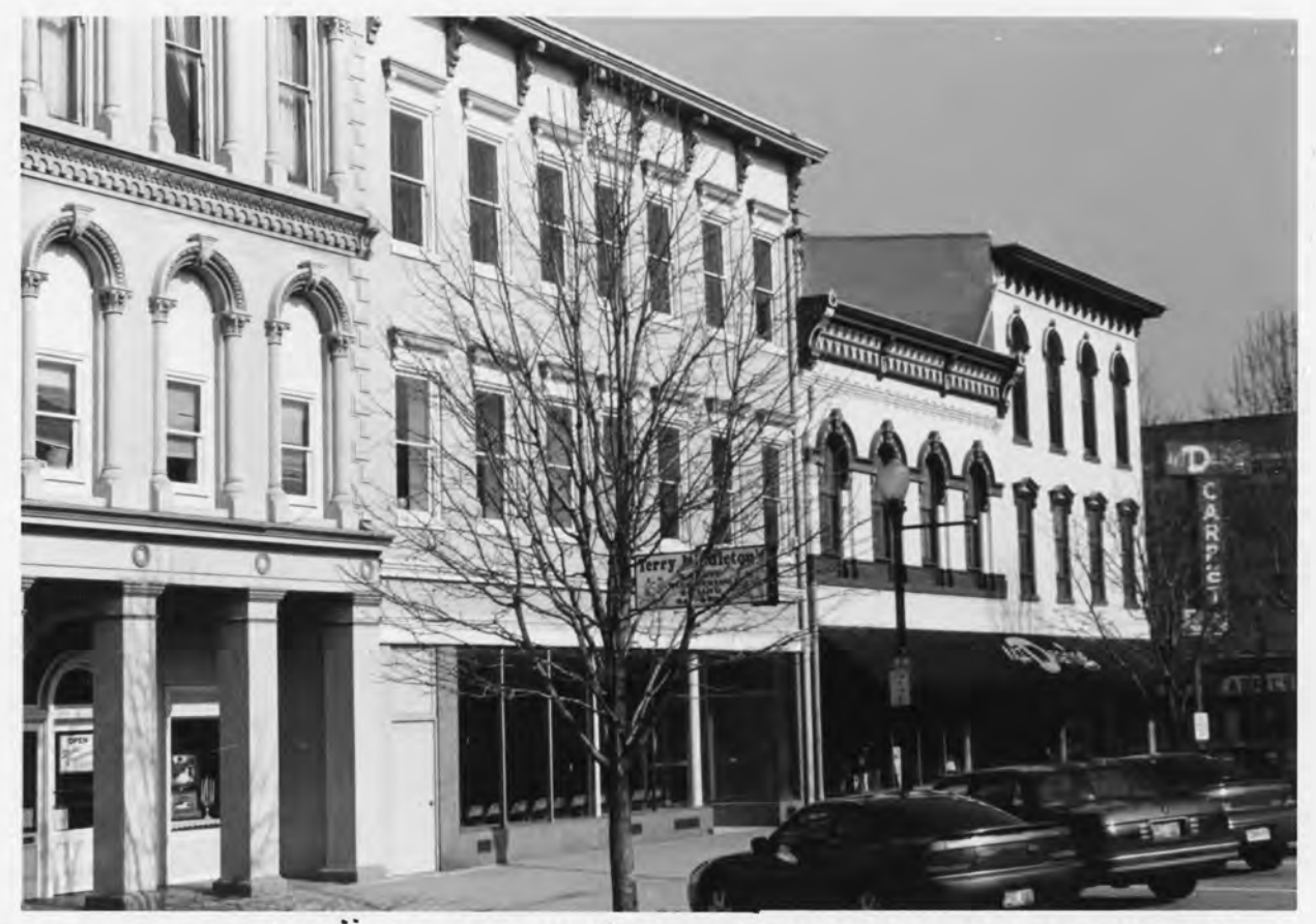
NOS. 43,117.119,128 E.MKT. NEW SLBANY O'N TOWN HIST. DIST. FLOYD CO. IN. PHOTO NO. 9