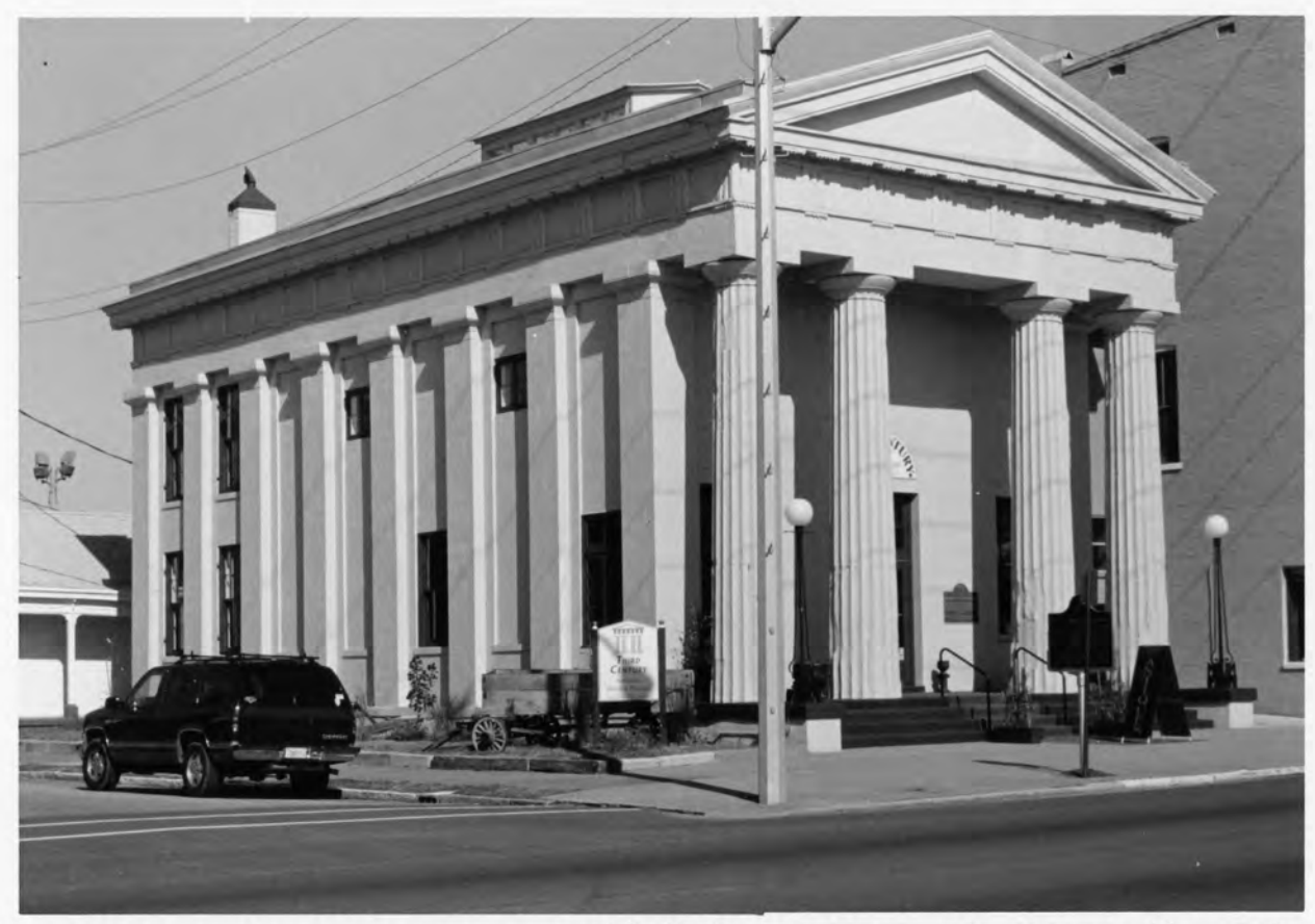
203 E. MAIN ST., NEW ALBANT DOWNTOWN HIST. DIST., FLOYD CO., IN, PHOTO NO. 25