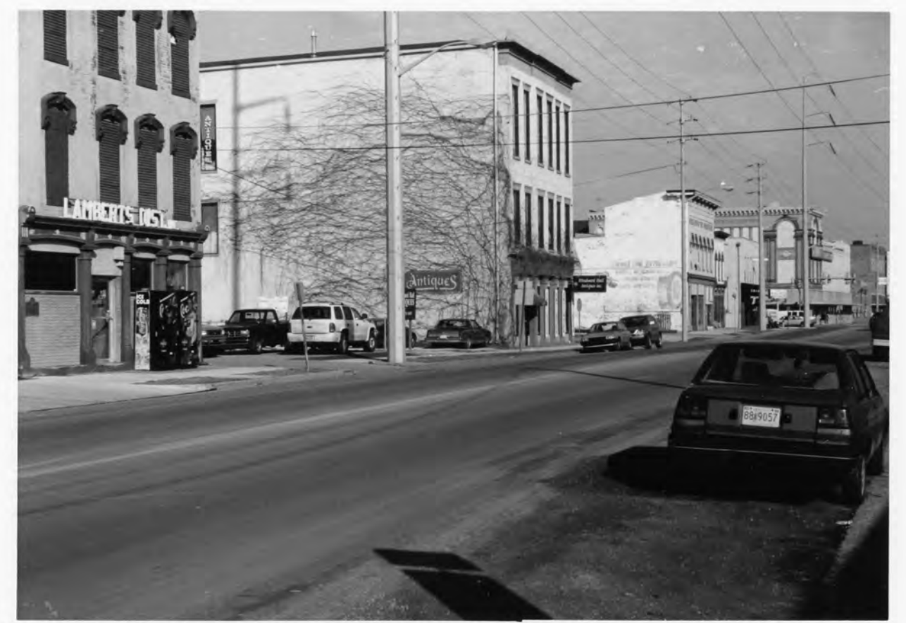
142 W. MAIN, NEW ALBANY DOWNTOWN HIST. DIST, FLOYD CO., IN, PHOTO NO. 33