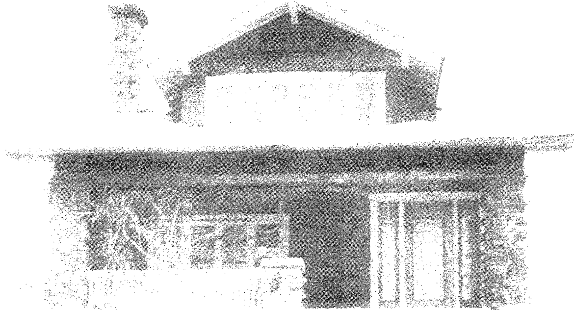
1733 South 1300 East, Salt Lake City, UT tax assessor's photograph, circa 1958