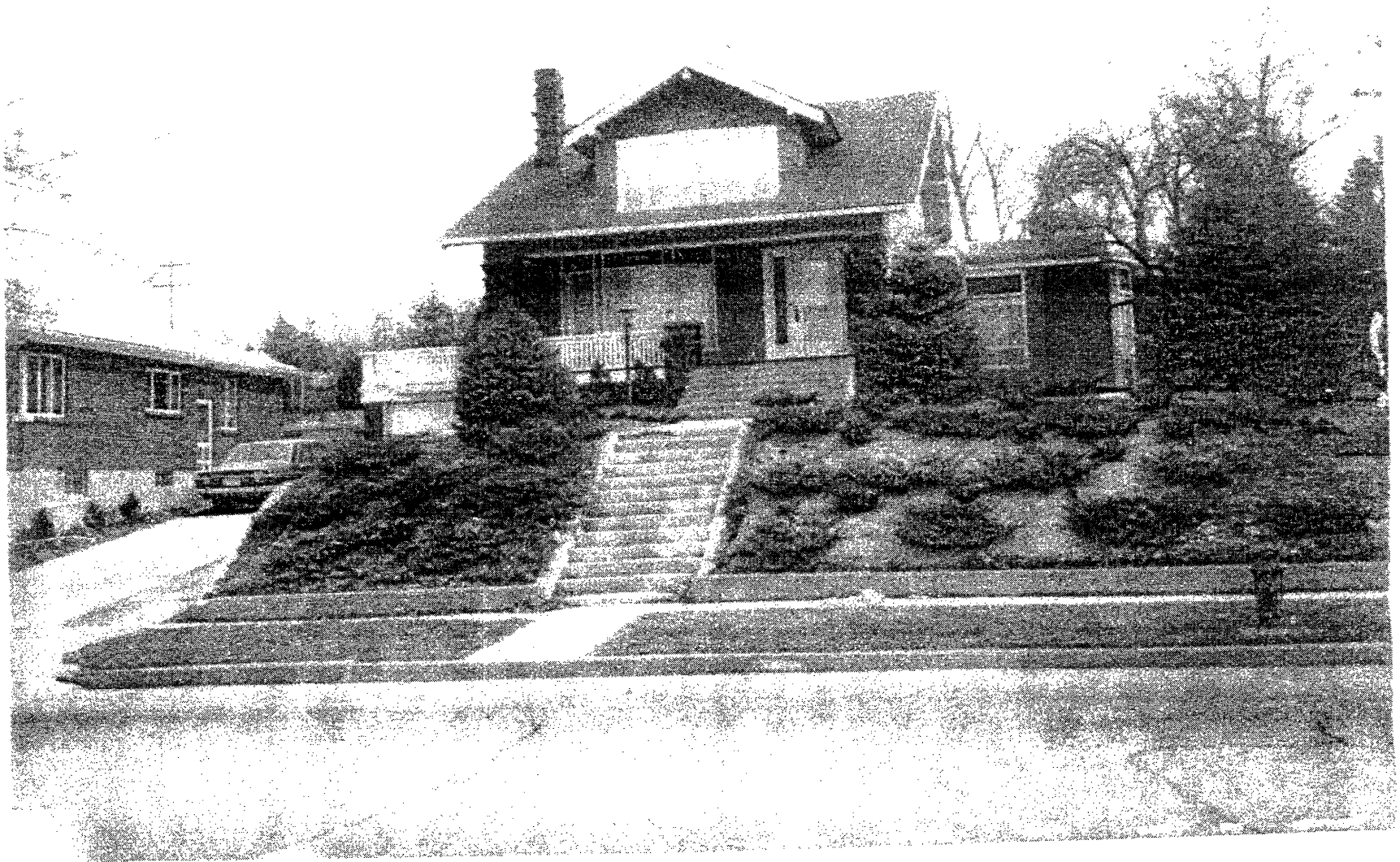
1733 South 1300 East, Salt Lake City, UT tax assessor's photograph, circa 1977