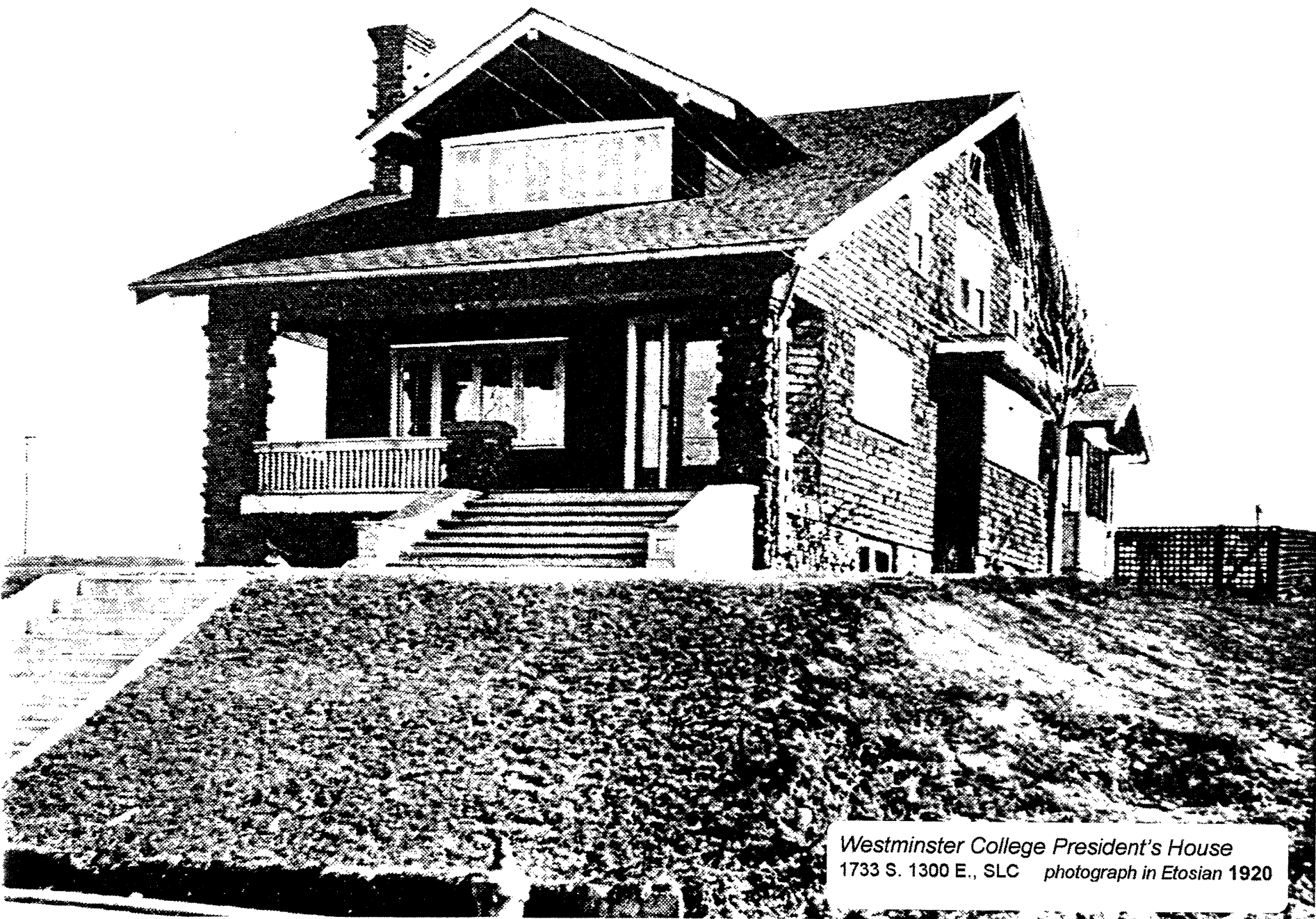
Westminster College President's House 1733 S. 1300 E., SLC photograph in Etosian 1920