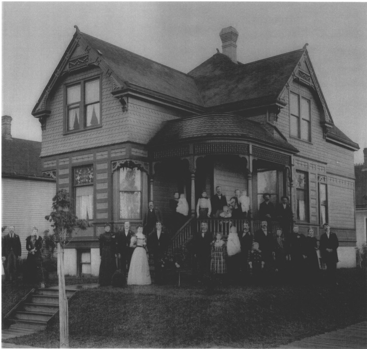
Newly constructed, ca 1897