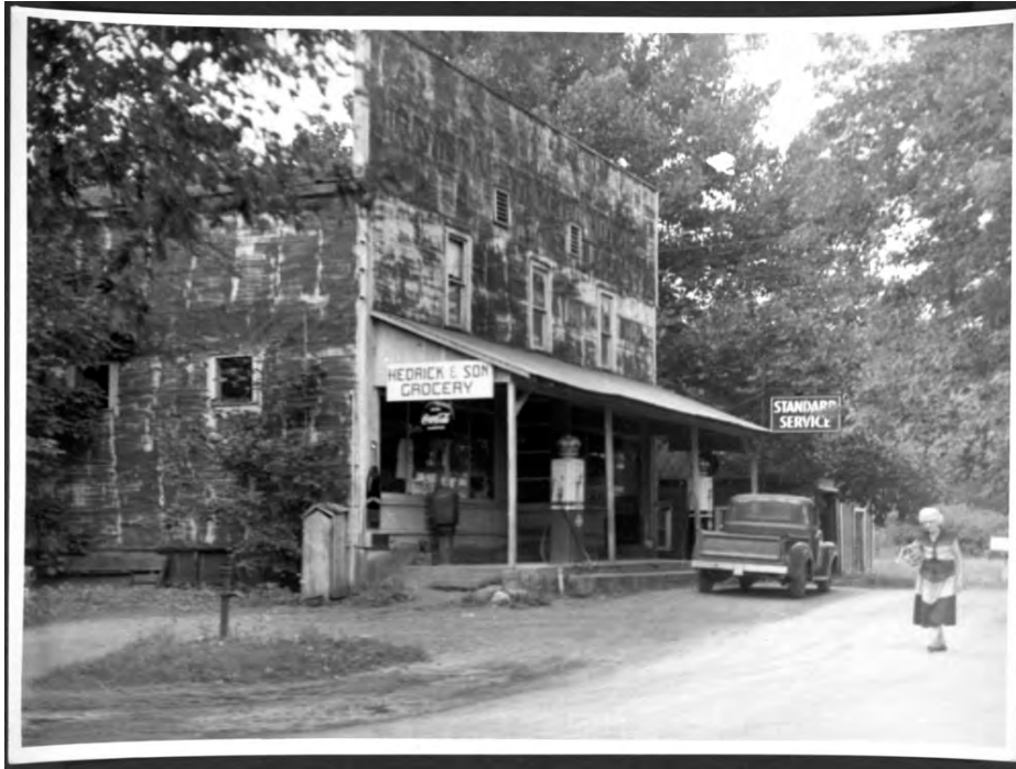
Figure 2: Hedrick & Son Grocery, c.1945 (Story Inn)