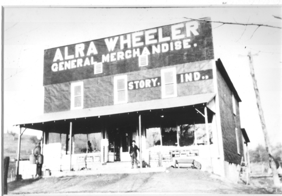
Figure 1: Alra Wheeler General Store, c.1920 (Story Inn)