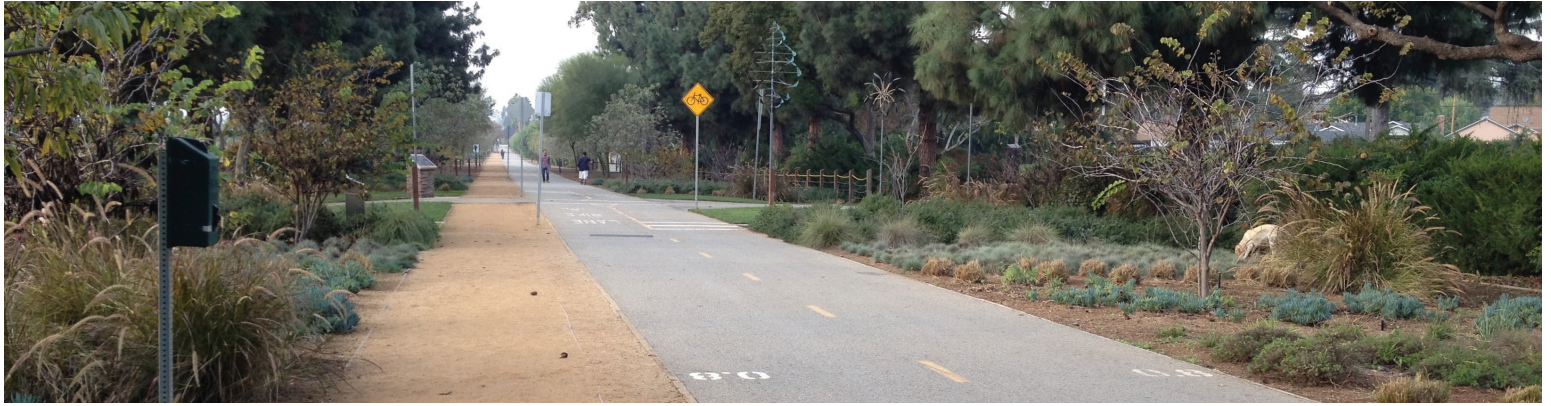
The City of Whittier is pursuing an extension of the 4.5-mile Whittier Greenway Trail, which is located along the former Union Pacific rail corridor. RTCA provided assistance to the City for the completed first phase of the project and is assisting the with this trail extension effort.