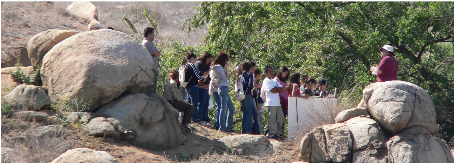
Students explore Sycamore Canyon Park on a guided walk as part of Endangered Species Day. The park will be the site of a new nature center that will serve as the hub of the Riverside Citizen Science Program.

RTCA will provide assistance to the San Joaquin River Partnership as they apply for the Department of Interior's newly developed National Blueways program. This program aims to create a collaborative approach to protecting rivers and their watersheds for long term sustainability and improvement to the river system, including ecological, hydrological, and anthropogenic resources and recreation. RTCA is assisting the partners create a river recreation guide to public access locations, and to increase public enjoyment and appreciation of the San Joaquin for Valley residents and visitors.