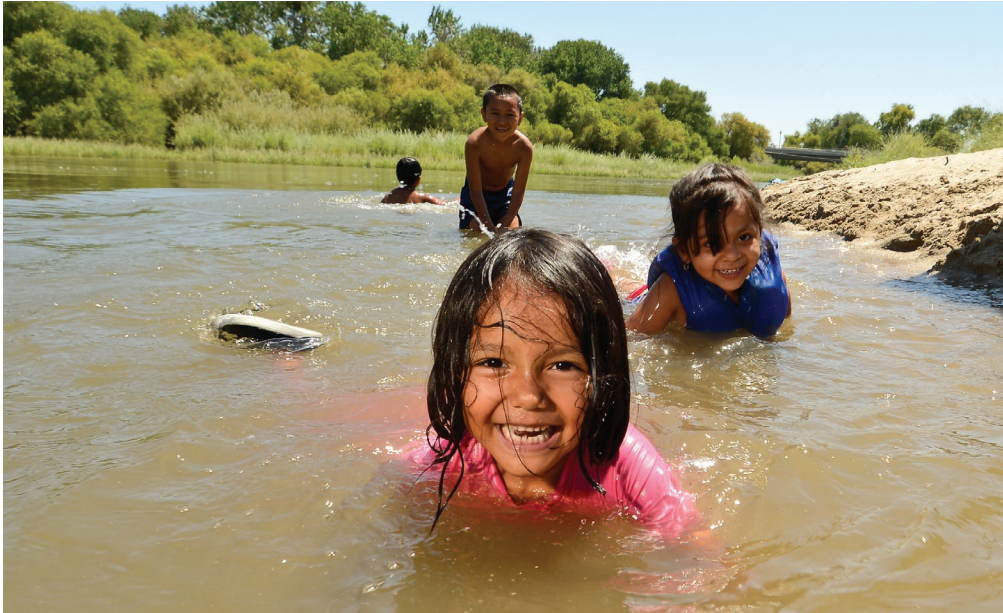
Through the San Joaquin River Parkway Trust's River Camp program, kids have the opportunity to learn about the San Joaquin River.

This project will result in the development of 6-10 miles of connector trails along the lower eight mile stretch of the Ventura River, providing key access to the river corridor for several of the area's most park-poor communities. RTCA is assisting in the development of a conceptual trail plan for this area, identifying key linkages, analyzing opportunities and constraints, and making recommendations on trail design options.