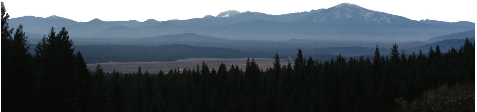
Once completed, the Great Shasta Rail Trail will afford outstanding views to trail users.

The Healing from the Ground Up project focuses on the creation of a nature-based green space that taps into the outdoors as a source of healing and solace for local residents,