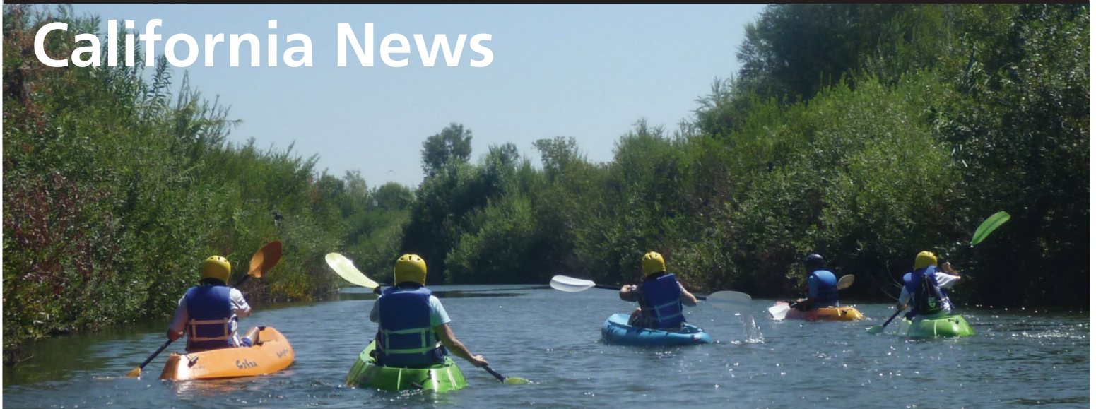
The summer of 2012 marked the second season of the Paddle the LA River Program.