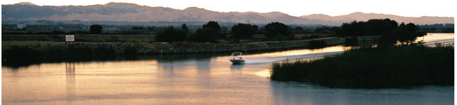
The waterways of the Sacramento-San Joaquin Delta provide ample recreation opportunities.

This project will convert a vacant lot with limited improvements into a 12-acre park site, including trails and opportunities for outdoor education and community art. RTCA will assist with assembling a conceptual planning document for the park, which may be used to leverage future project funding.