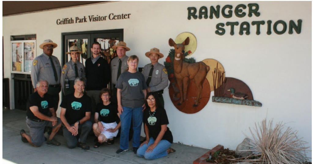
Members of the Friends of Griffith Park pose with Park Rangers and RTCA staff in front of the Visitor Center to celebrate the new Anza National Historic Trail NPS Passport stamp.

This rail-trail project will focus on an 80-mile rail banked recreational trail that will link the towns of McCloud and Burney and nearby recreation areas featuring local heritage and culture, close connections to nature, and boosting the economic and social