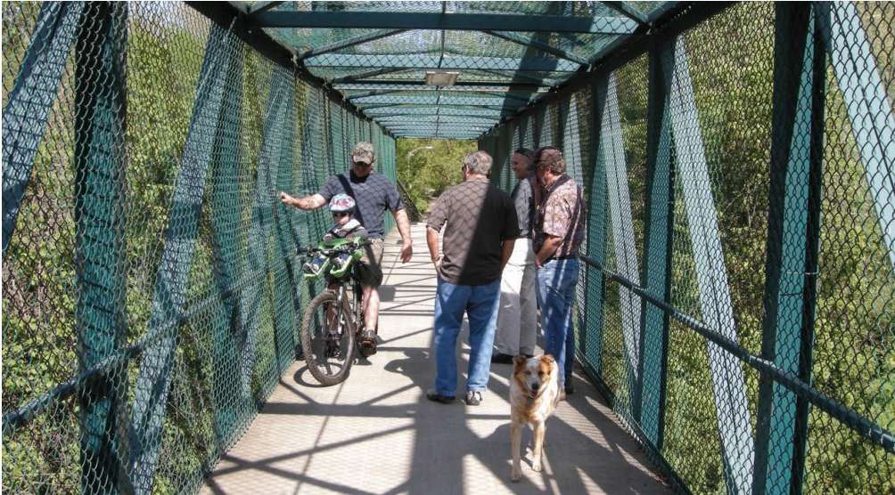
This popular re-purposed bridge provides recreational access across the Lower Stanislaus River in the City of Ripon.

youth and the community beyond. RTCA will facilitate youth and community engagement and support park design and implementation, tapping into a local high school and a range of partners involved in site design over the past few years.