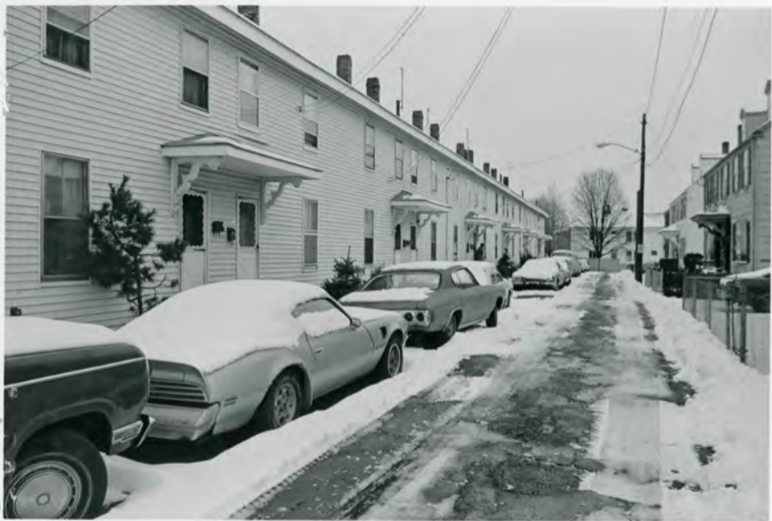
Adwton Place - NORTH SIDE