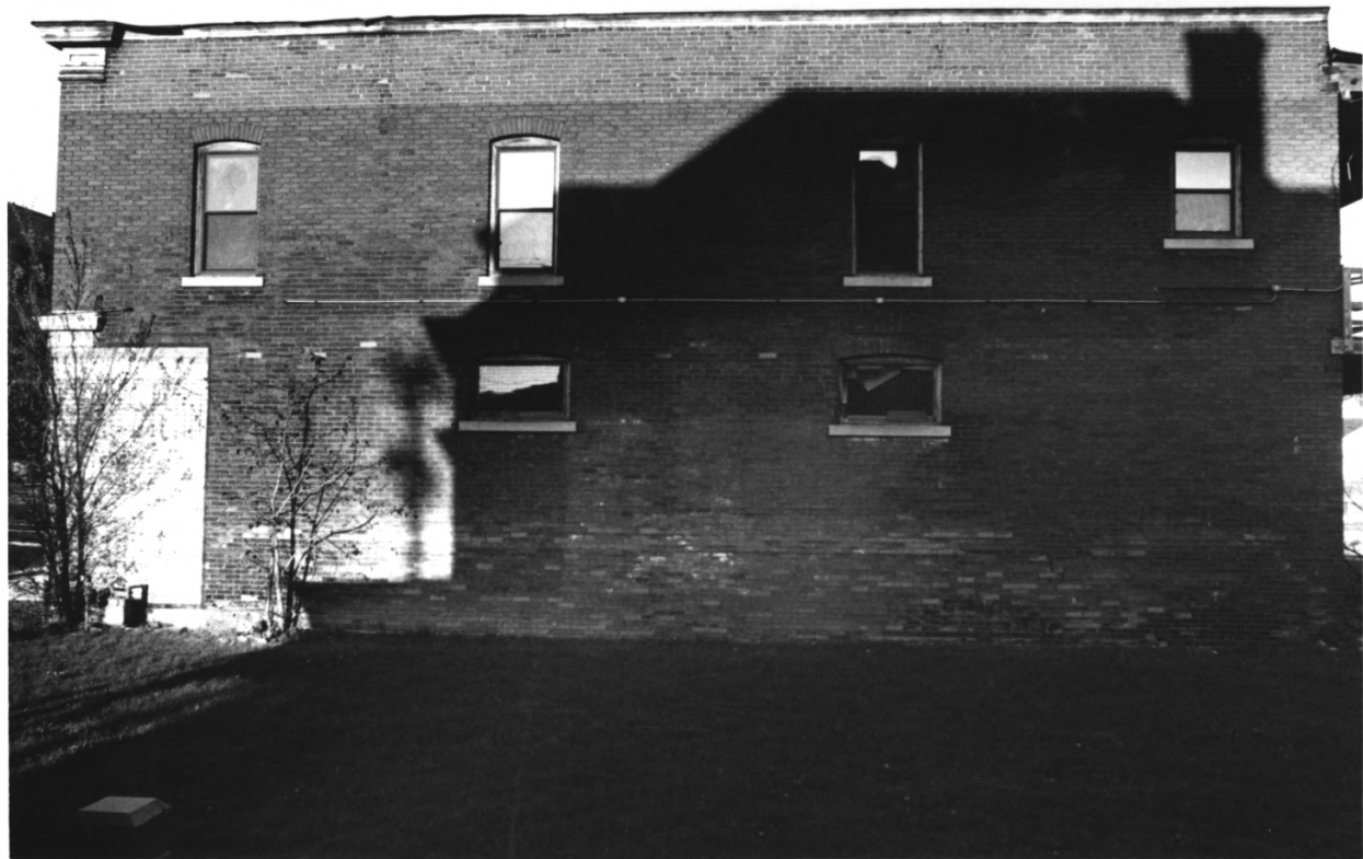
⑤ C. McCOORMICK BLDG, E. BANK MPL, S. BEND, IN