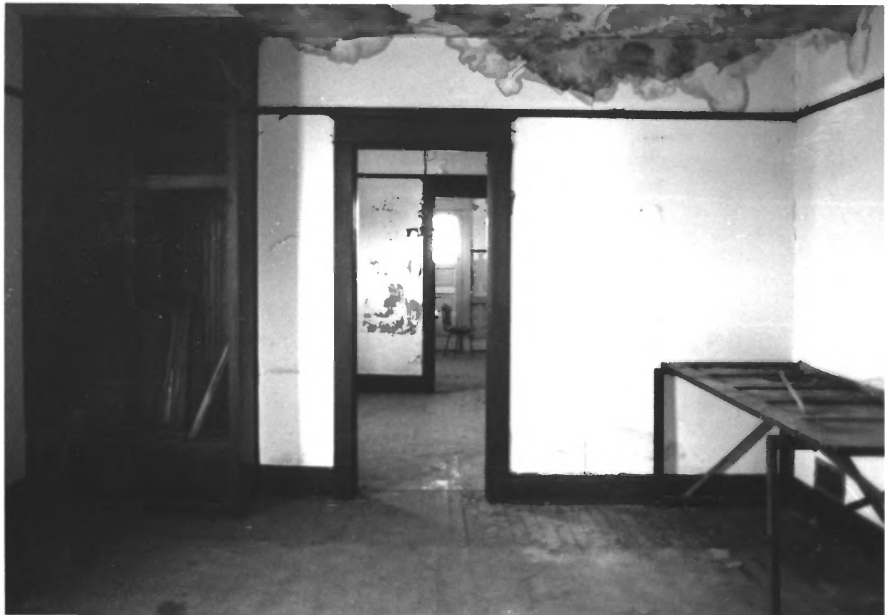
① C. McCormick BLDG, E. BANK, S. BEND, I. IN MPL.