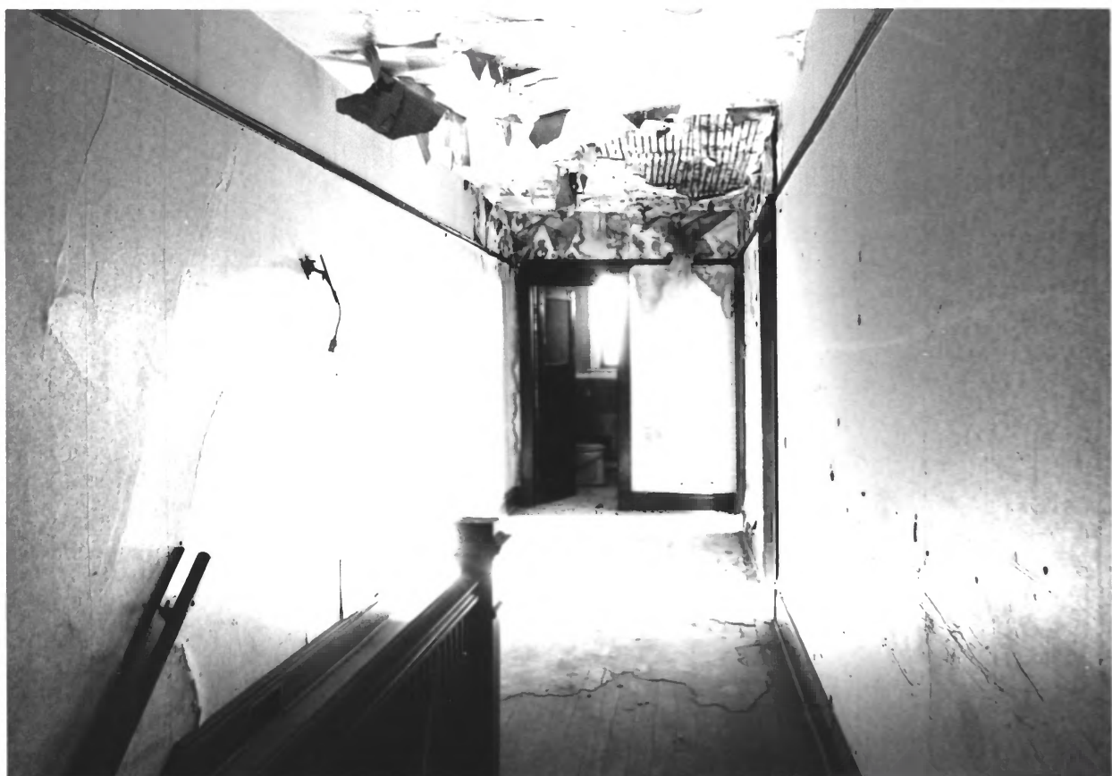
② C. MCCORMICK BLDG, E. BANK H.P.L., S. BEND, IN