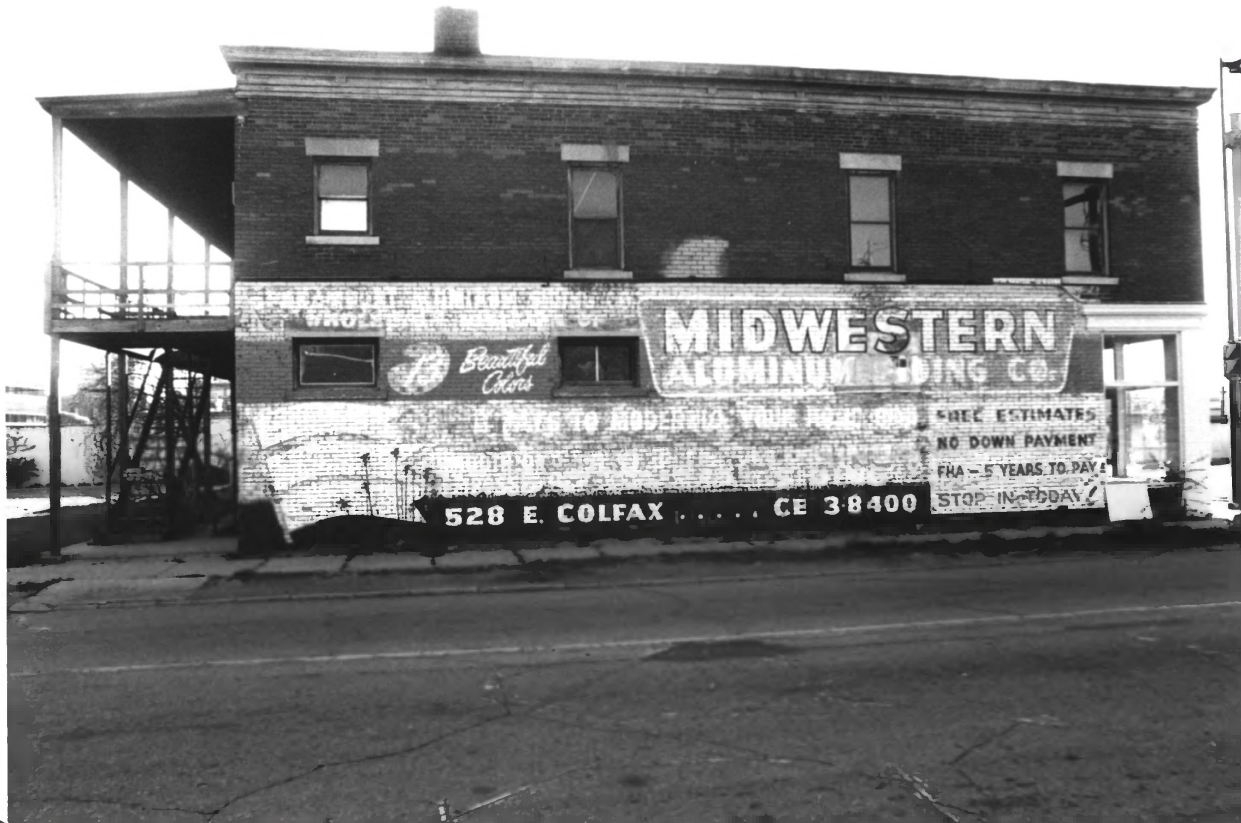
③ C. McCORMICK BLDG, E. BANK MPL, CO. BENG. IN