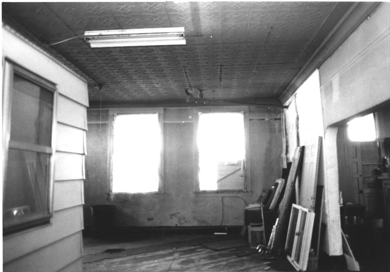
5 C. MCCORMICK BLDG, E. BANK H.P.L., SO. BEND, IN