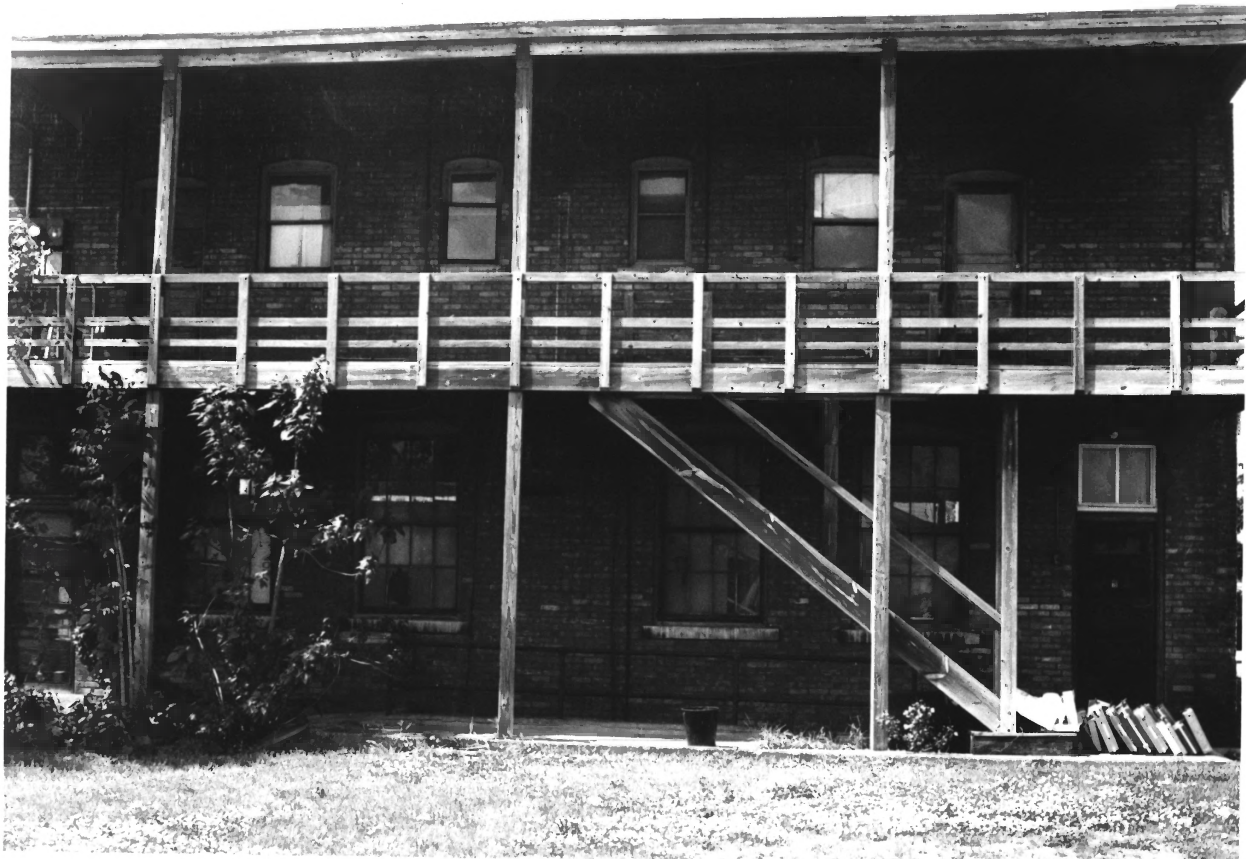
③ C. MCCORMICK BLDG, E. BANK M.P.L, SO. BEND, IN