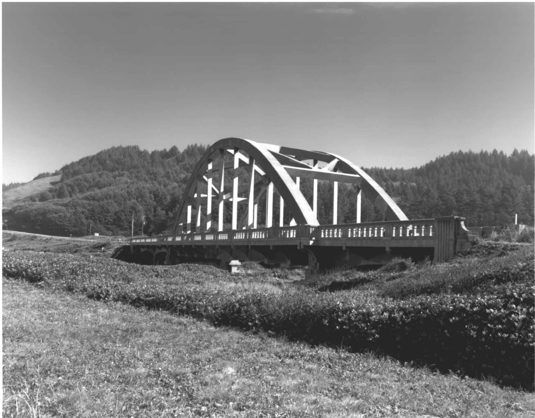
BIG CREEK BRIDGE, HELETA HEAD, OREGON