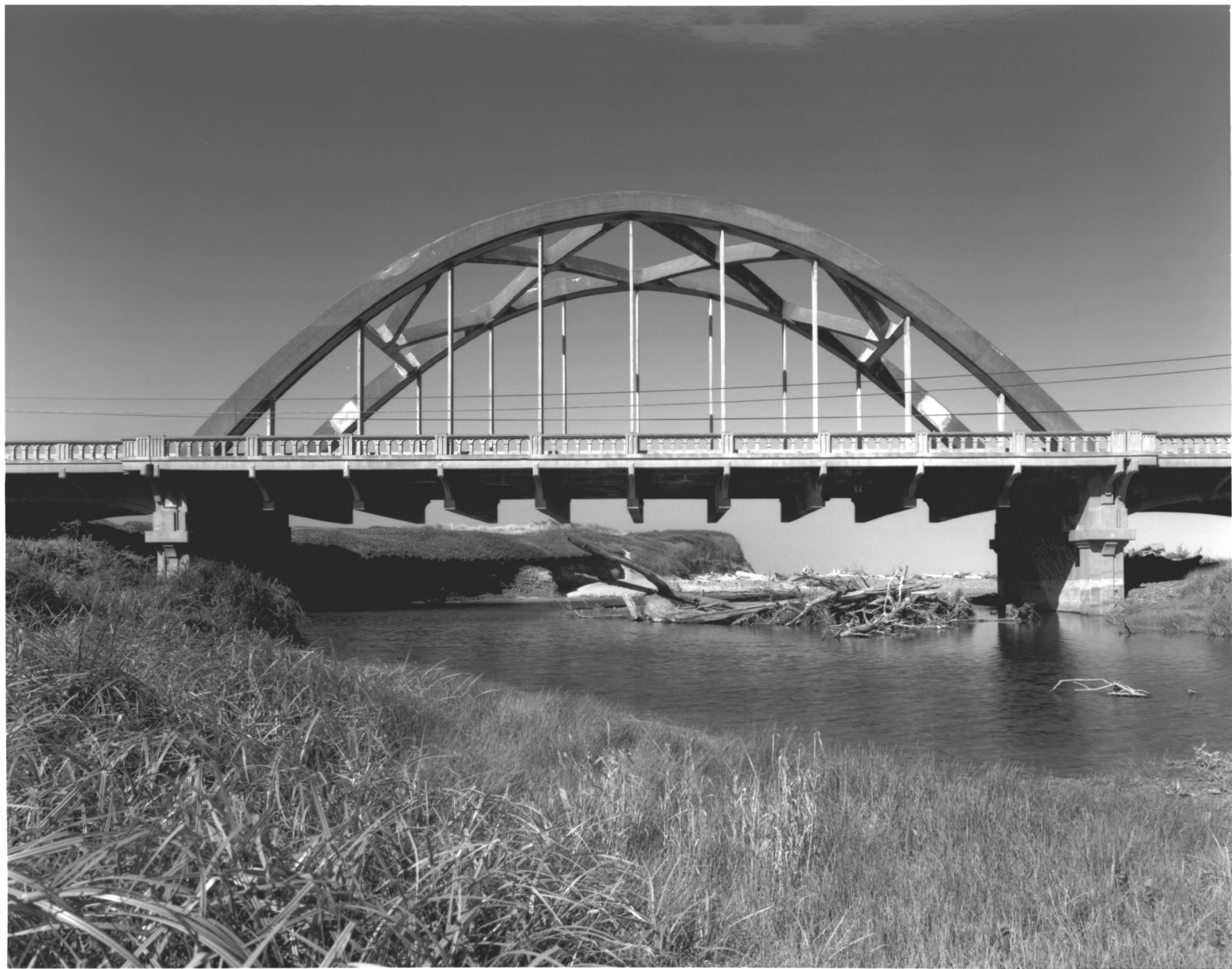
BIG CREEK BRIDGE, HERETA HEAD VICINITY, OREGON #3