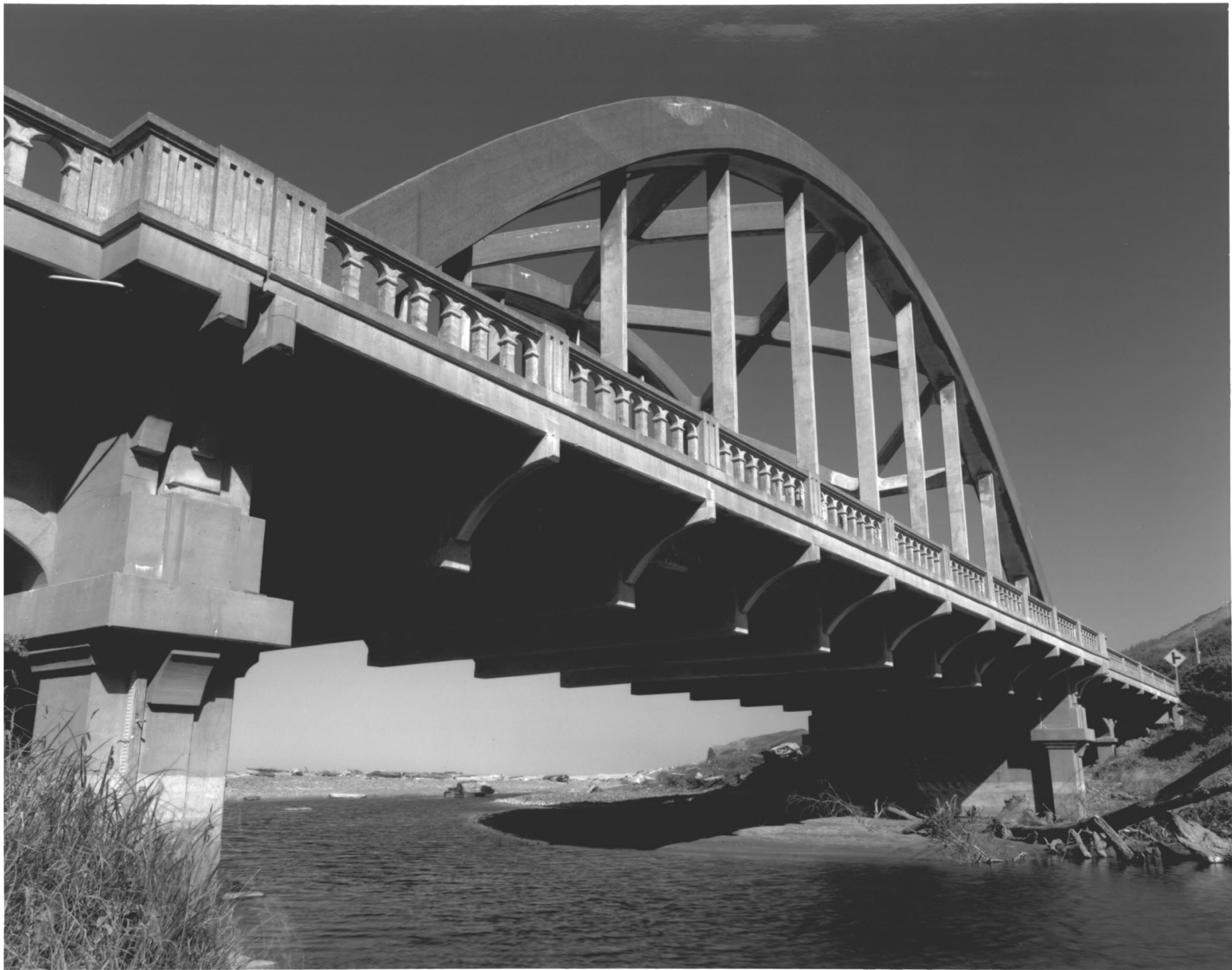
BIG CREEK BRIDGE, HECETA HEAD VICINITY, OREGON #2