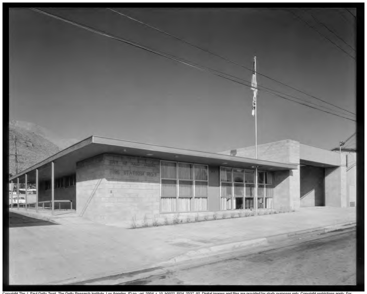
Figure 2. East and south elevations, looking northwest, 1958.

Copyright The J. Paul Getty Trust. The Getty Research Institute, Los Angeles. ID no.: gri 2004_r_10_b0022_f024_2537_02. Digital images and files are provided for study purposes only. Copyright restrictions app copyright information or higher resolution images visit: http://hdl.handle.net/10020/repro_perm.