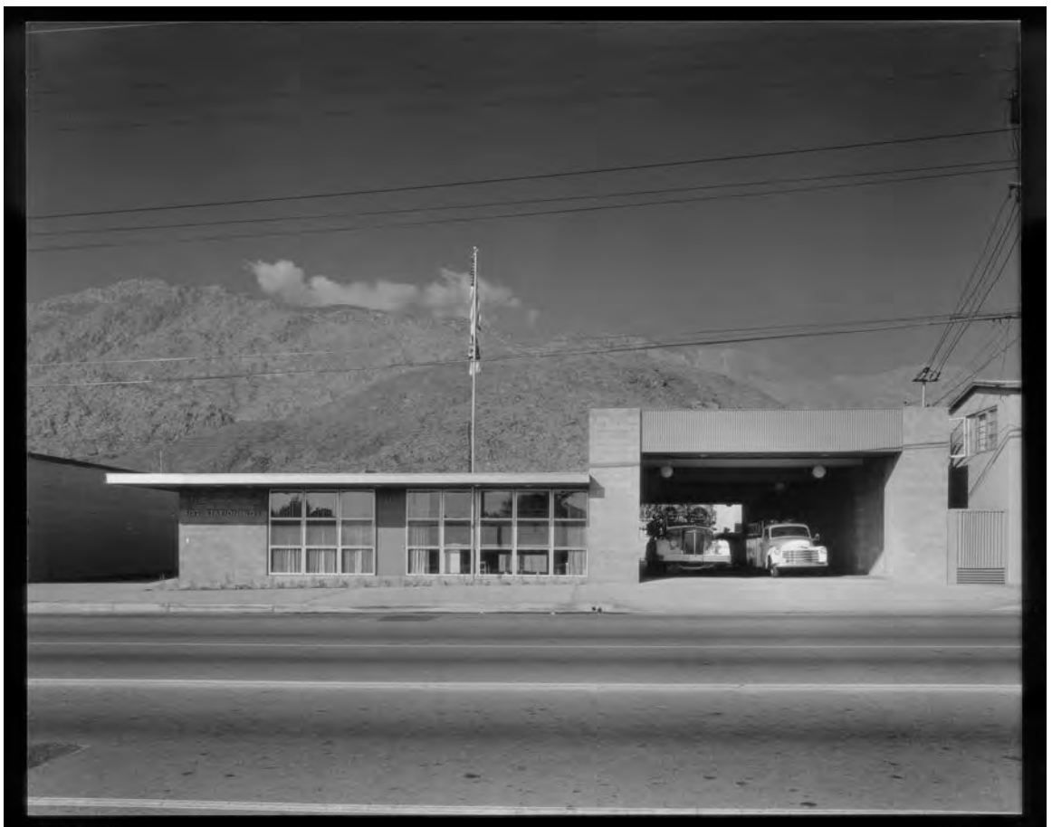
Figure 1. Primary (east) elevation, looking west, 1958.

Copyright The J. Paul Getty Trust. The Getty Research Institute, Los Angeles. ID no.: gri_2004_r_10_b0022_f024_2537_01. Digital images and files are provided for study purposes only. Copyright restrictions apply. For copyright Information or higher resolution images visit: http://hdl.handle.net/10020/repro_perm.