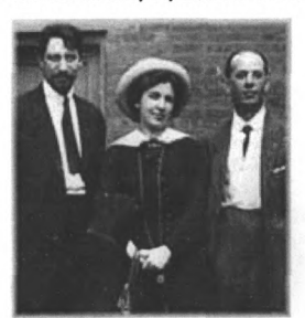
Flynn (1913) with IWW organizers