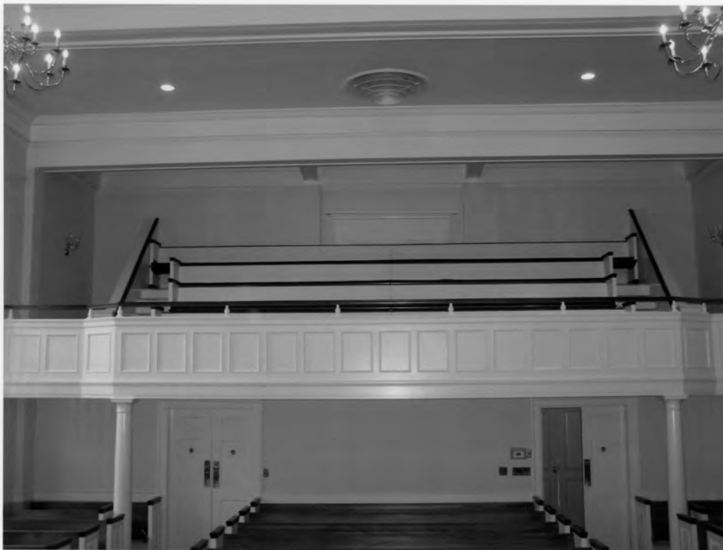
10. Kingston Presbyterian Church 800 Third Avenue, Conway Horry County, South Carolina

View of Sanctuary and Pulpit From Gallery