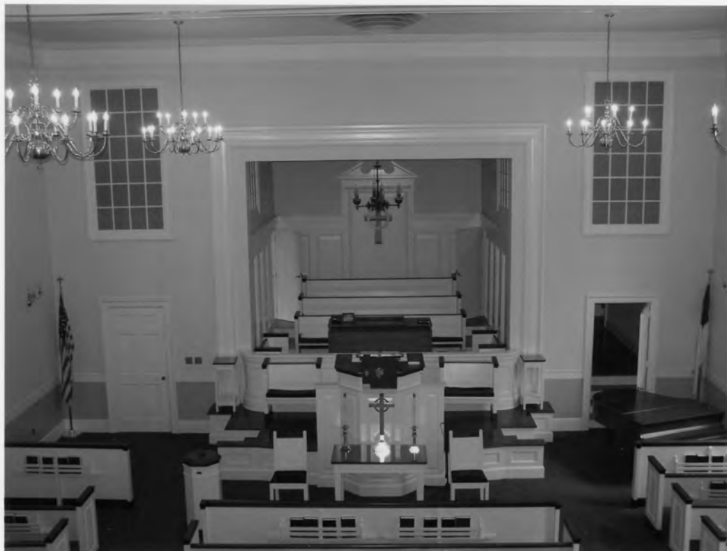
9. Kingston Presbyterian Church 800 Third Avenue, Conway Horry County, South Carolina