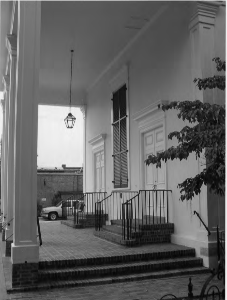
6. Kingston Presbyterian Church 800 Third Avenue, Conway Horry County, South Carolina