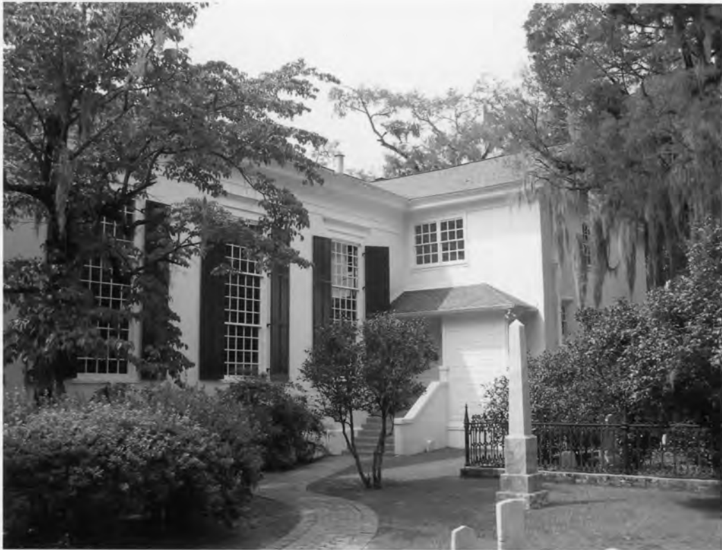
7. Kingston Presbyterian Church 800 Third Avenue, Conway Horry County, South Carolina