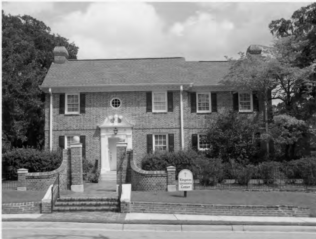
13. Kingston Presbyterian Church 800 Third Avenue, Conway Horry County, South Carolina