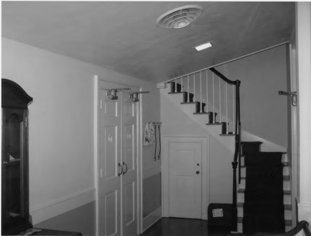
12. Kingston Presbyterian Church 800 Third Avenue, Conway Horry County, South Carolina