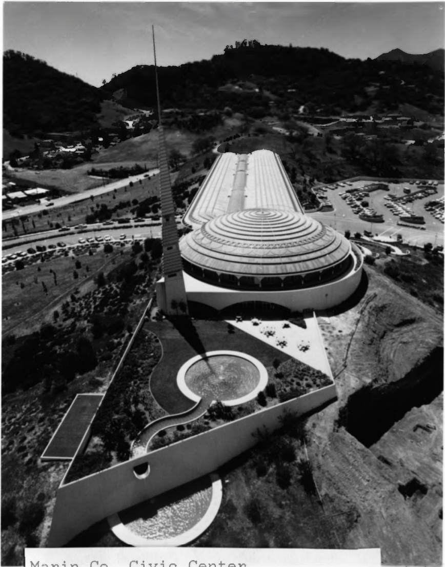
Marin Co. Civic Center San Rafael, Ca. Administration Bldg.c. 1958 from N.