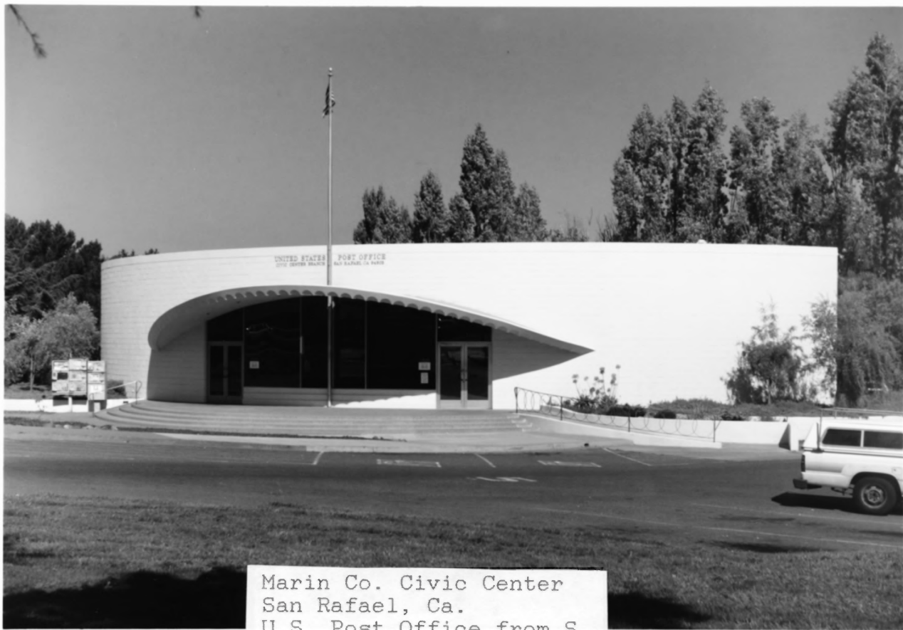
Marin Co. Civic Center San Rafael, Ca. U.S. Post Office from S. Photo: Woodbridge 1990