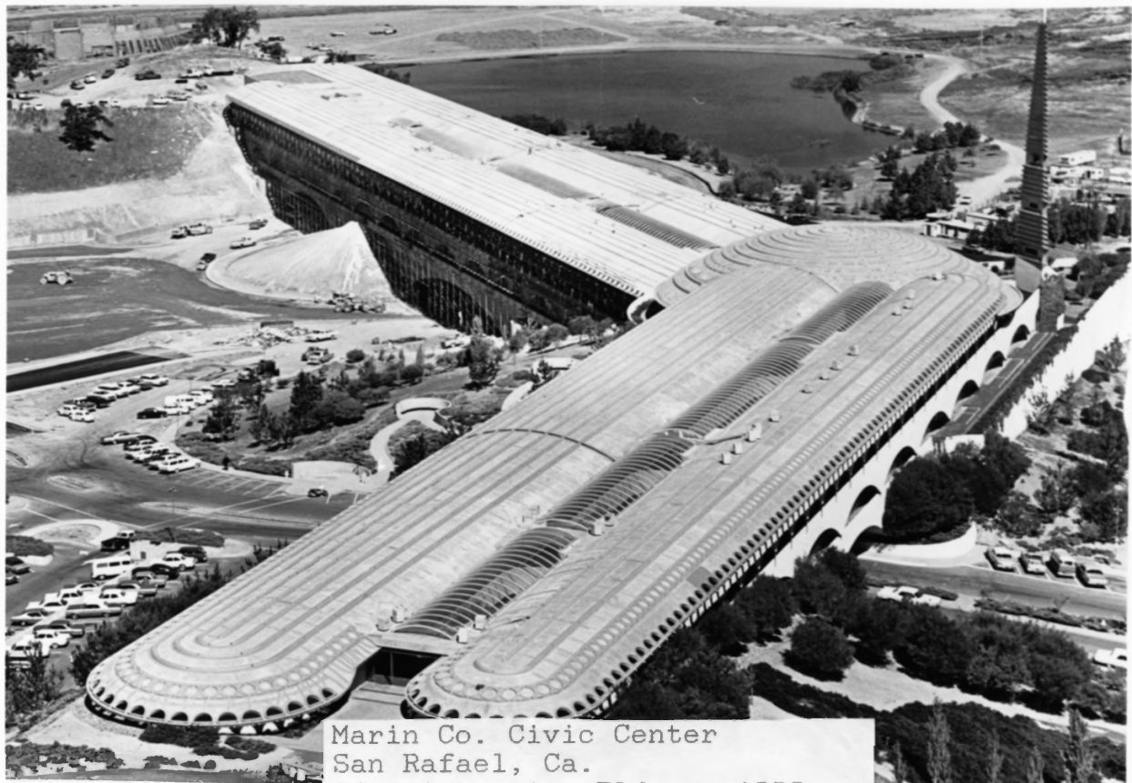
Marin Co. Civic Center San Rafael, Ca. Administration Bldg.c. 1958