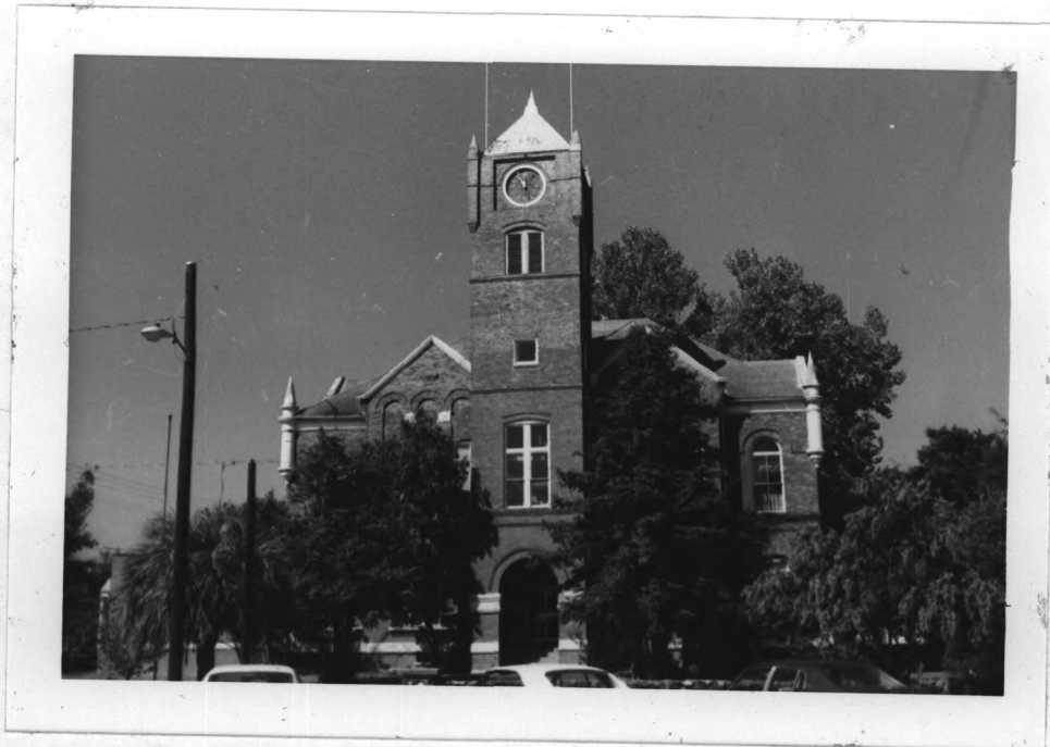
BAKER COUNTY COURTHOUSE