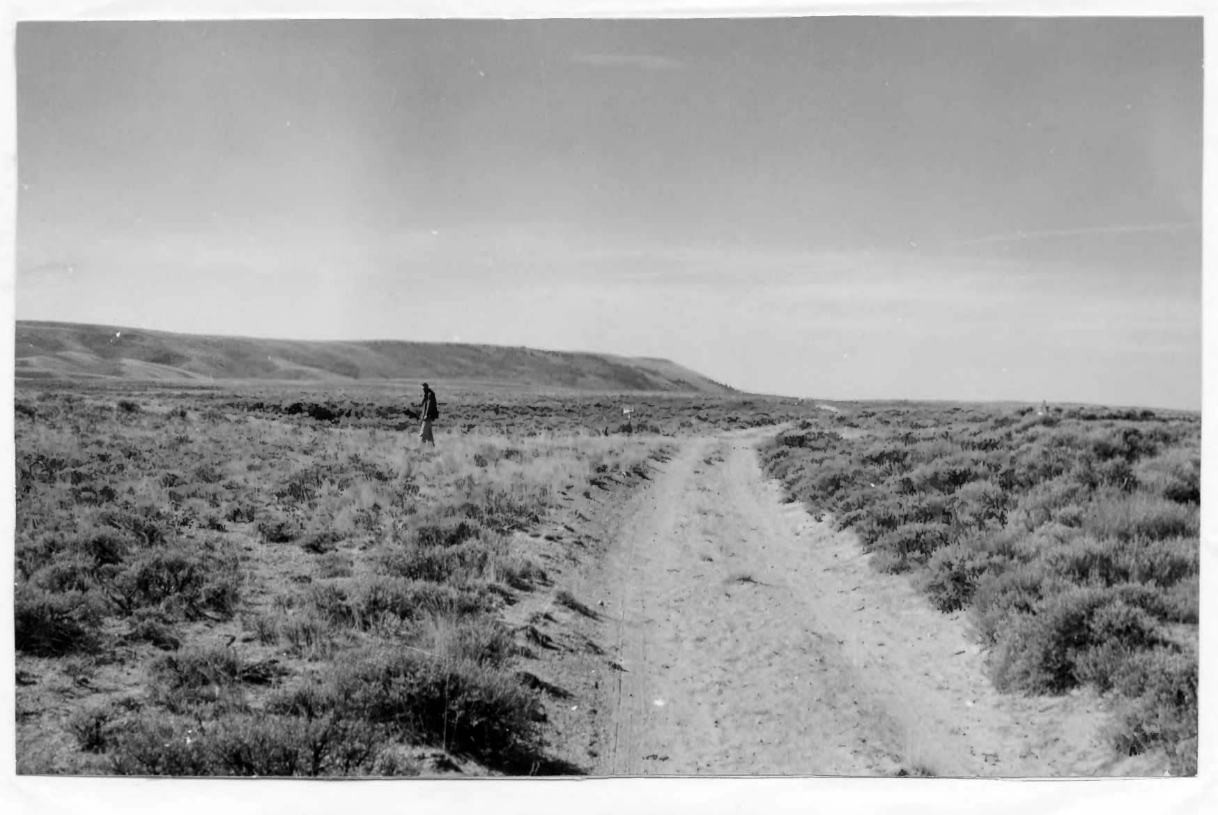
South Pass, located on the Continental Divide in Wyoming. To the emigrants of the 1840's and 1850's, it signified their entrance into the Oregon country.

National Park Service Photograph, October, 1958