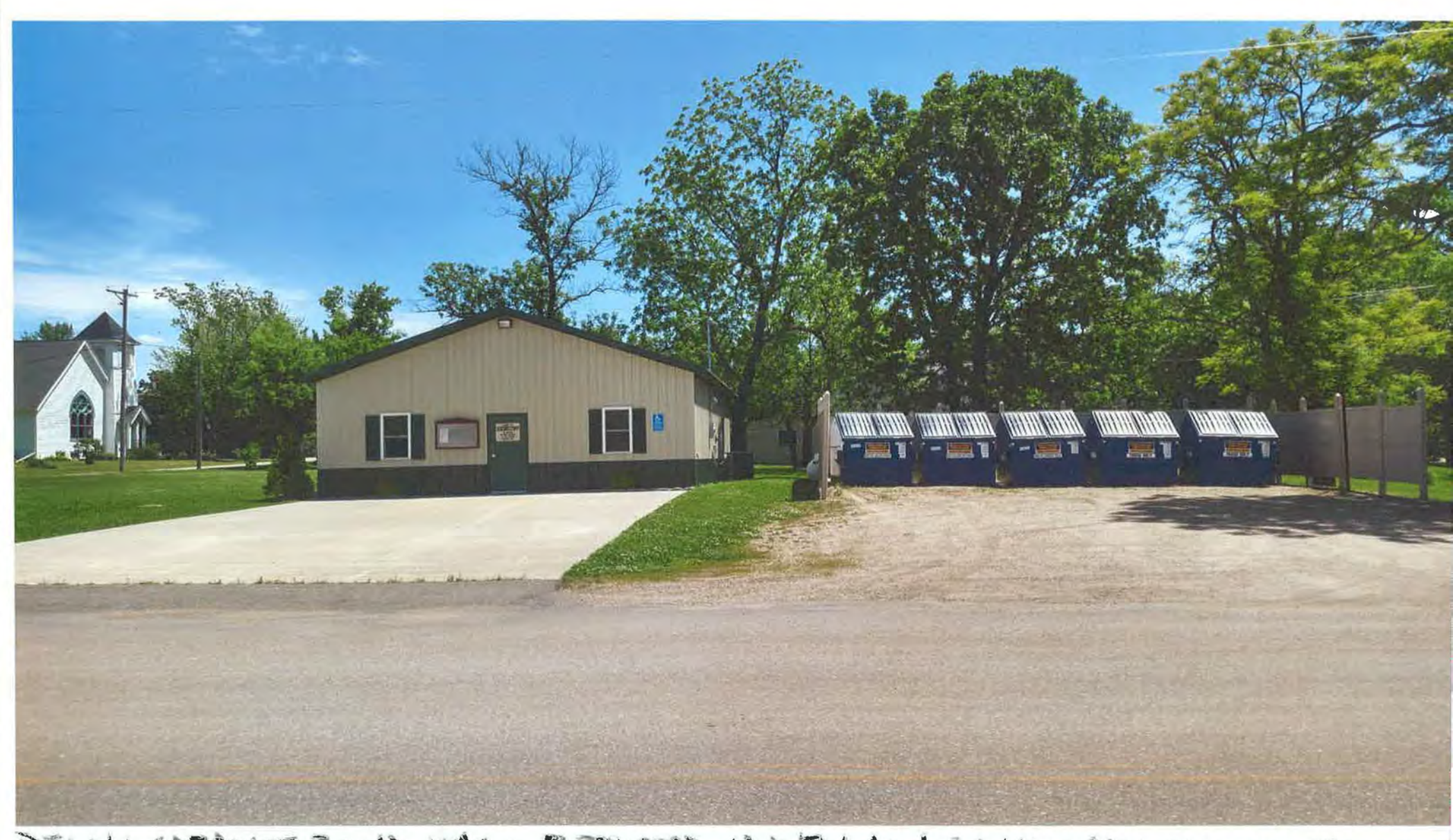
DELIHI CORONET BAND HALL REDWOOD COUNTY MN 30 MAY 2016 CAMERA FACING E