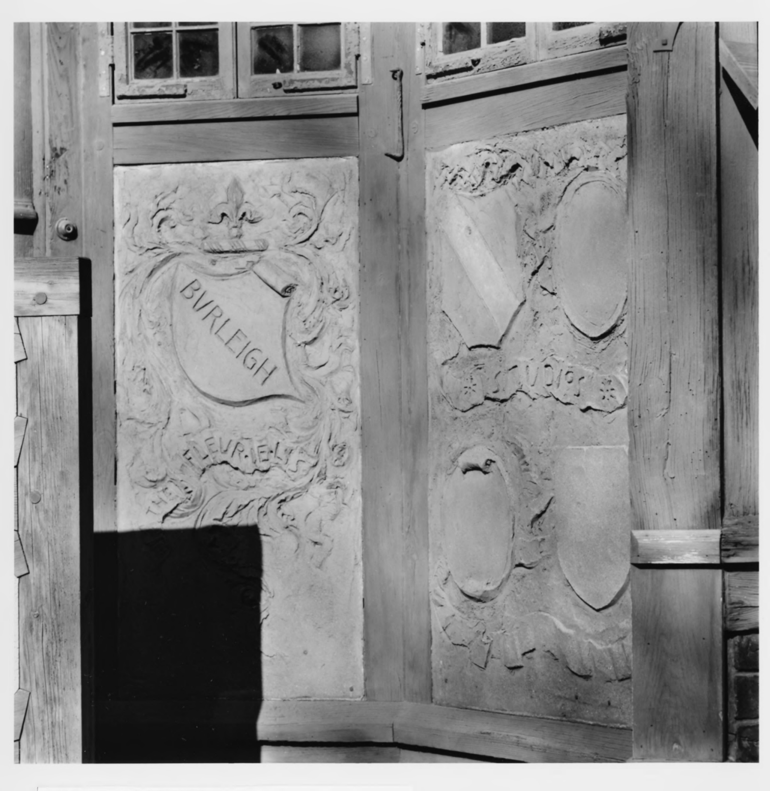
FLEUR-DE-LYS STUDIOS Providence, Rhode Island Detail of stucco work and windows at entrance Photo by B. Clarkson Schoettle, 11/91