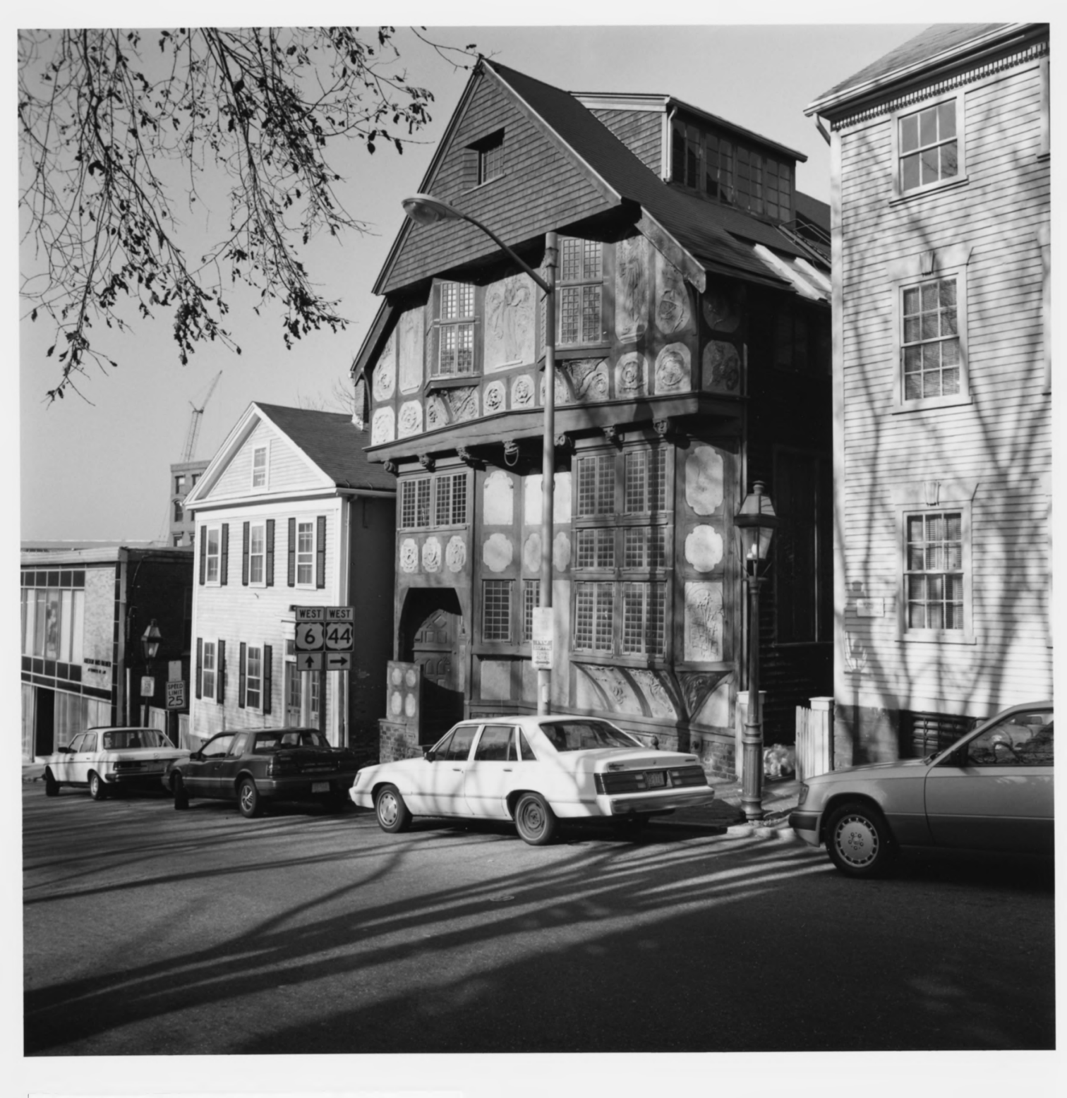
FLEUR-DE-LYS STUDIOS Providence, Rhode Island Front facade on Thomas Street Photo by B. Clarkson Schoettle, 11/91