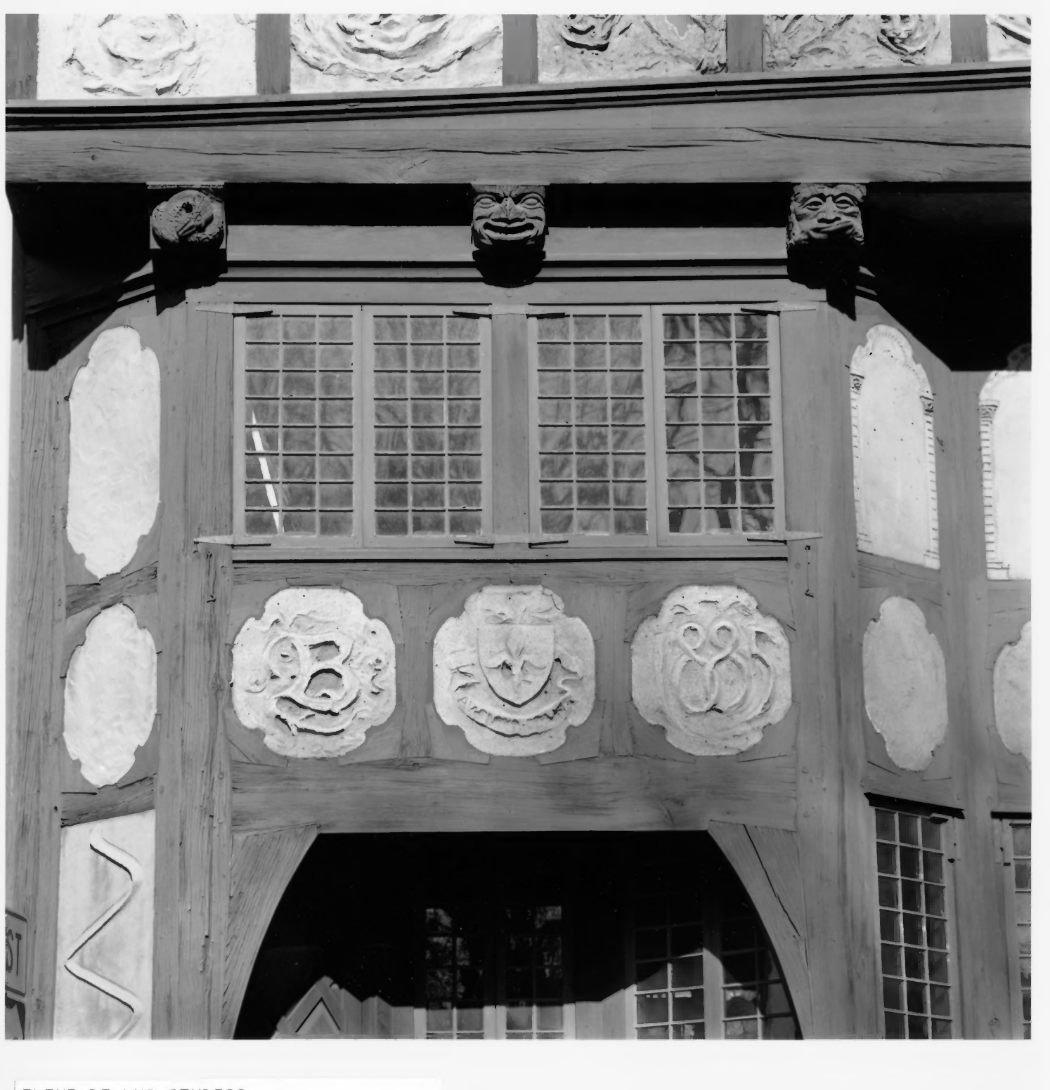
FLEUR-DE-LYS STUDIOS Providence, Rhode Island Detail of oriel window above entrance Photo by B. Clarkson Schoettle, 11/91