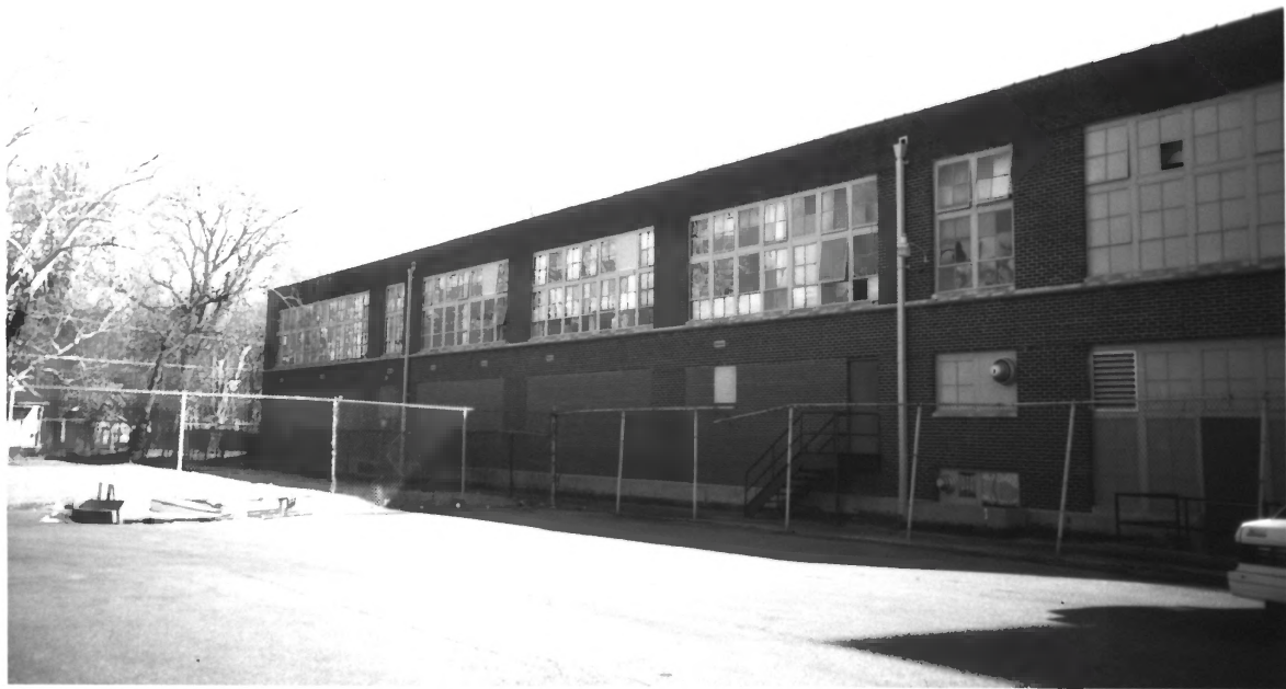
HUMES L.C. HIGH SCHOOL SHELBY CO., TN 9 OF 20