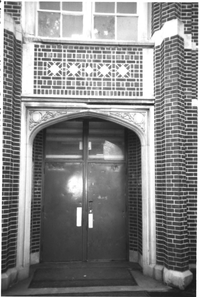
HUMES, L C HIGH SCHOOL SHEPHERD CO. IN ILLINOIS