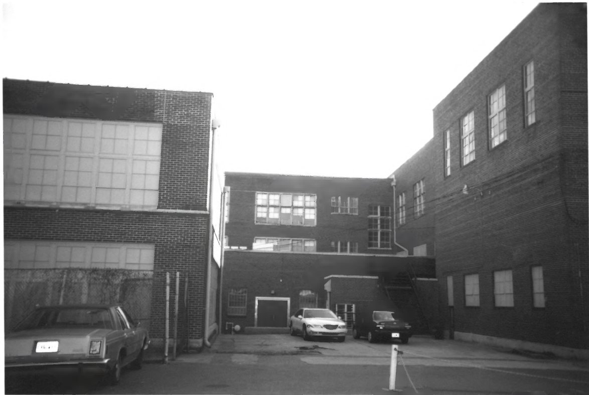
HUMES L.C. HIGH SCHOOL SHELBY CO. TN. 10 OF 20