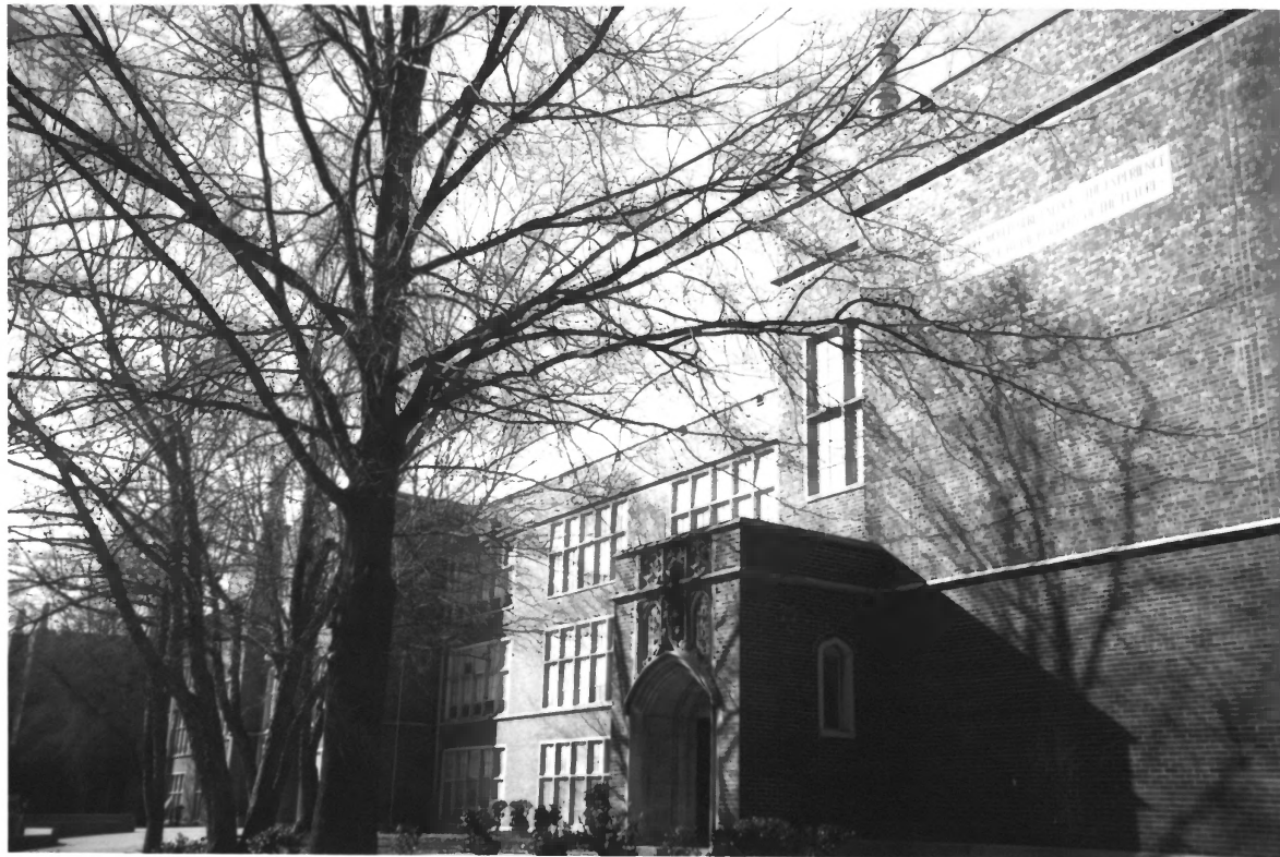
HUMES, L.C. HIGH SCHOOL SHELBY CO. TN 3 OF 20