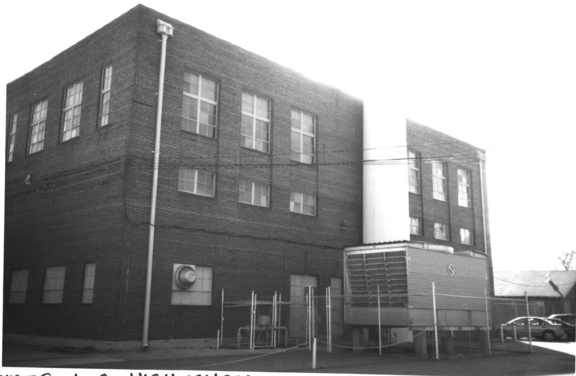
HUMES, L.C. HIGH SCHOOL SHELBY CO. TN. 11 OF 26