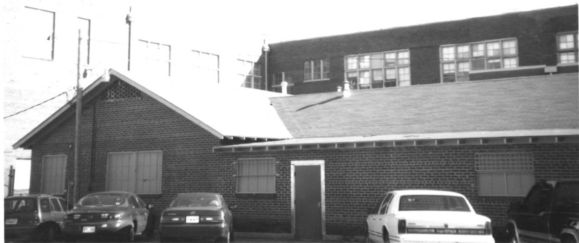
HUMES, L.C. HIGH SCHOOL SHELBY CO., TN 13 OF 26