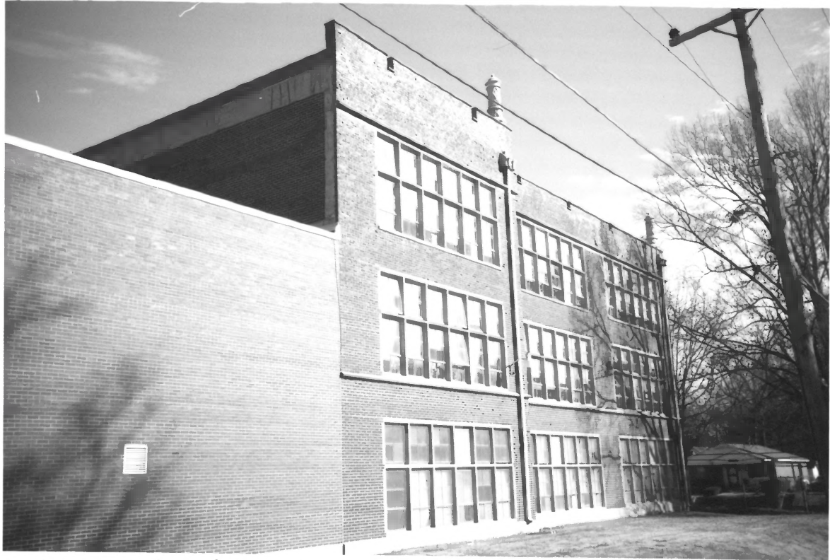
HUMES, L. C. HIGH SCHOOL SHELBY CO., TN 14 OF 26