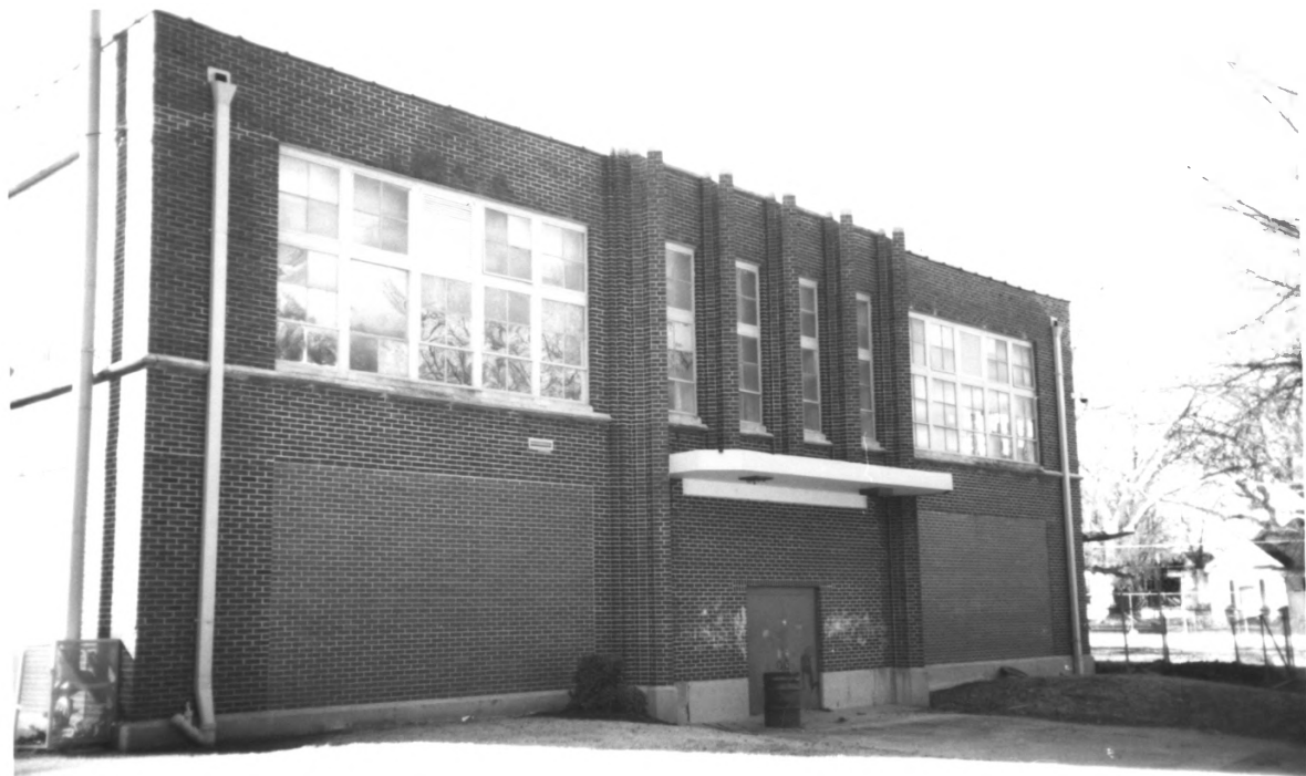
HUMES, L. C. HIGH SCHOOL SHELBY CO. TN 80F 260