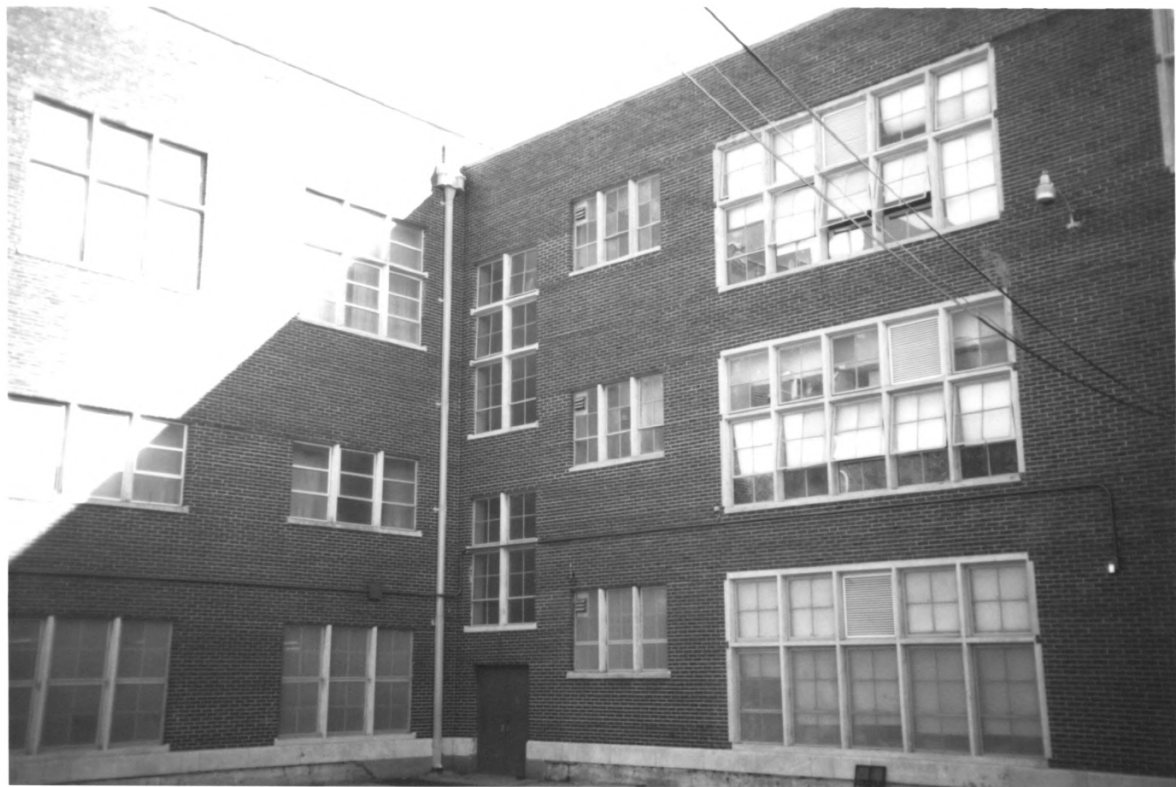
HUMES, L.C. HIGH SCHOOL SHELBY CO., TN. 12 OF 26