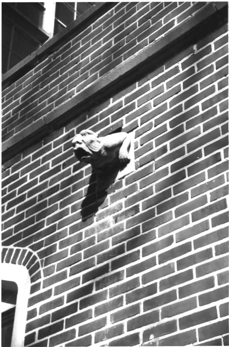
Humes, U.C. HIGH SCHOOL SHELBY CO, TN 60F26