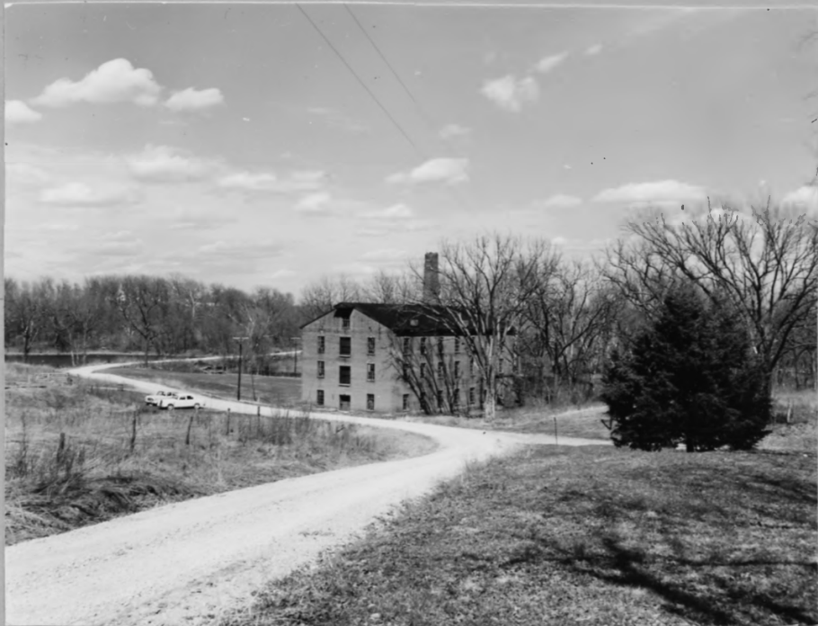
April 1962

Watkins Woolen Mill near Kearney, Missouri. It was erected about 1861 and was abandoned in 1886. Camera pointing to the northeast.