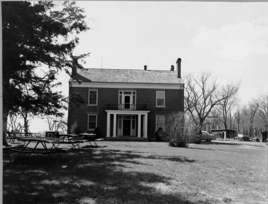
April 1962.