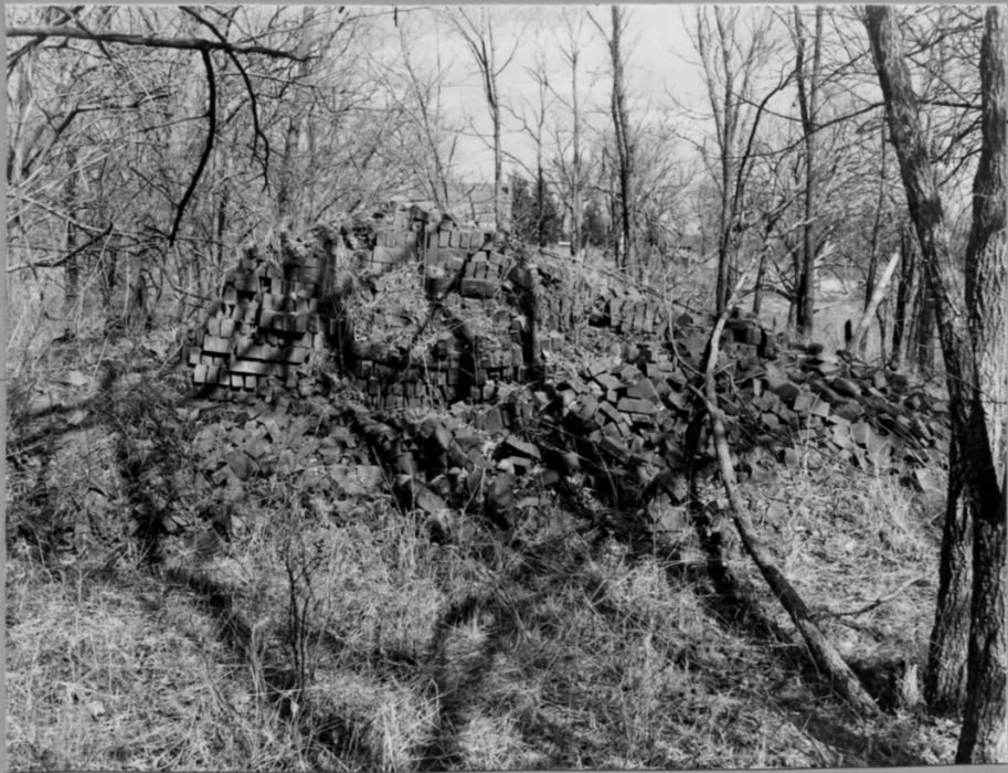
April 1962