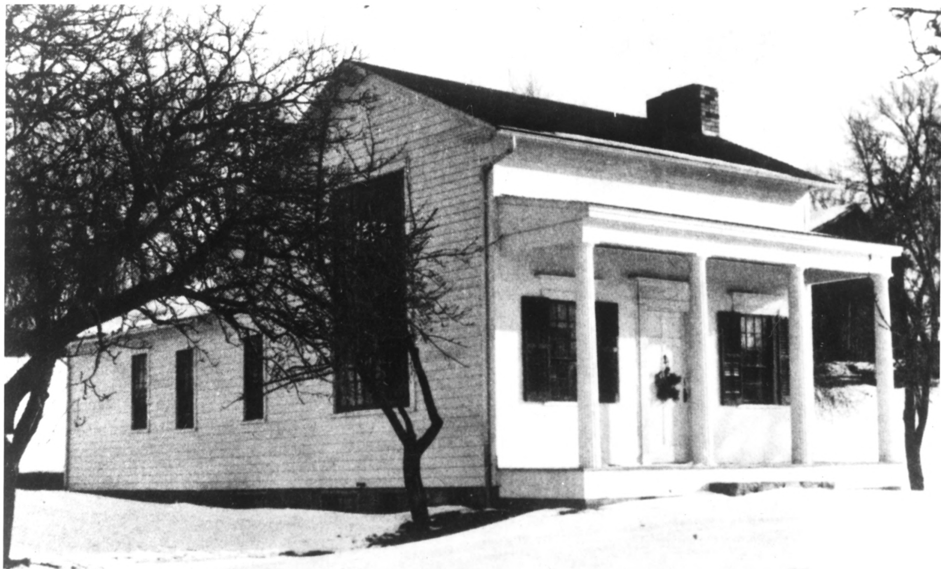
Millard Fillmore House, c.1950. East Aurora. New York.