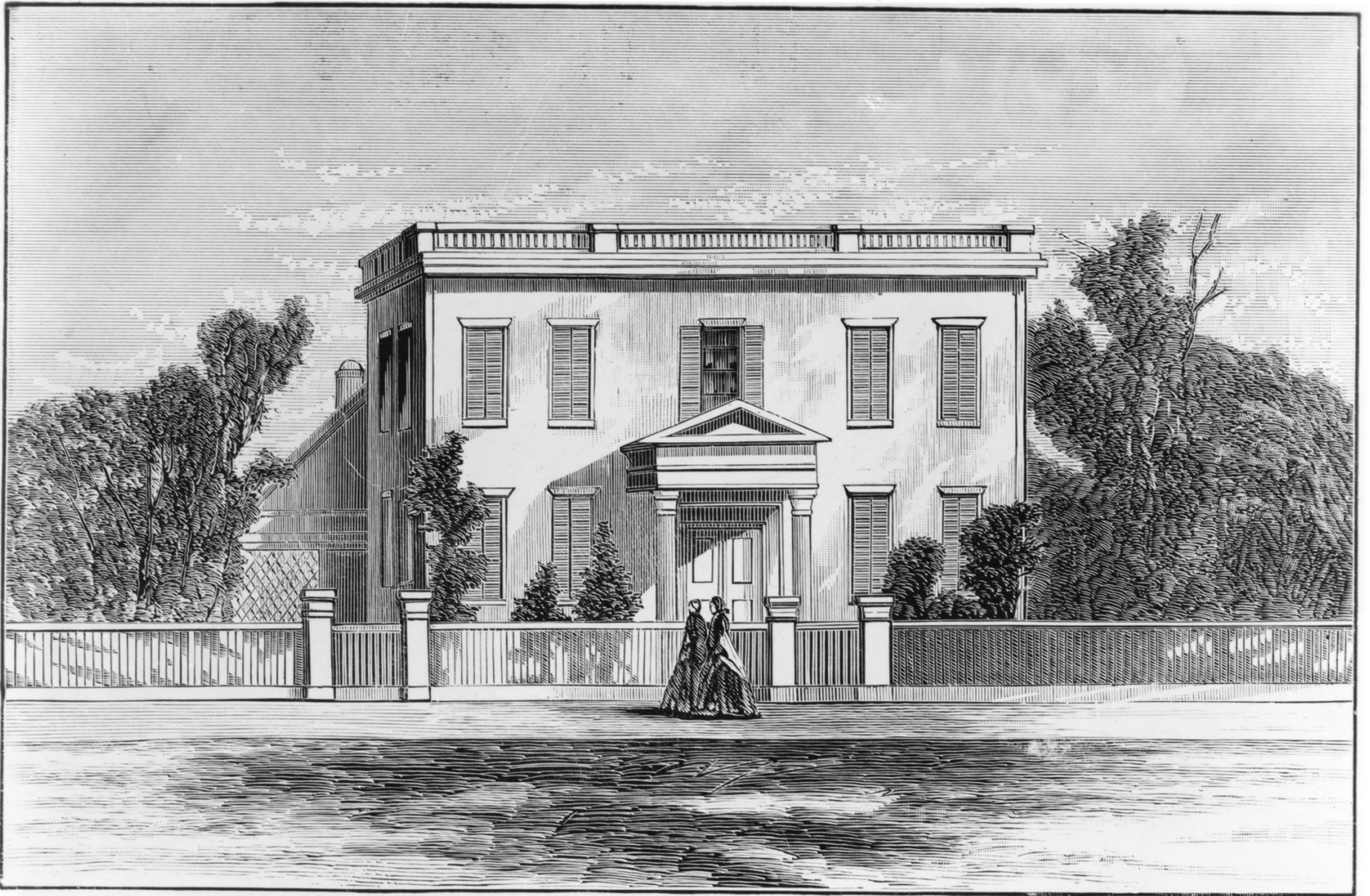
RESIDENCE OF MILLARD FILLMORE.