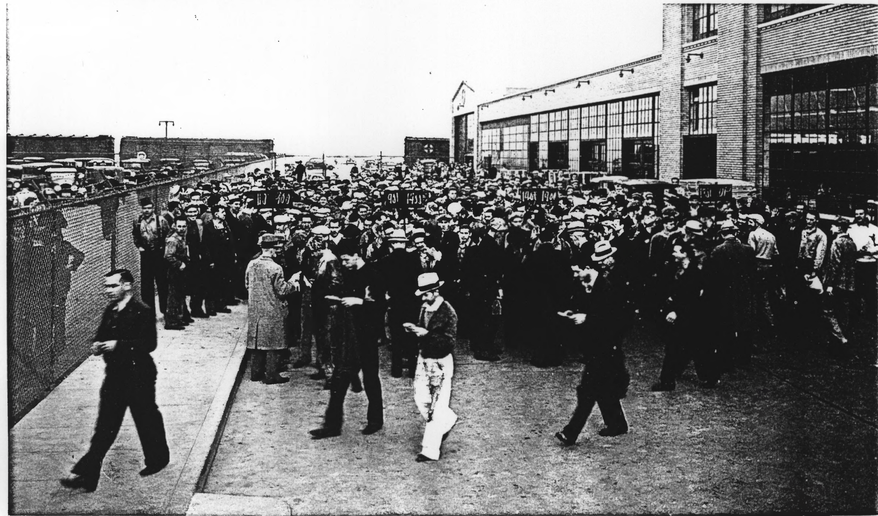
THE IMPORTANCE OF PAYROLLS IS FITTINGLY DRAMATIZED WHEN 2,000 WORKERS RECEIVE THEIR CHECKS AT AN AUTOMOBILE PLANT IN RICHMOND.