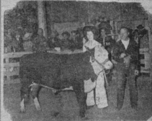
Champion 4-H, FFA Steers