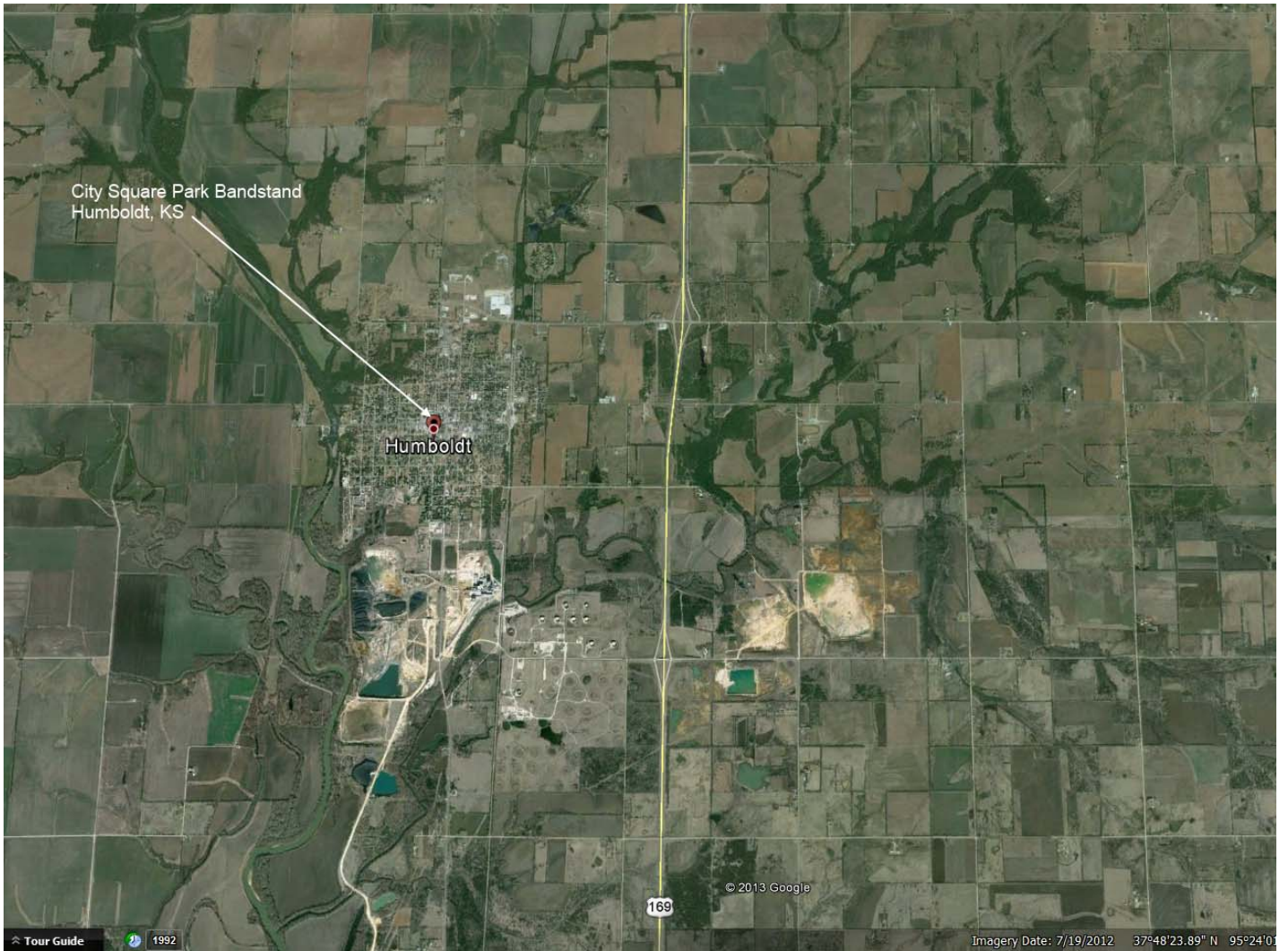
Figure 1: Contextual Map, Google Earth. Humboldt, KS. Accessed 16 September 2013.