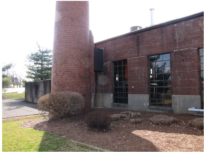
Boiler House and Laundry