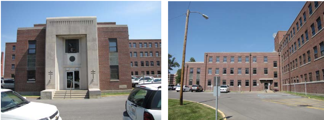
Main Hospital Building

The main hospital building at Madisonville Tuberculosis Hospital consists of a modified cross/t-shaped plan, described as an "off-center T" (Claytor, 1). Composed primarily of brick in a running bond pattern, the main building is multi-story with the back cross-section the highest at four stories. The hospital's flat roofs are trimmed with coping caps while scuppers filter rain into metal gutters. The combination windows on all elevations contain marble-stone sills. On the two-story front façade, the windows are articulated in bays flanking the main entrance. The metal gutters visually divide bays of window into sections on each elevation. The original solaria, one located on each of the four floors, highlight the use of windows to provide fresh air and a view of the landscaped grounds.