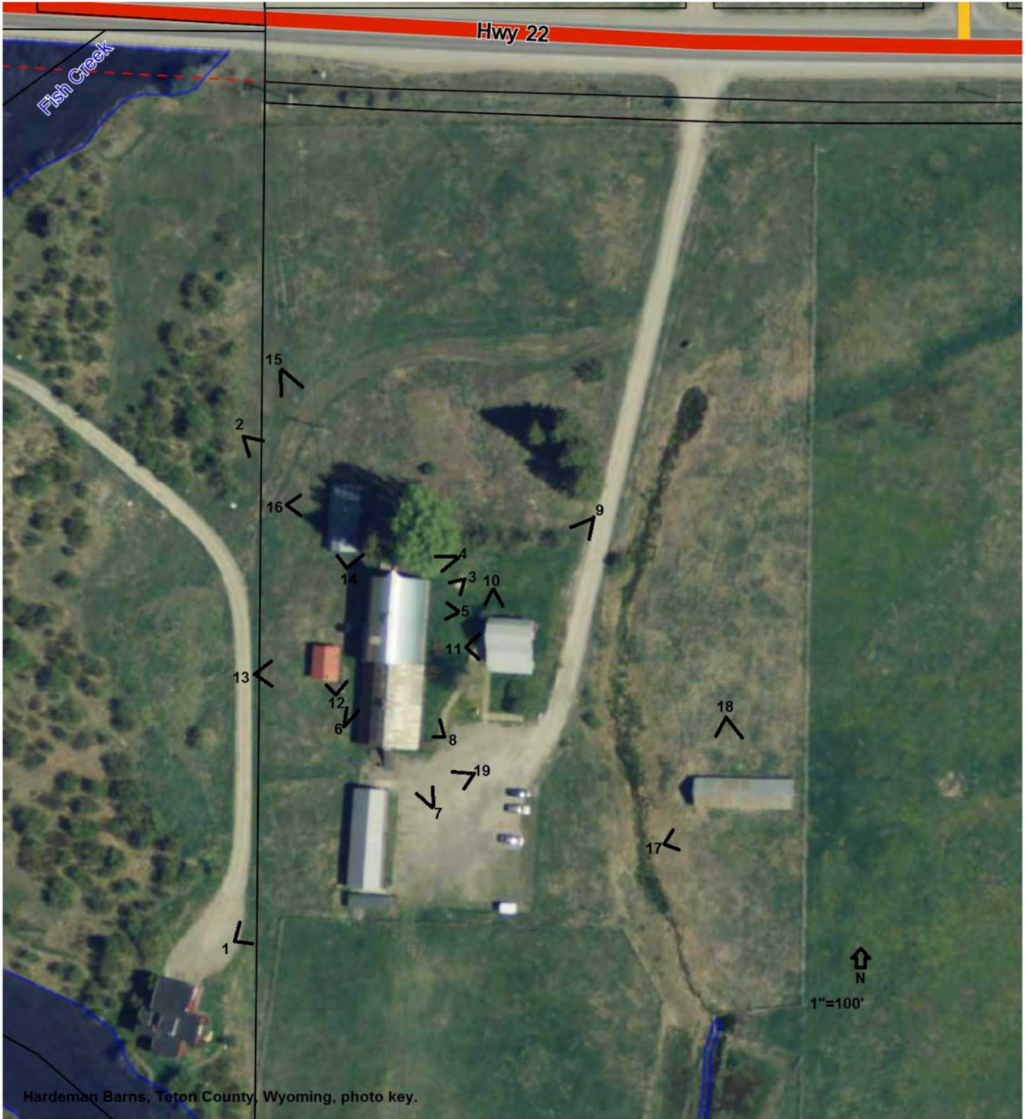
Hardeman Barns, Teton County, Wyoming, photo key.