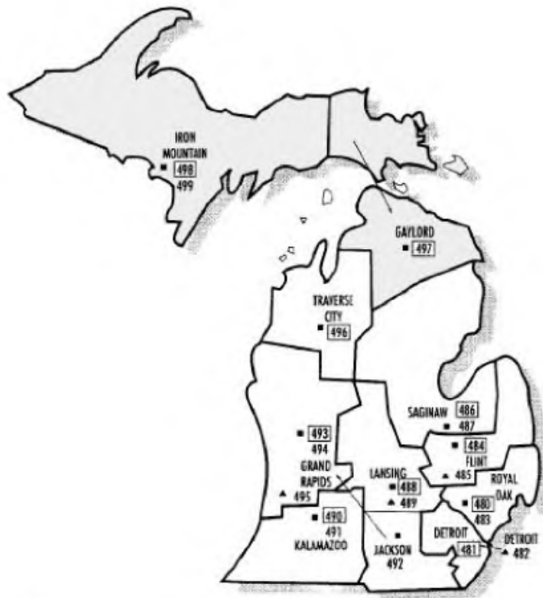
Figure B.1. Map depicting three-digit zip code regions in Michigan with local zip codes shaded.