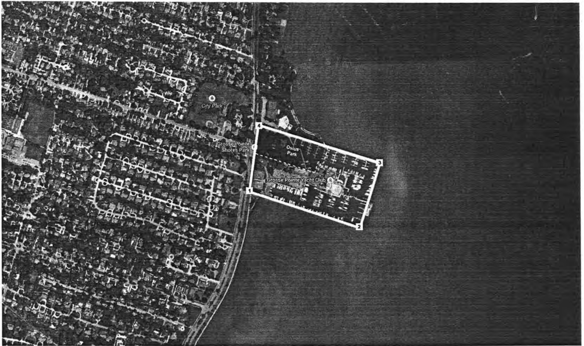
Grosse Pointé Yacht Club, Grosse Pointe Shores, Wayne County, Michigan