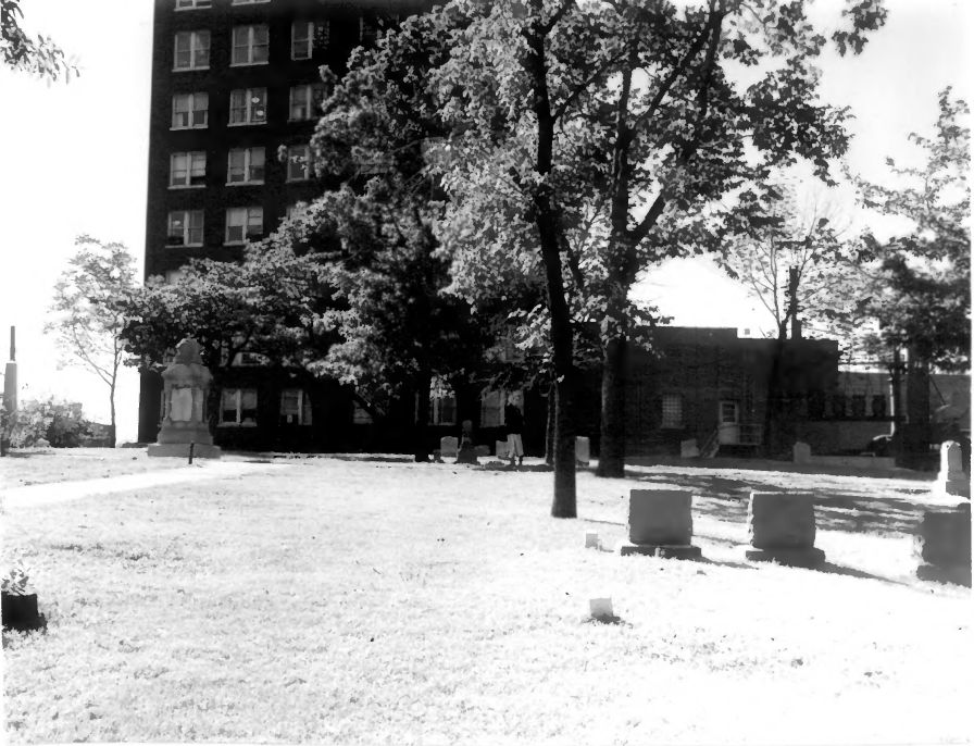
Huron Cemetery, Kansas City, Kansas. East view. Large office building may be seen in the background. Photograph by Ray H. Mattison, September 1958. Negative in Region Two Office Library, Omaha, Nebraska.