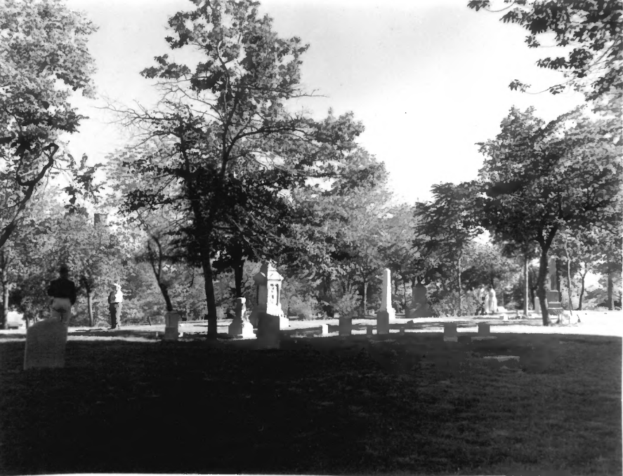
Huron Cemetery in Kansas City, Kansas. Northwest view.