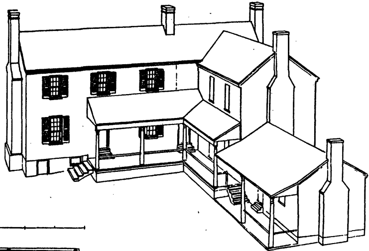
21. Rear of McCann House.