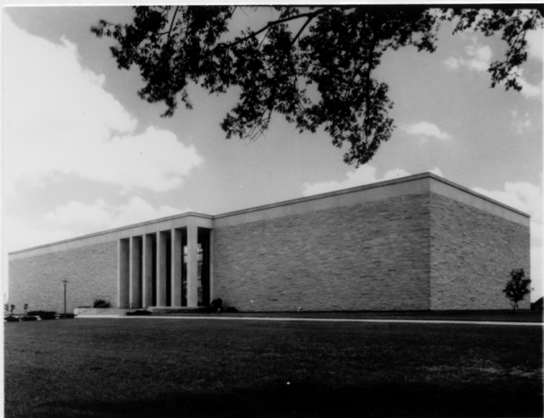
The Eisenhower Presidential Library.