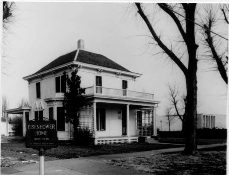
The Eisenhower boyhood home; Eisenhower Museum in background on right.