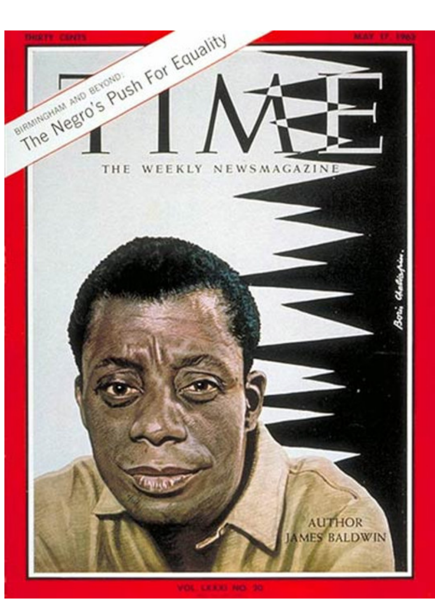
James Baldwin on the cover of Time Magazine, May 17, 1963