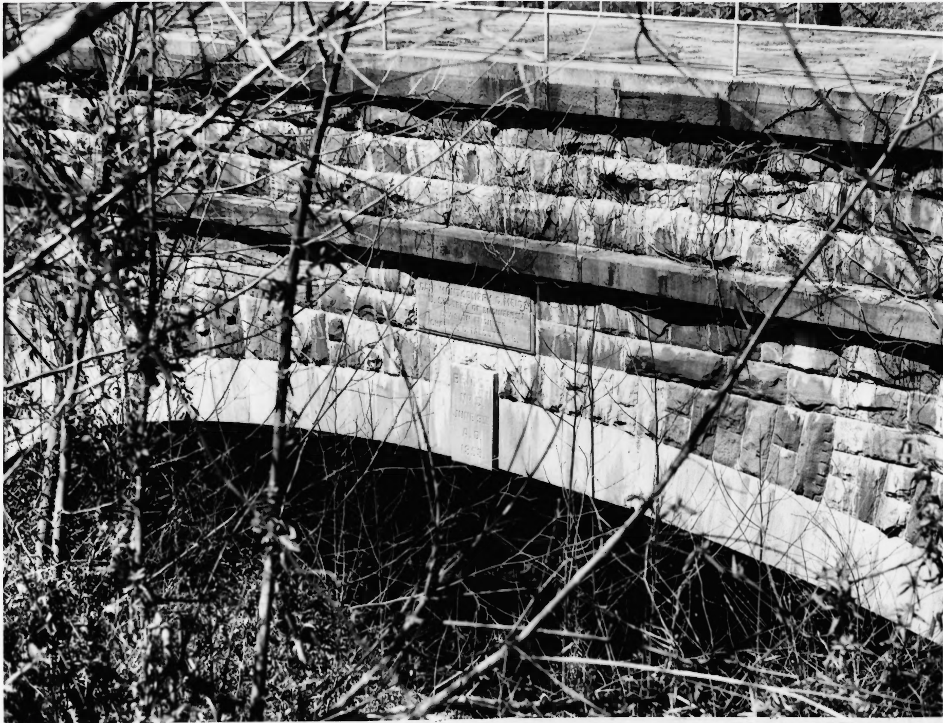
Washington Aqueduct, Bridge No. 3, Washington, D.C.