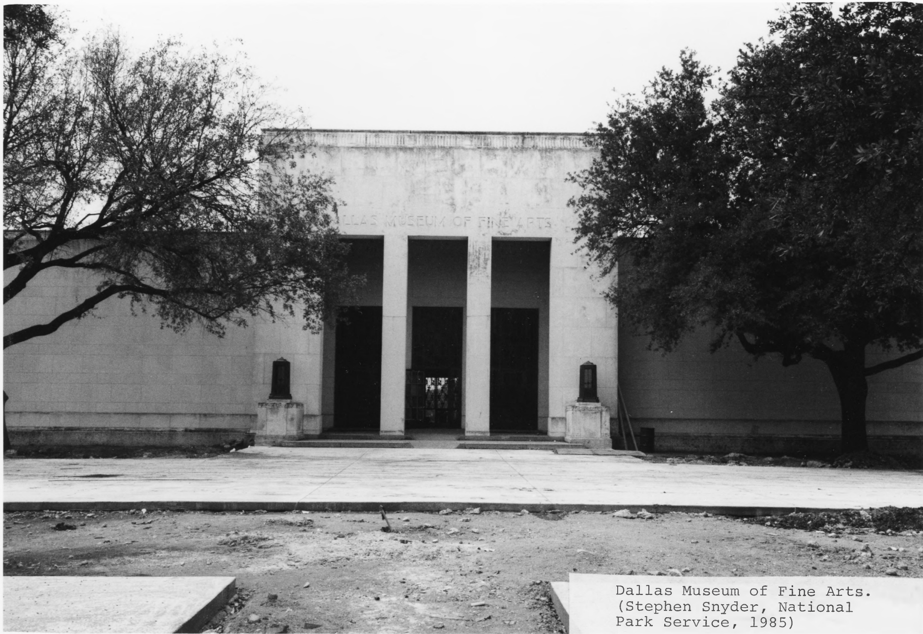
Dallas Museum of Fine Arts. (Stephen Snyder, National Park Service, 1985)