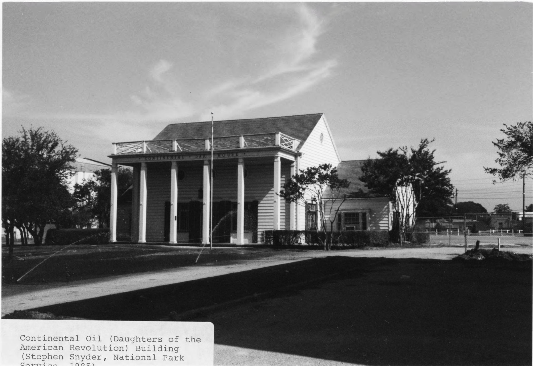
Continental Oil (Daughters of the American Revolution) Building