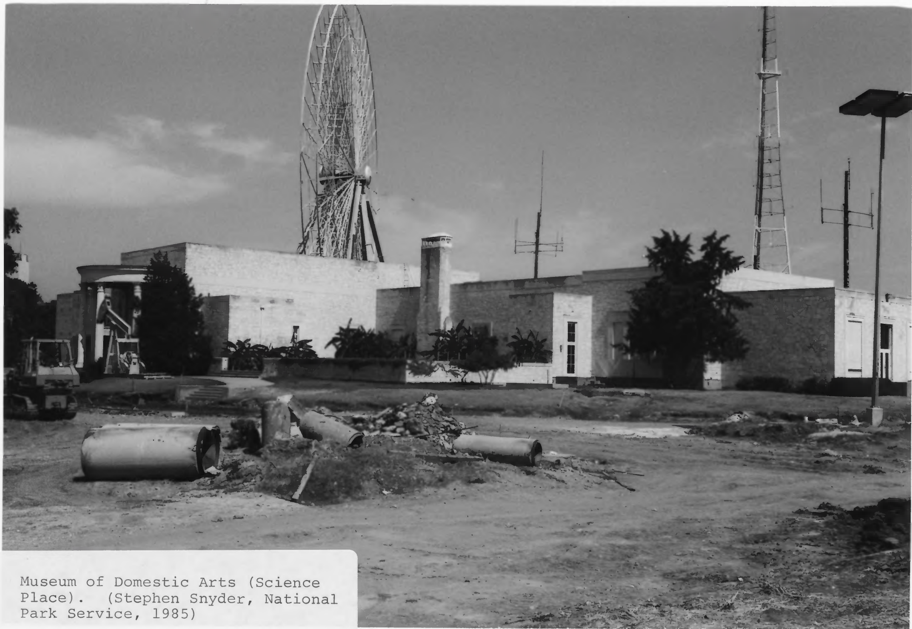
Museum of Domestic Arts (Science Place). (Stephen Snyder, National Park Service, 1985)