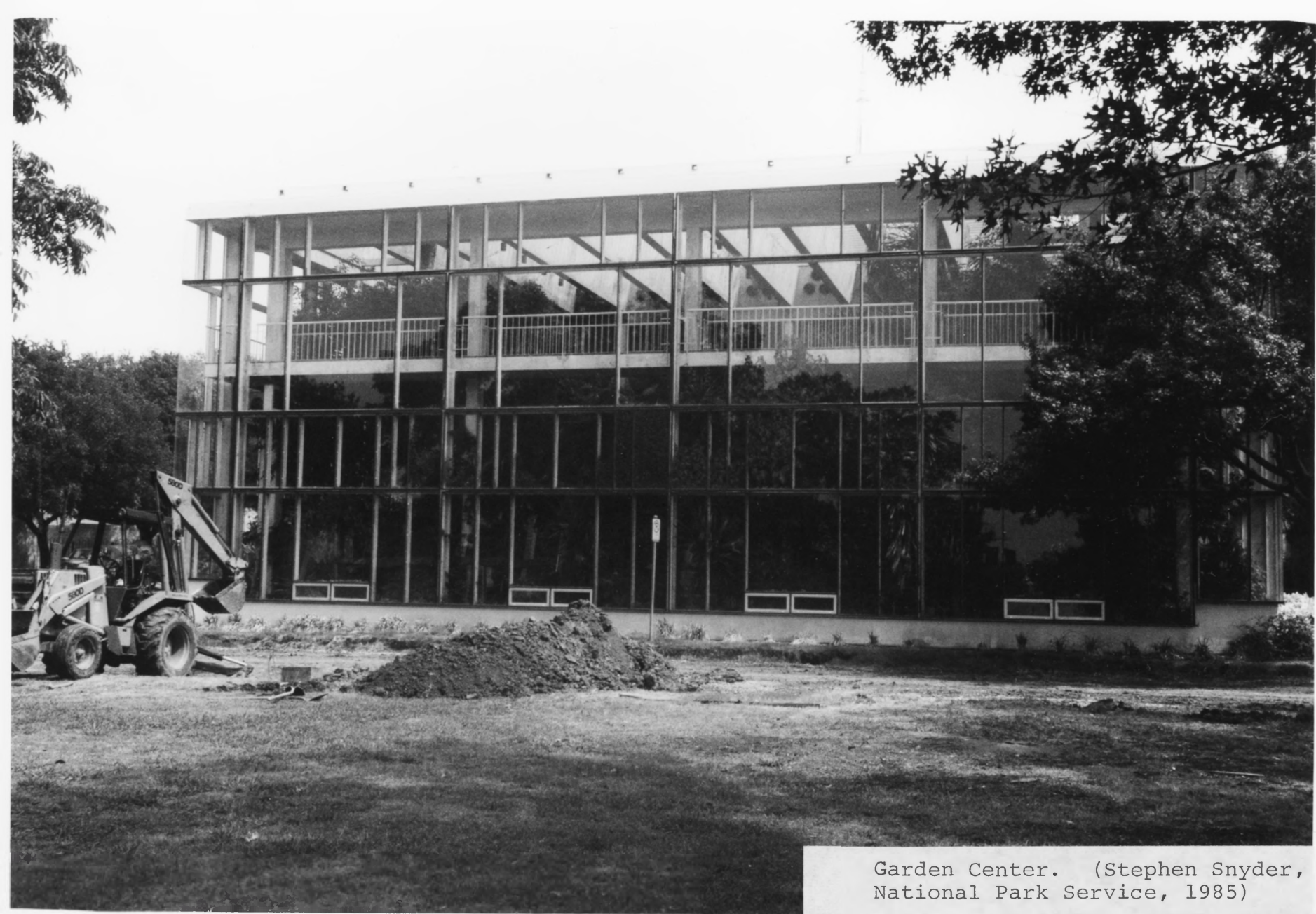
Garden Center. (Stephen Snyder, National Park Service, 1985)