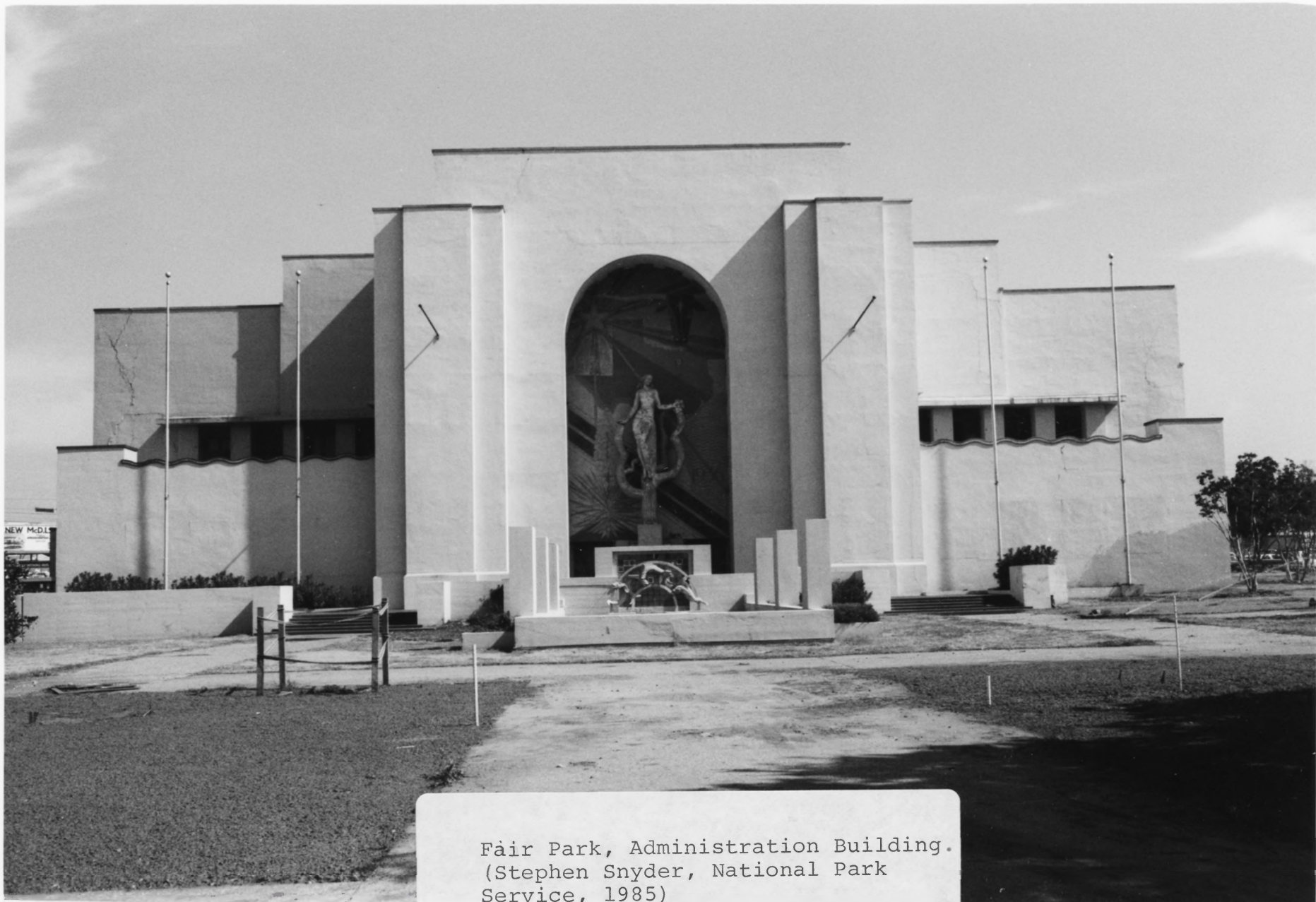
Fair Park, Administration Building.