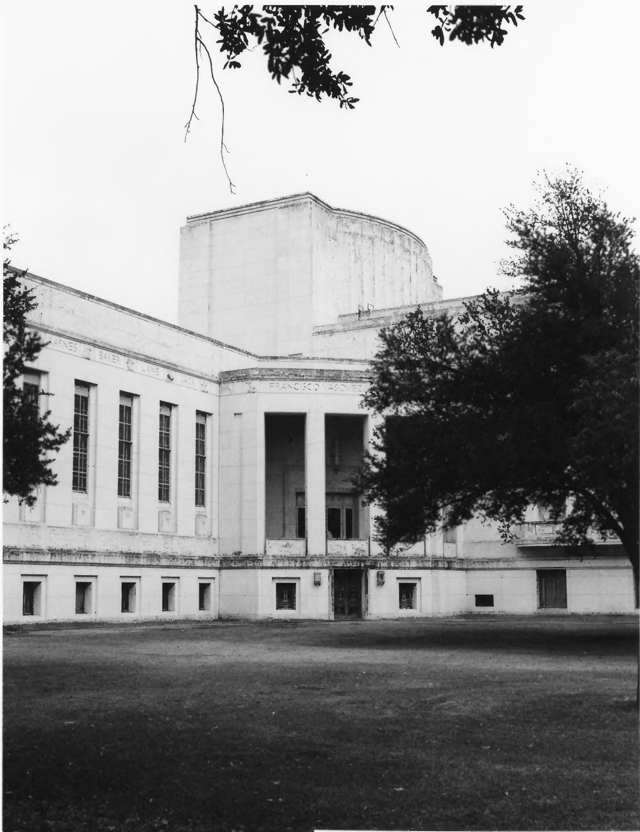
Hall of State, side.