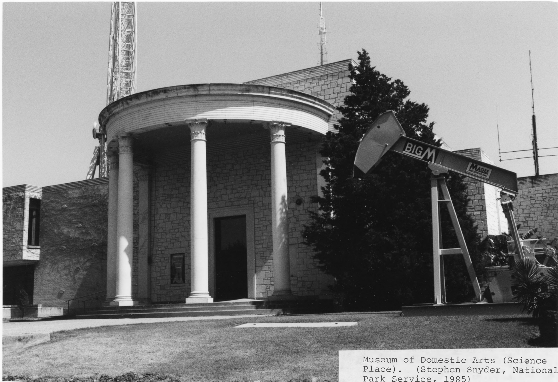
Museum of Domestic Arts (Science Place).