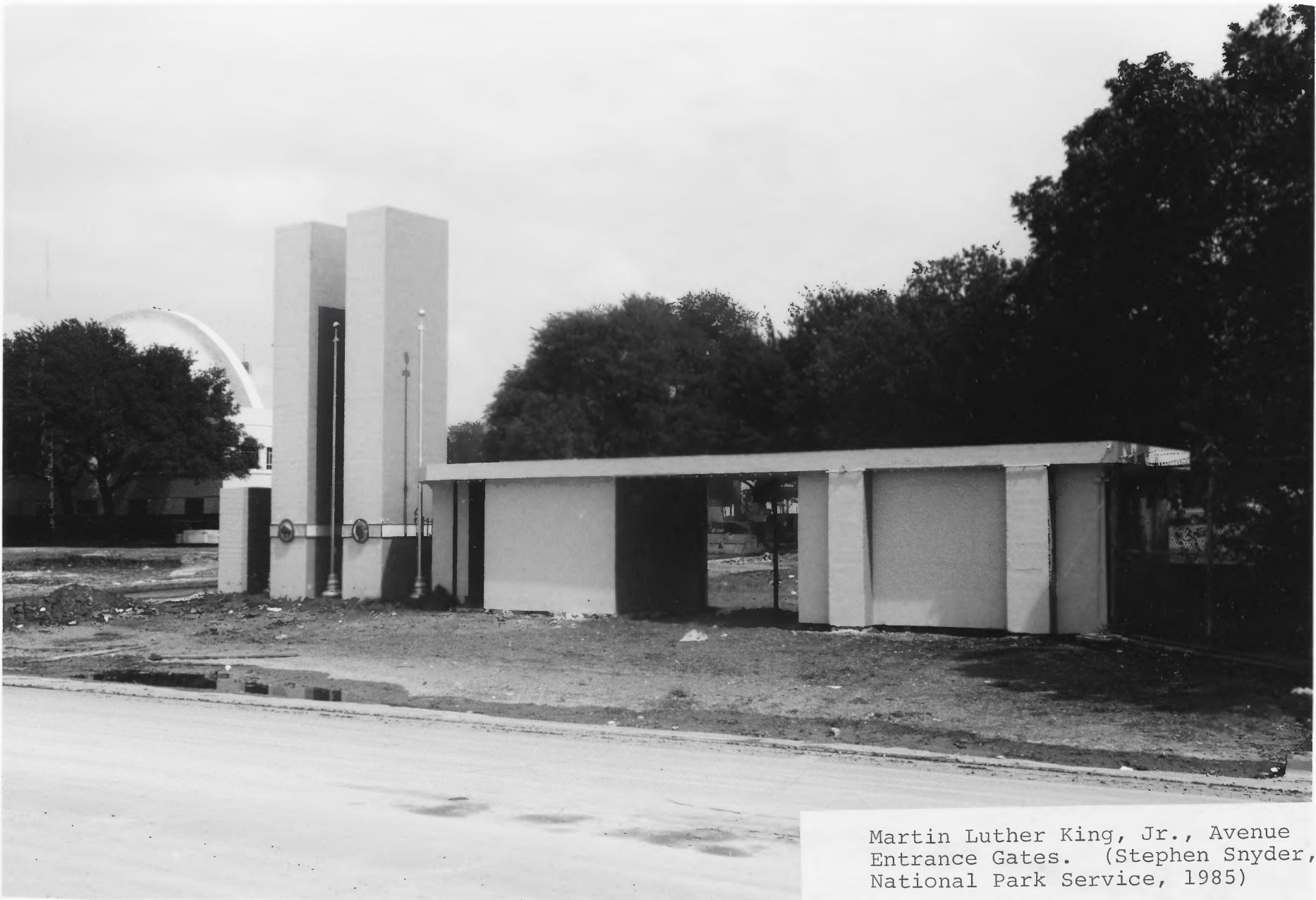
Martin Luther King, Jr., Avenue Entrance Gates.