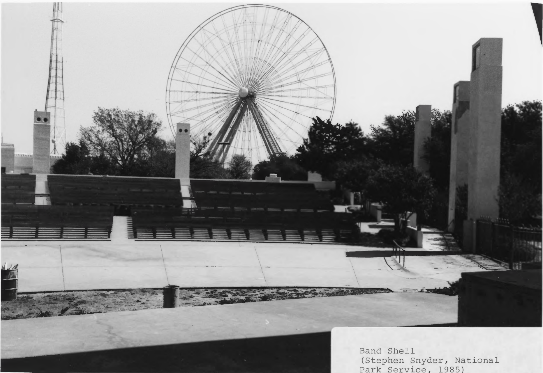
Band Shell