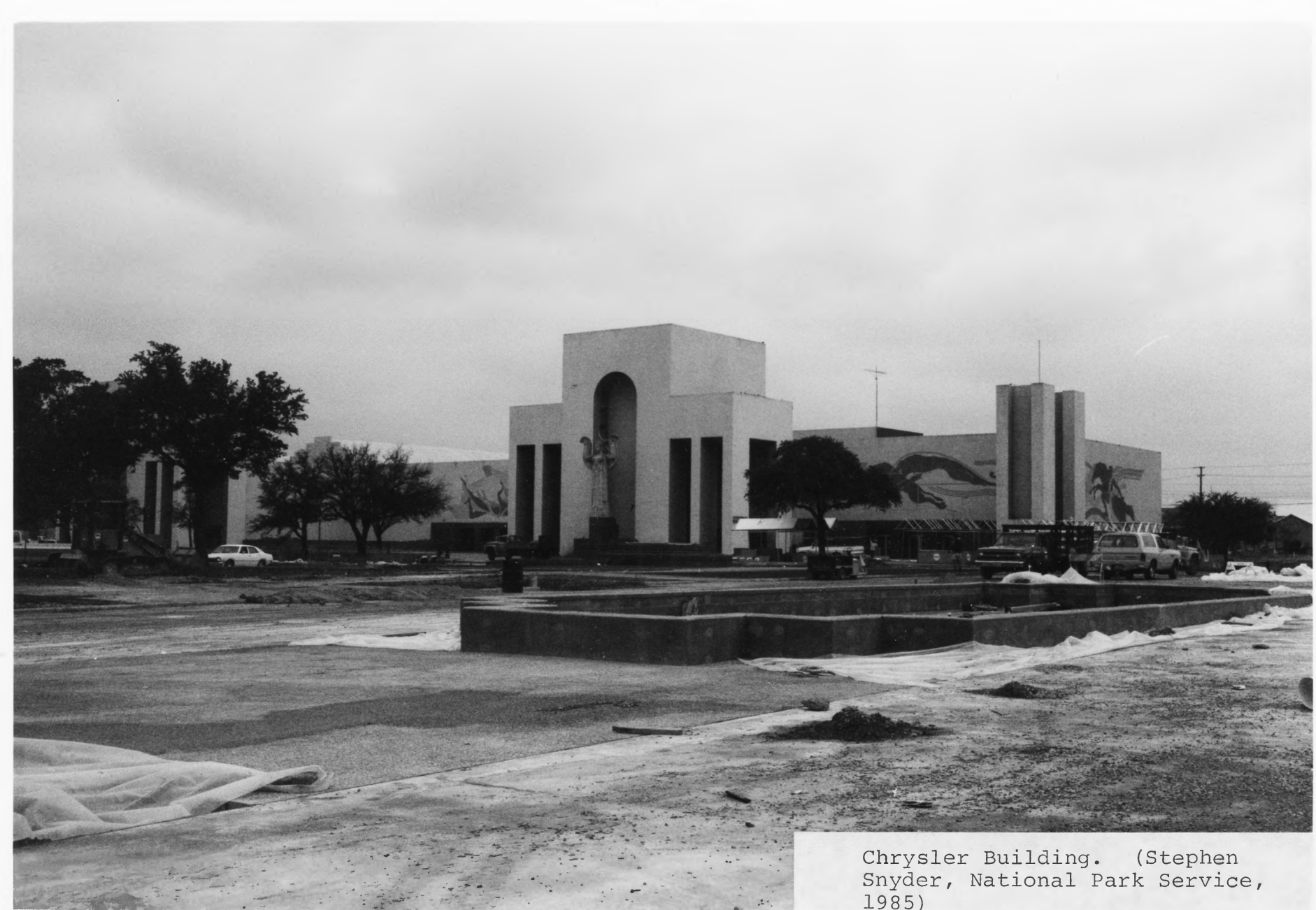
Chrysler Building.