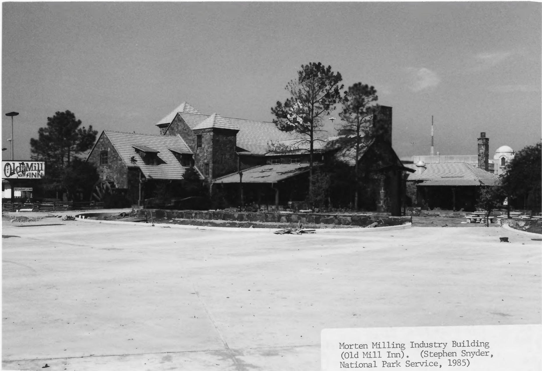
Morten Milling Industry Building (Old Mill Inn).