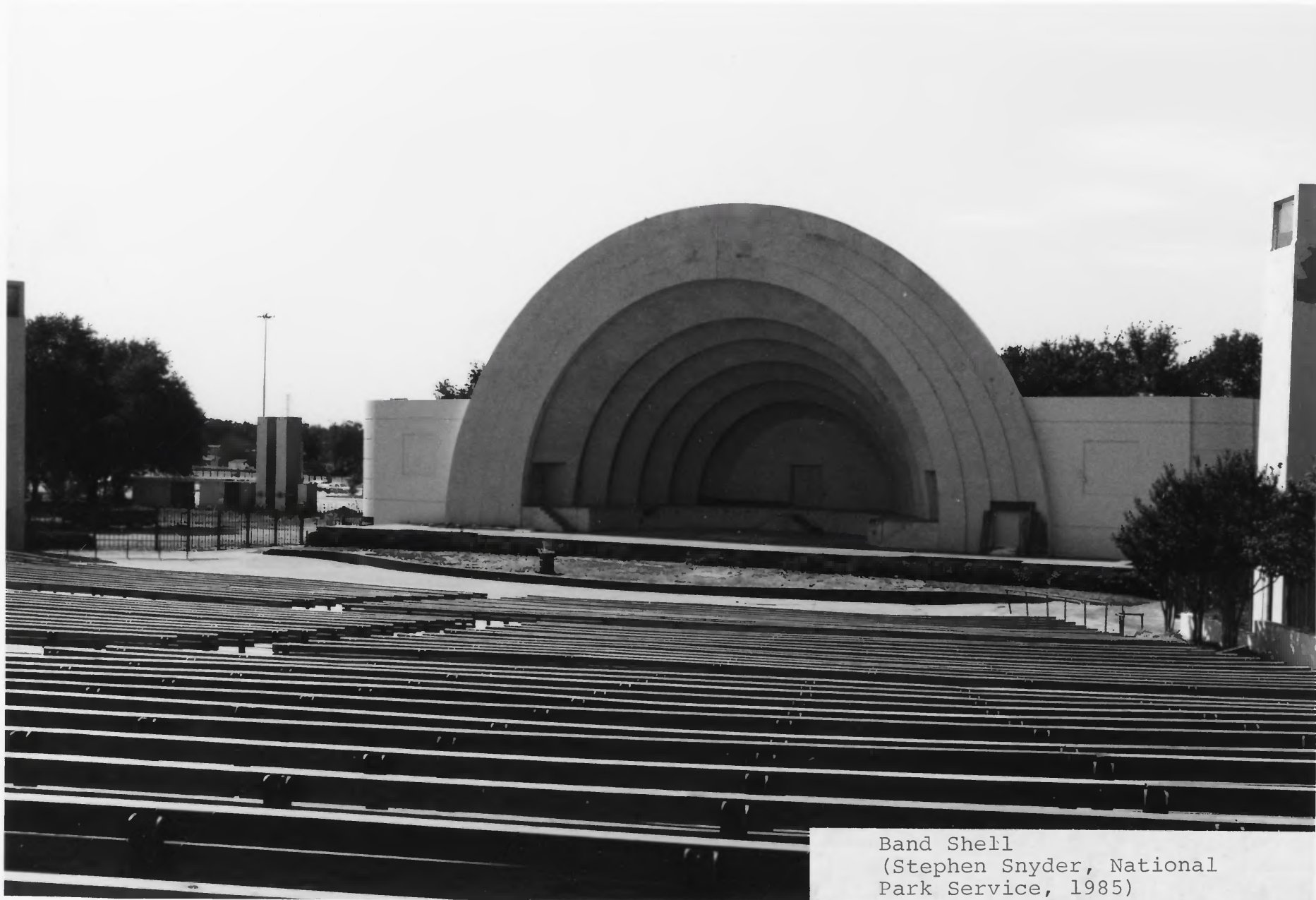
Band Shell