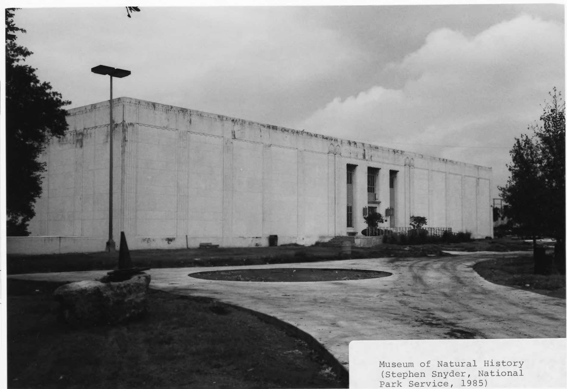
Museum of Natural History