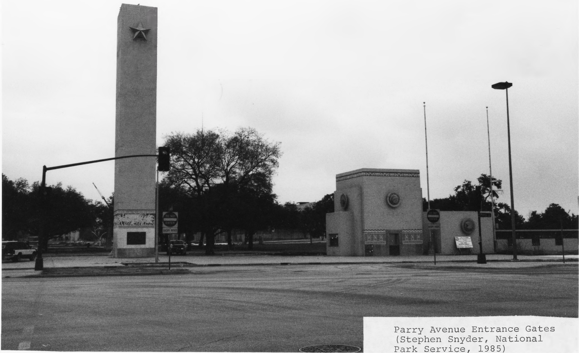
Parry Avenue Entrance Gates