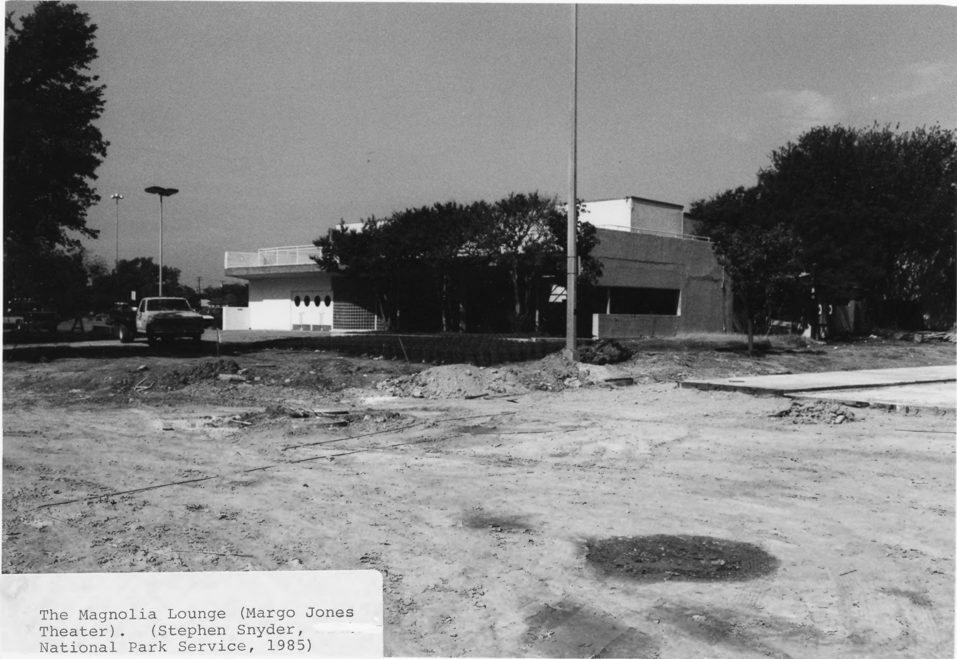
The Magnolia Lounge (Margo Jones Theater).