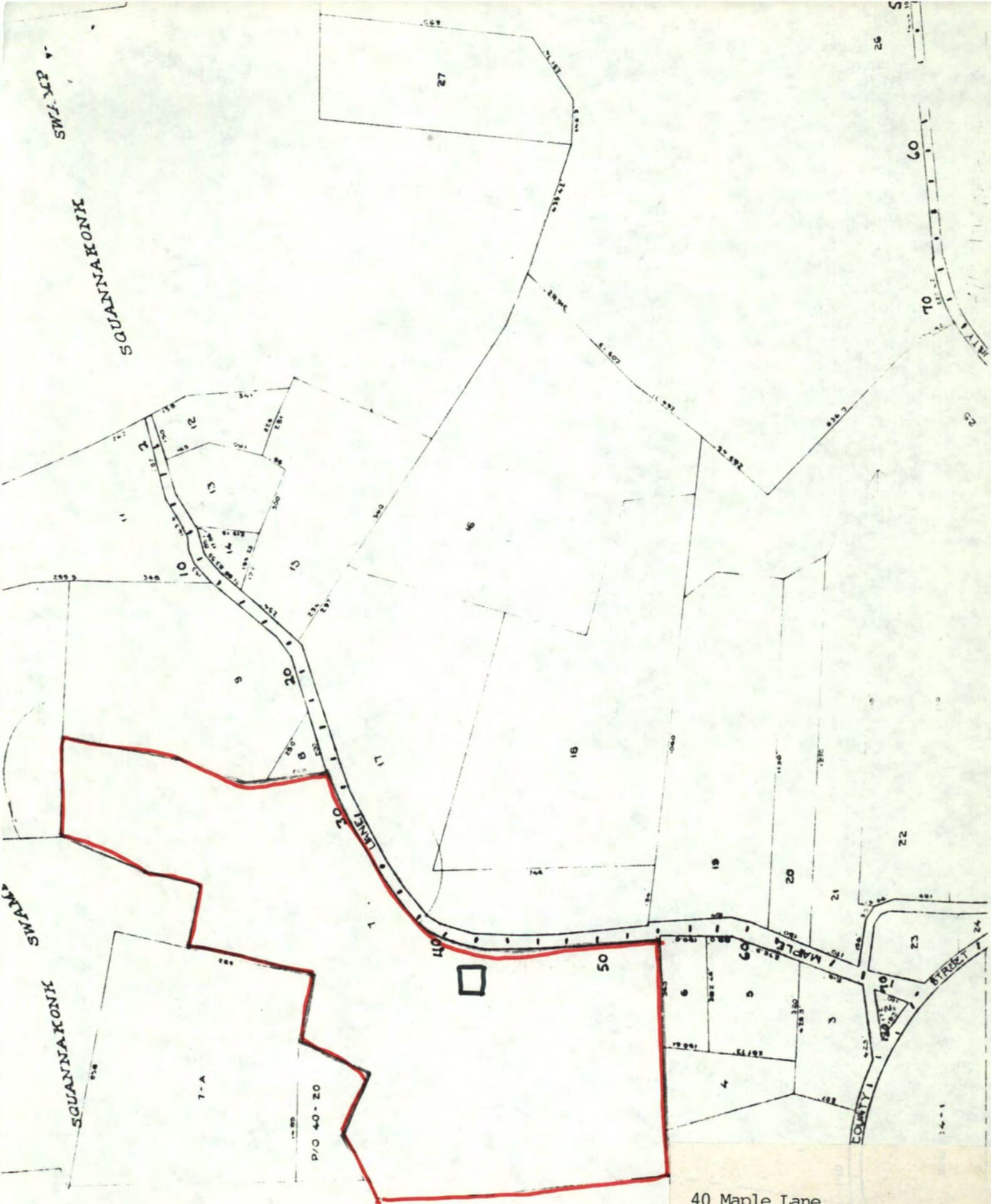
40 Maple Lane Goff Homestead (form 82) Town of Rehoboth Property Map scale 1"=200' 1978