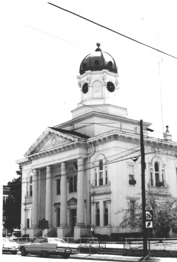
PULASKI COUNTY COURTHOUSE

As the center of local government, this courthouse has served as a focal point and the common headquarters for a sizeable area since it was built in 1874. It has evolved architecturally with major additions in 1897 and 1910. One of its most unique features is a chapel right outside the courtroom that is still in use.